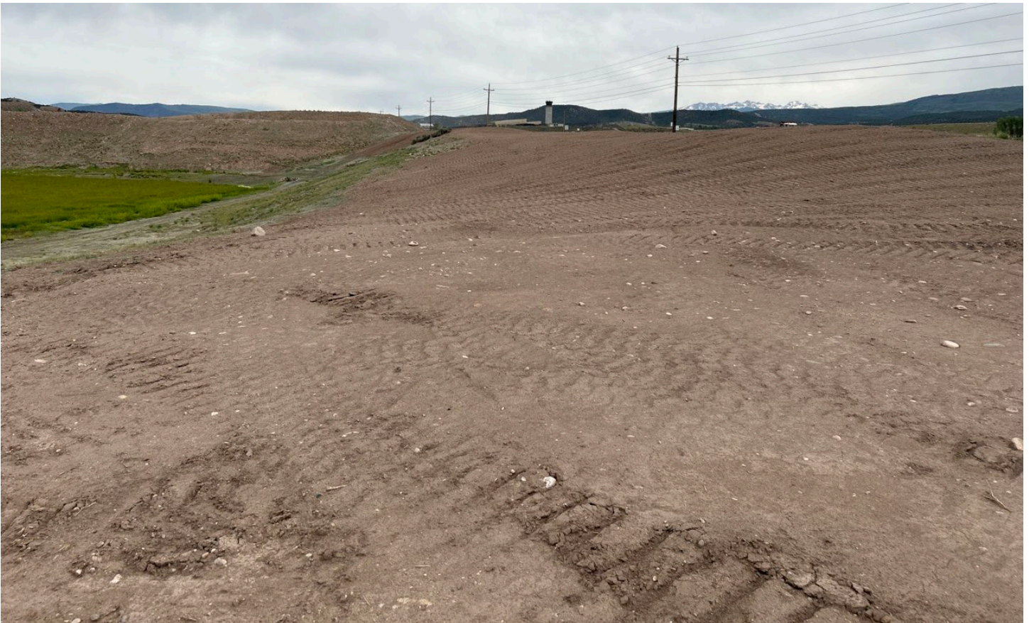
Figure 5: Regraded slope to south of pasture (293)