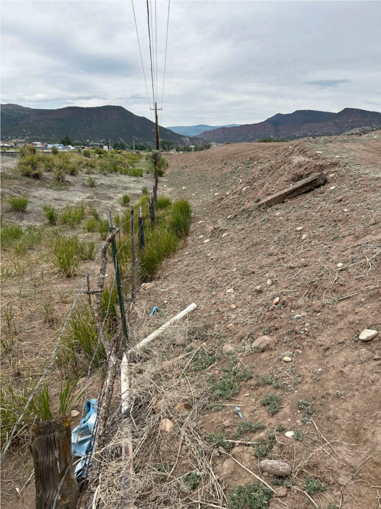
Figure 6: Southeast corner of permit area, looking west (294)