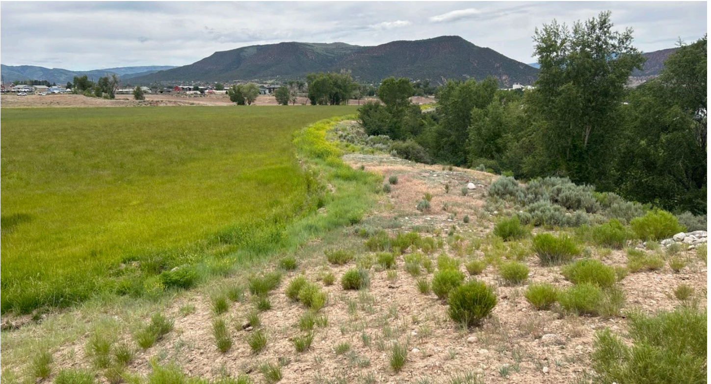
Figure 10: (297)