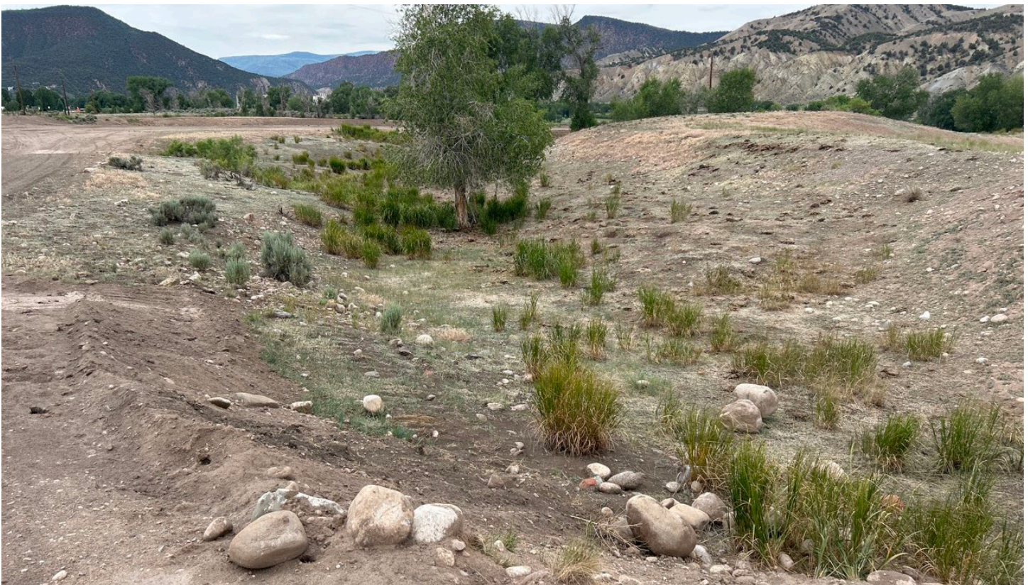
Figure 3: Natural drainage (293)