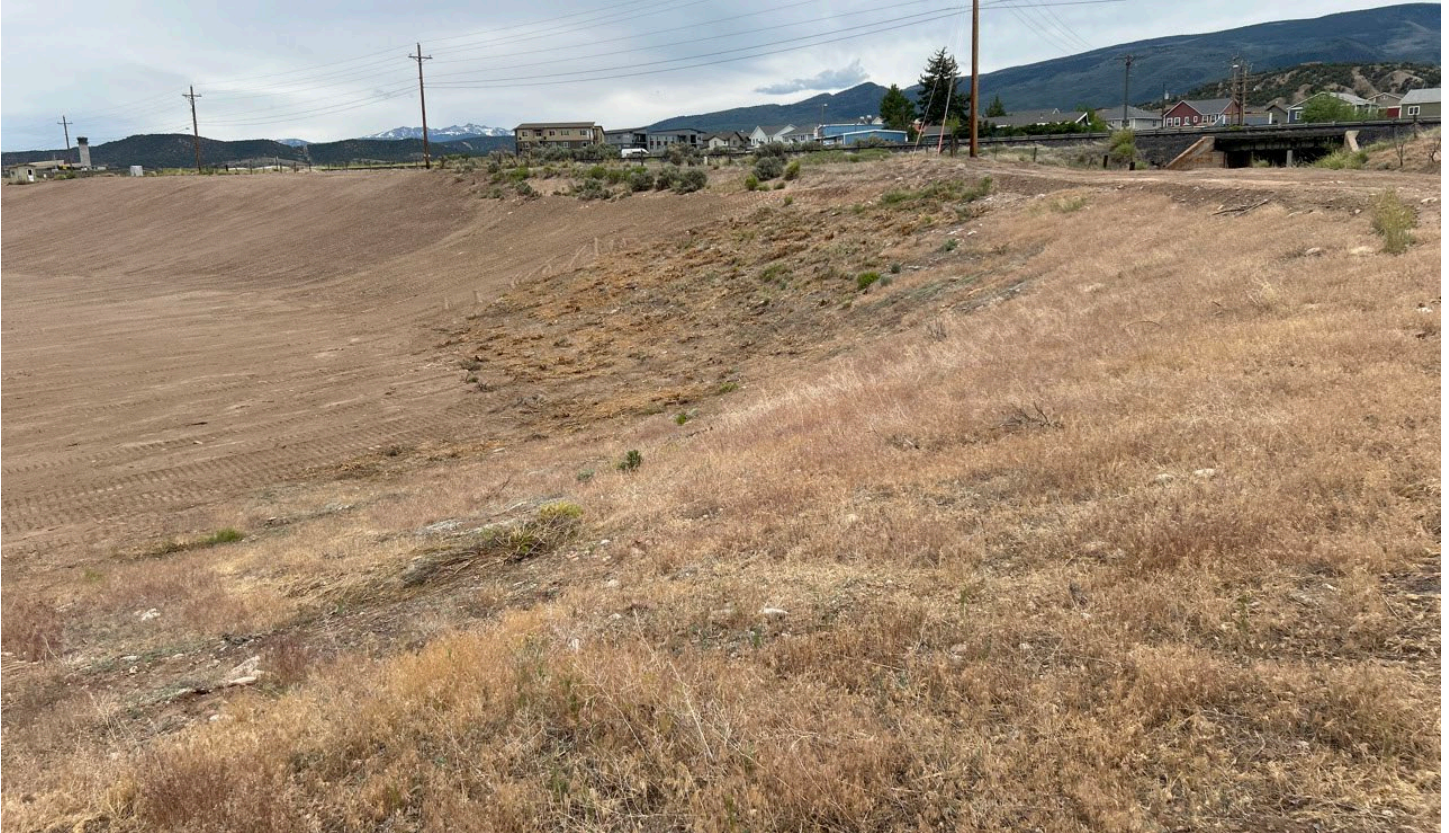
Figure 14: Northwest of permit area (302)