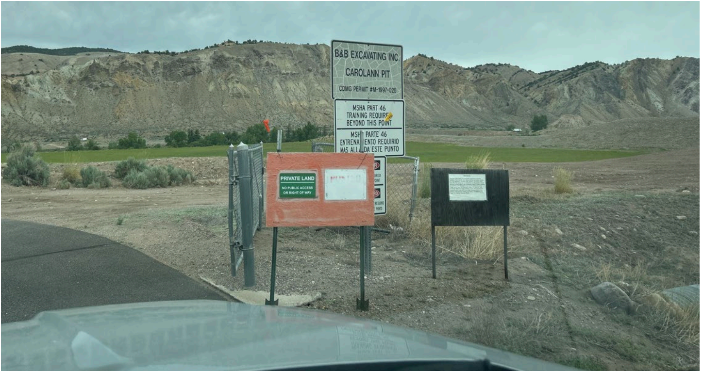
Figure 2: Mine ID Sign (292)