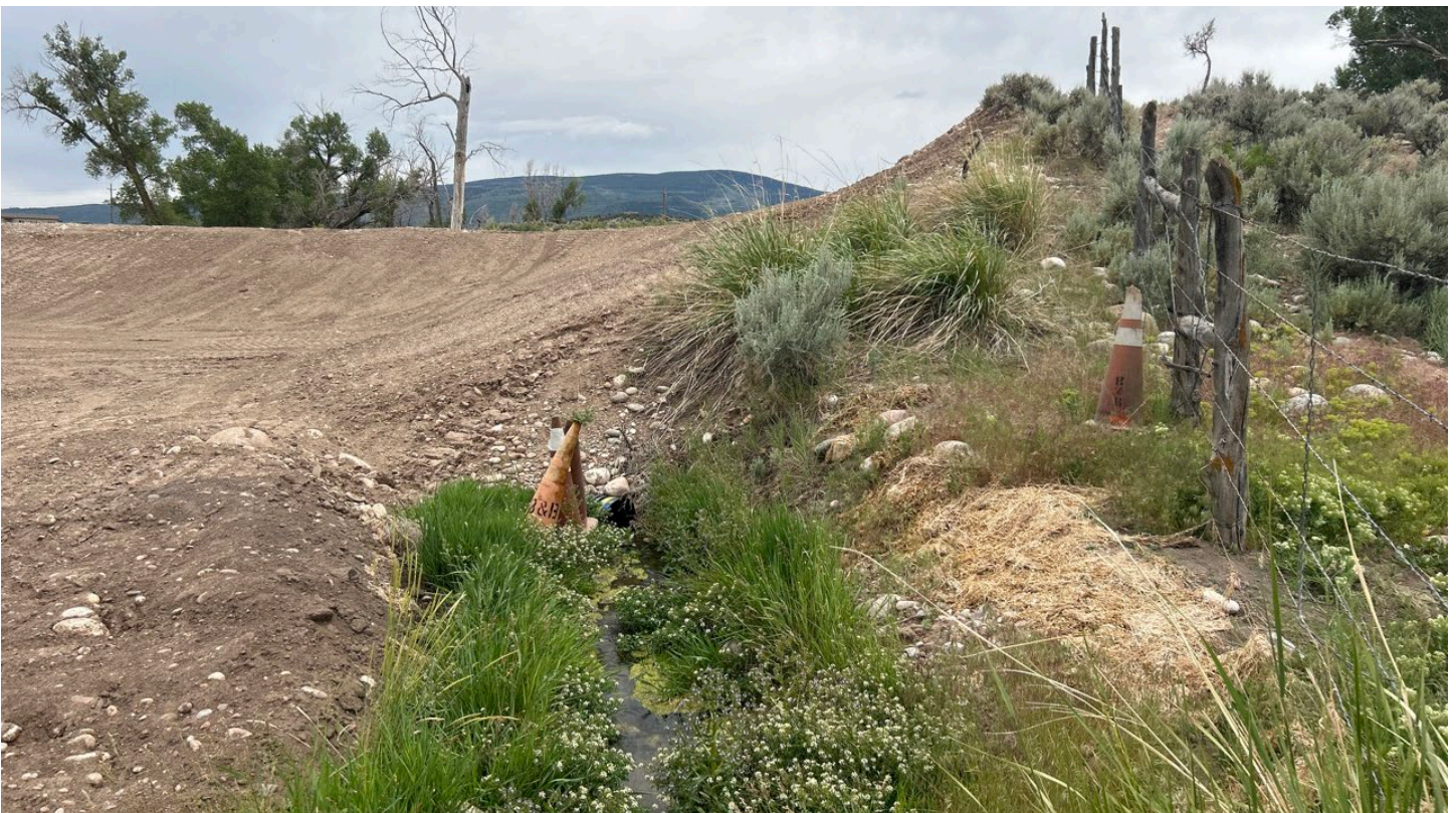
Figure 13: Western permit boundary (300)