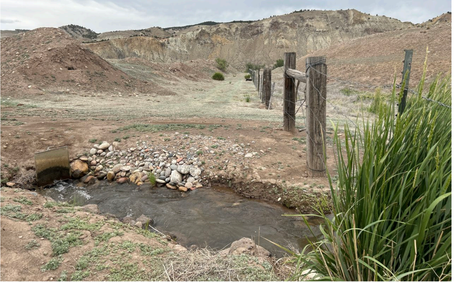
Figure 7: Southeast corner of permit area, looking south (294)