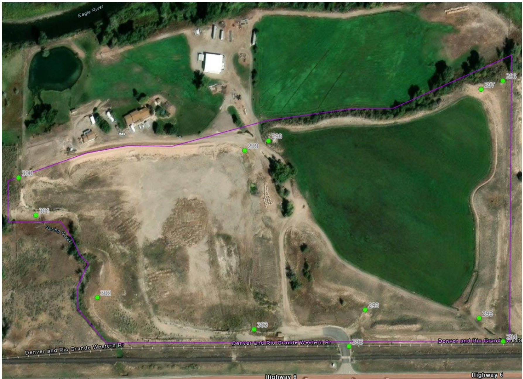
Figure 1: Screenshot of Inspection Map showing permit boundary in purple and inspection features in green