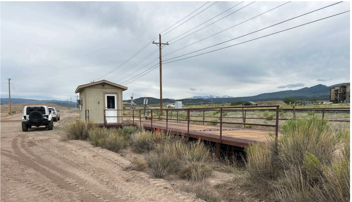
Figure 15: Truck scale (303)