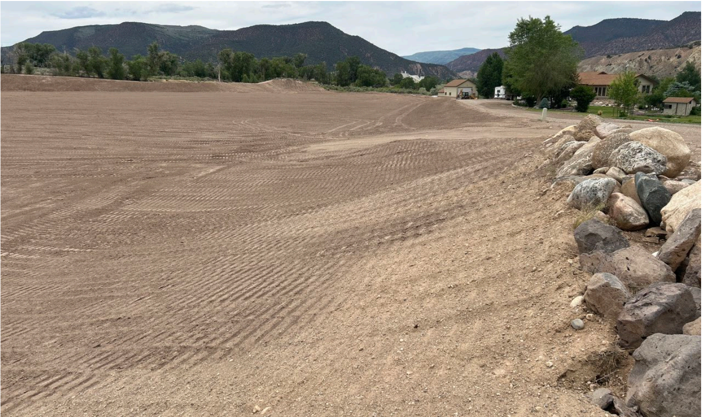
Figure 12: Northern edge of western pit (299)