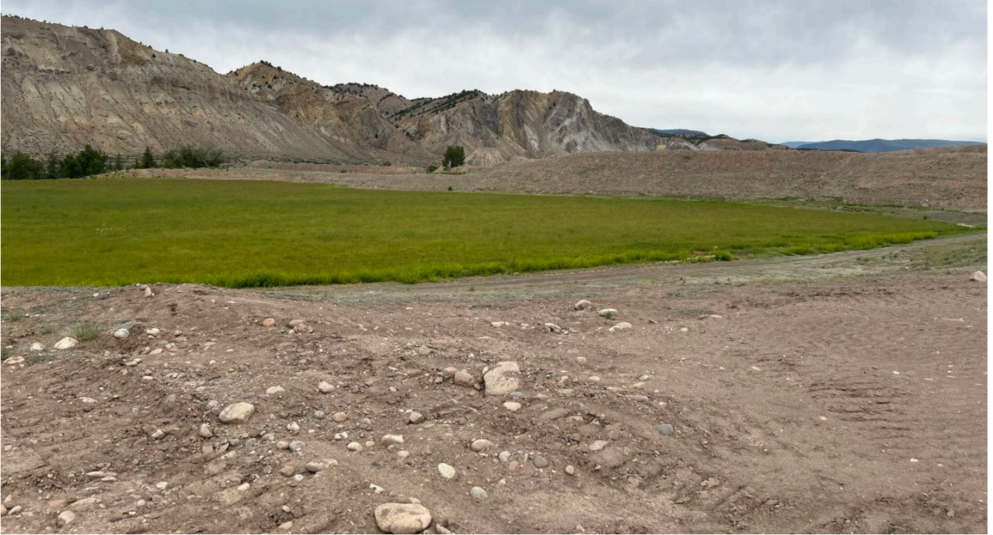
Figure 4: Pasture on eastern part of site (293)