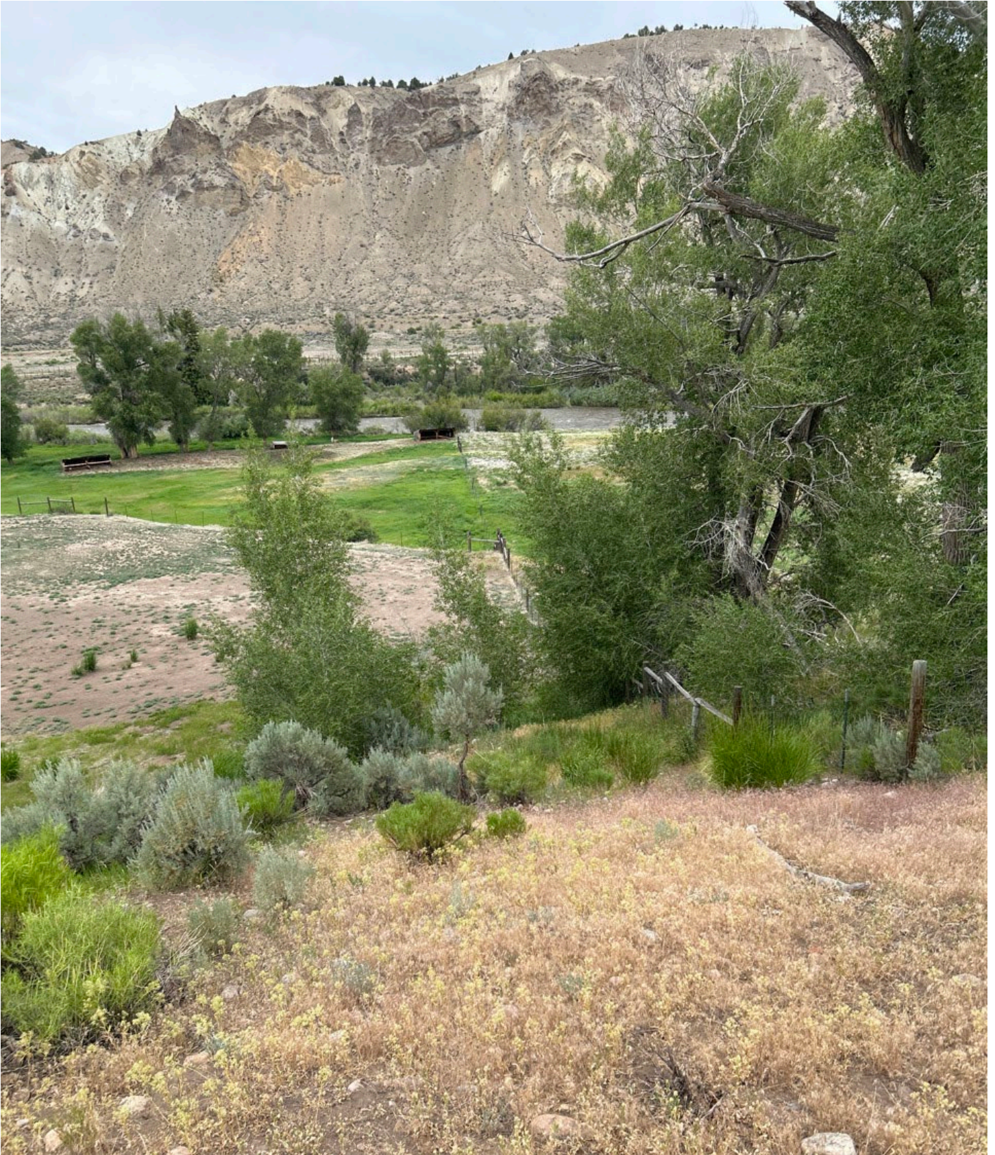
Figure 9: Northeast corner of permit area, looking north towards Eagle River (296)