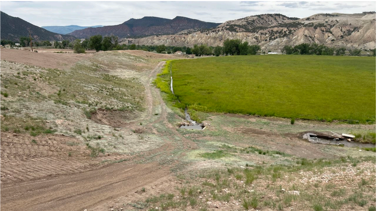
Figure 8: Irrigated pasture (295)