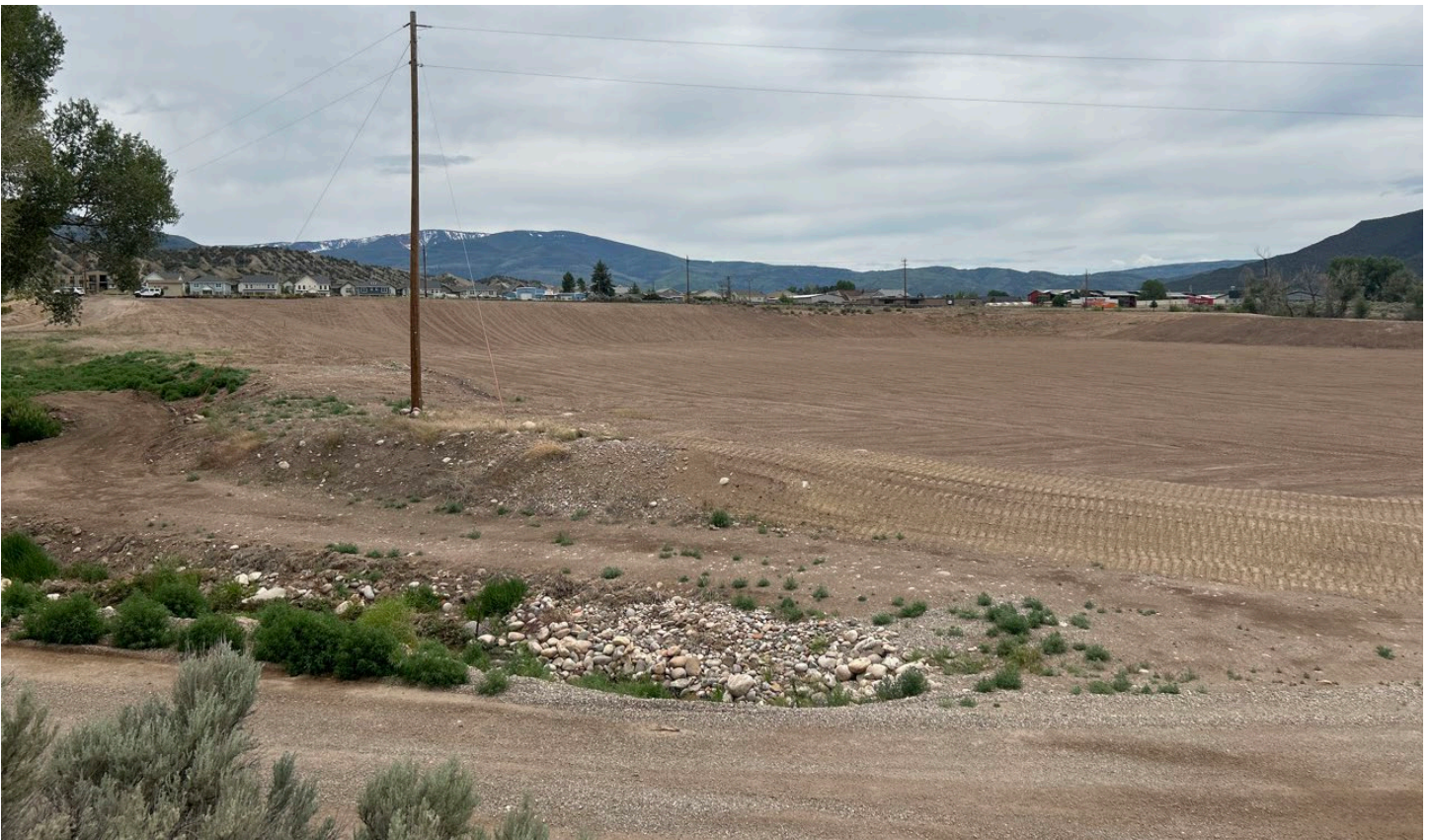
Figure 11: Western pit (298)