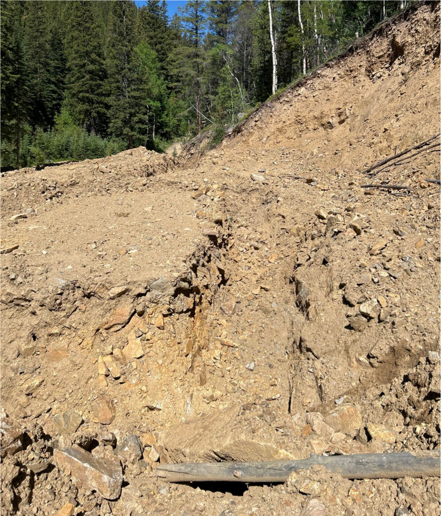
Figure 5: Foundation Trench?