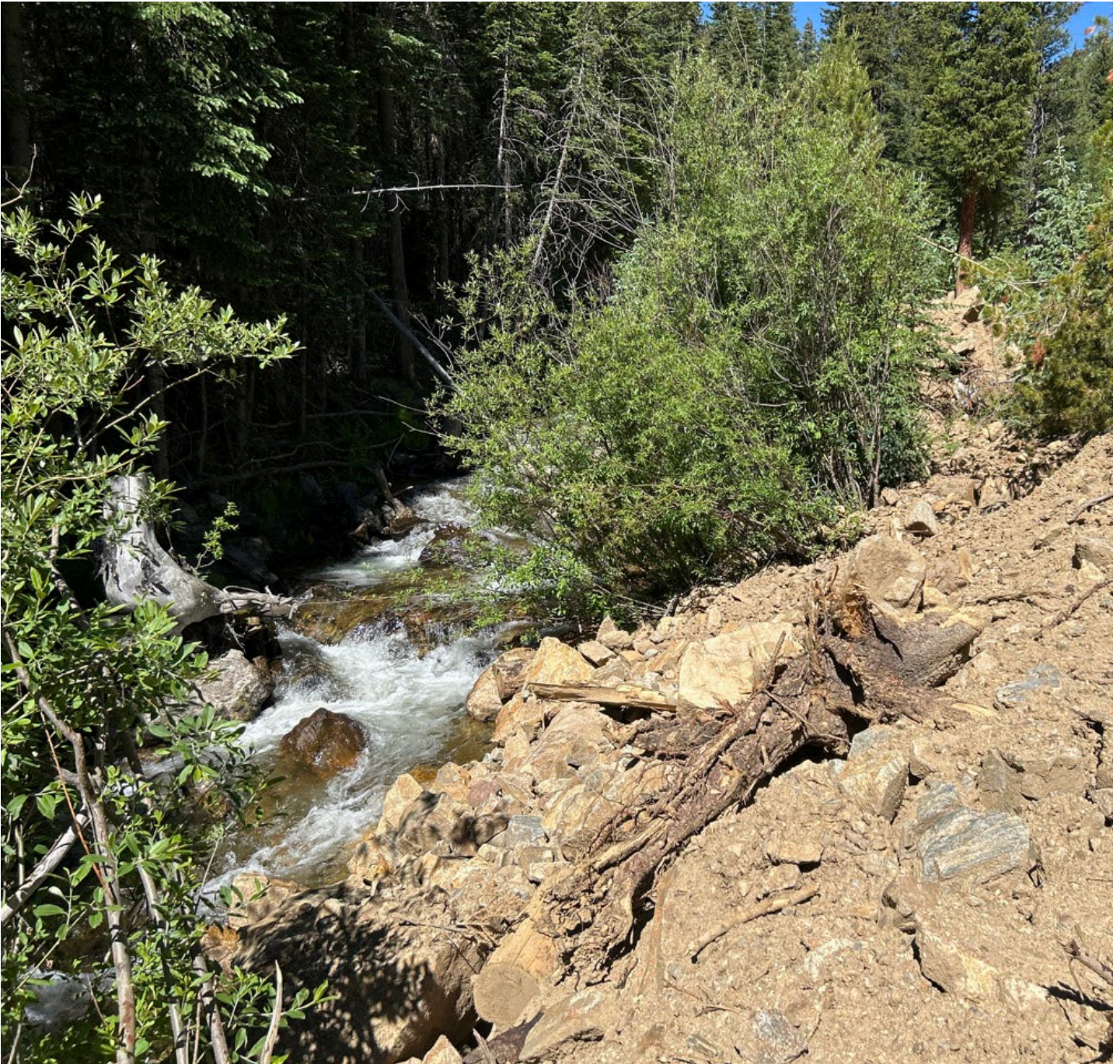
Figure 11: Creek Impact 2