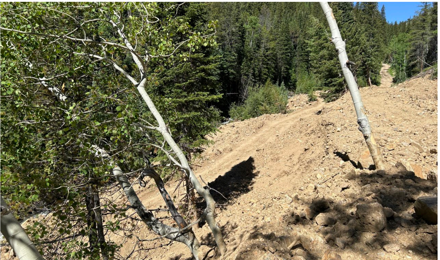
Figure 7: Eastern Extent of Pad