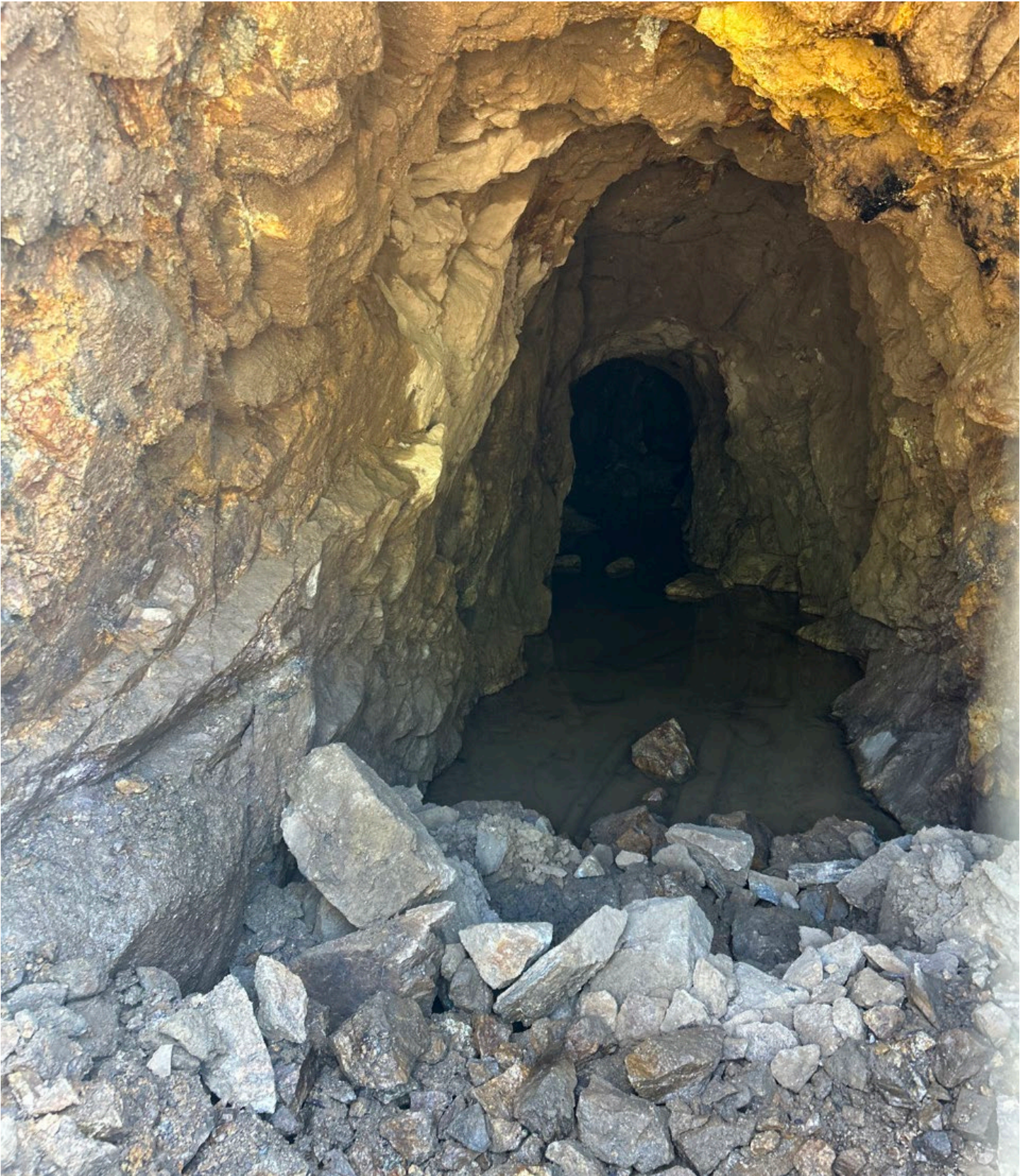
Figure 8: Adit