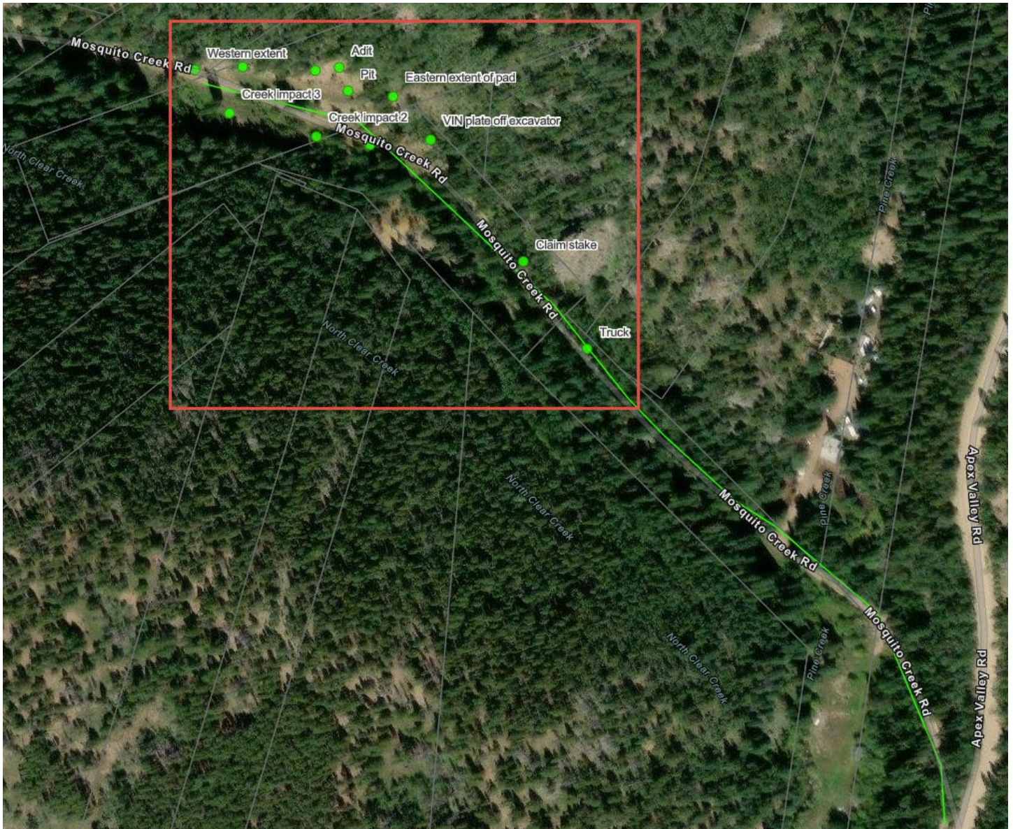
Figure 1: Screenshot of inspection map. Collected features in green, Gilpin County tax parcels in gray. Red rectangle shows approximate area of Figure 2.