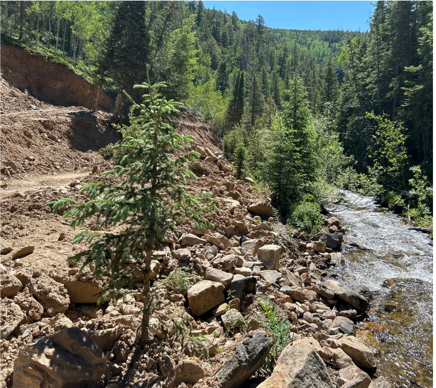
Figure 12: Creek Impact 3