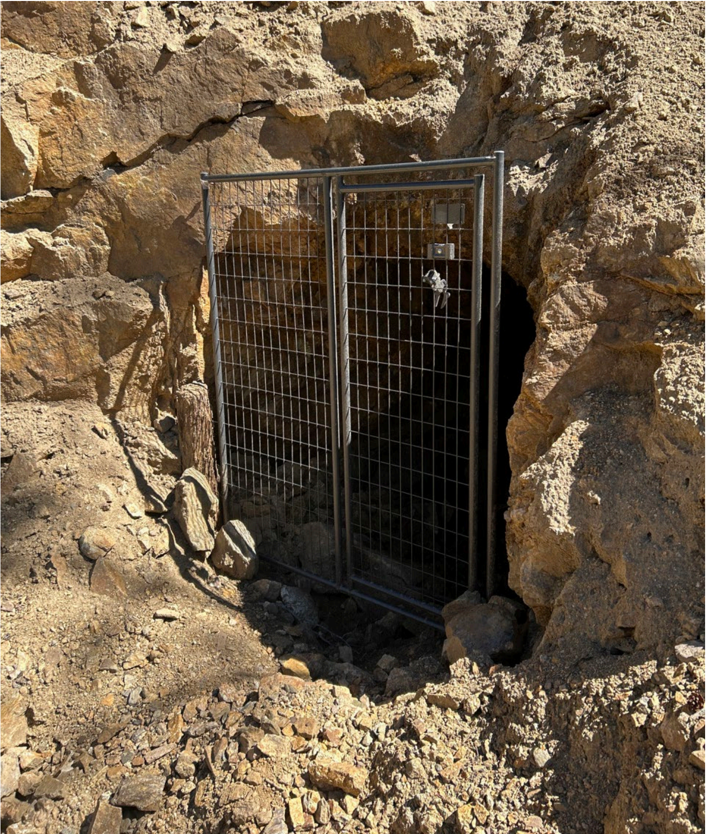
Figure 9: Adit, showing grate loosely in place