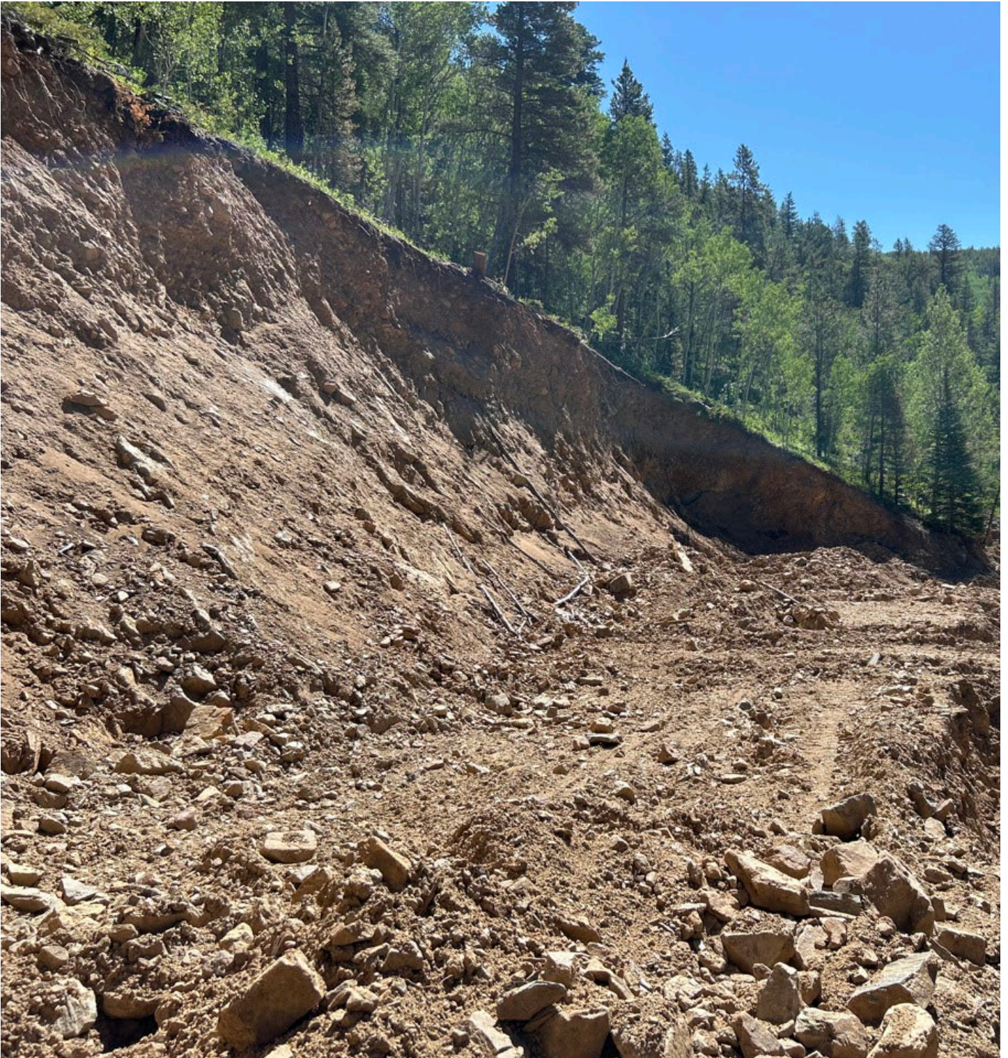
Figure 4: View east from West End of Highwall