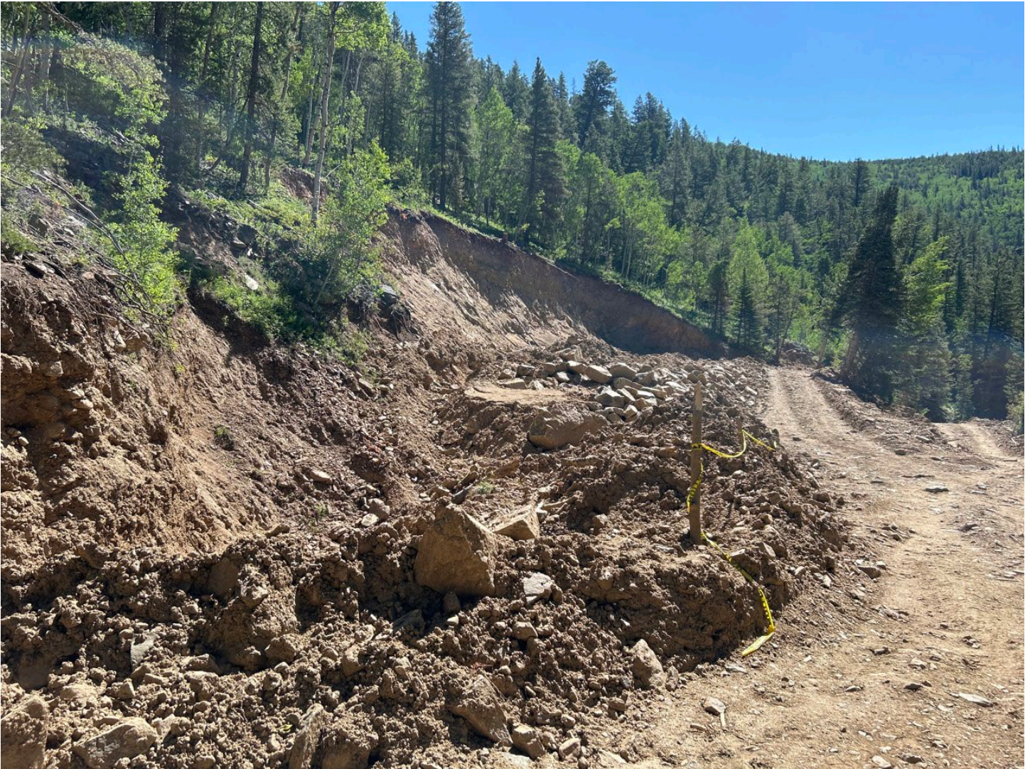
Figure 3: View east from Western Extent of Disturbance