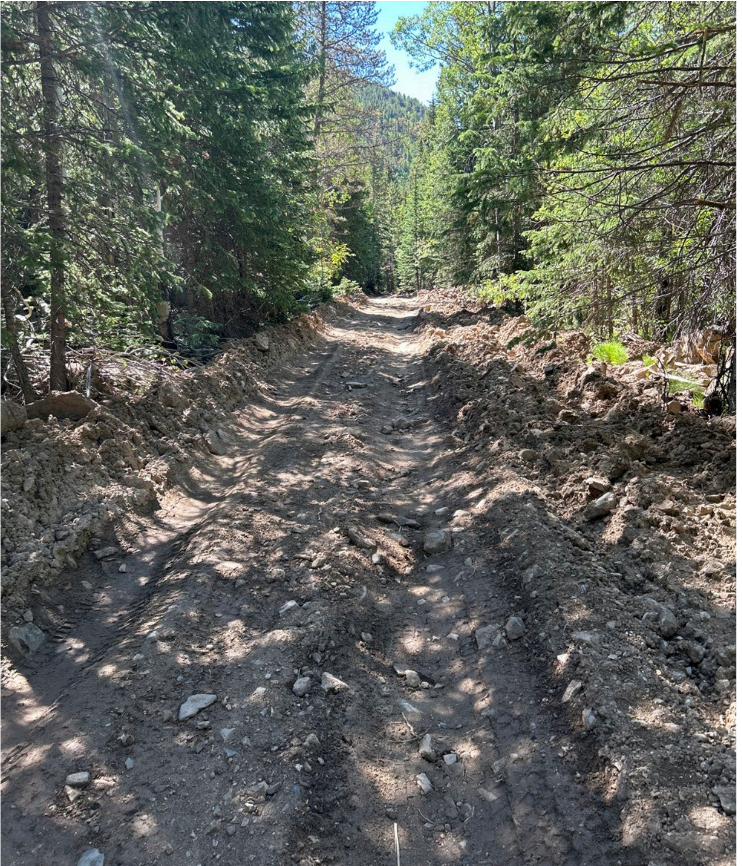
Figure 13: Road