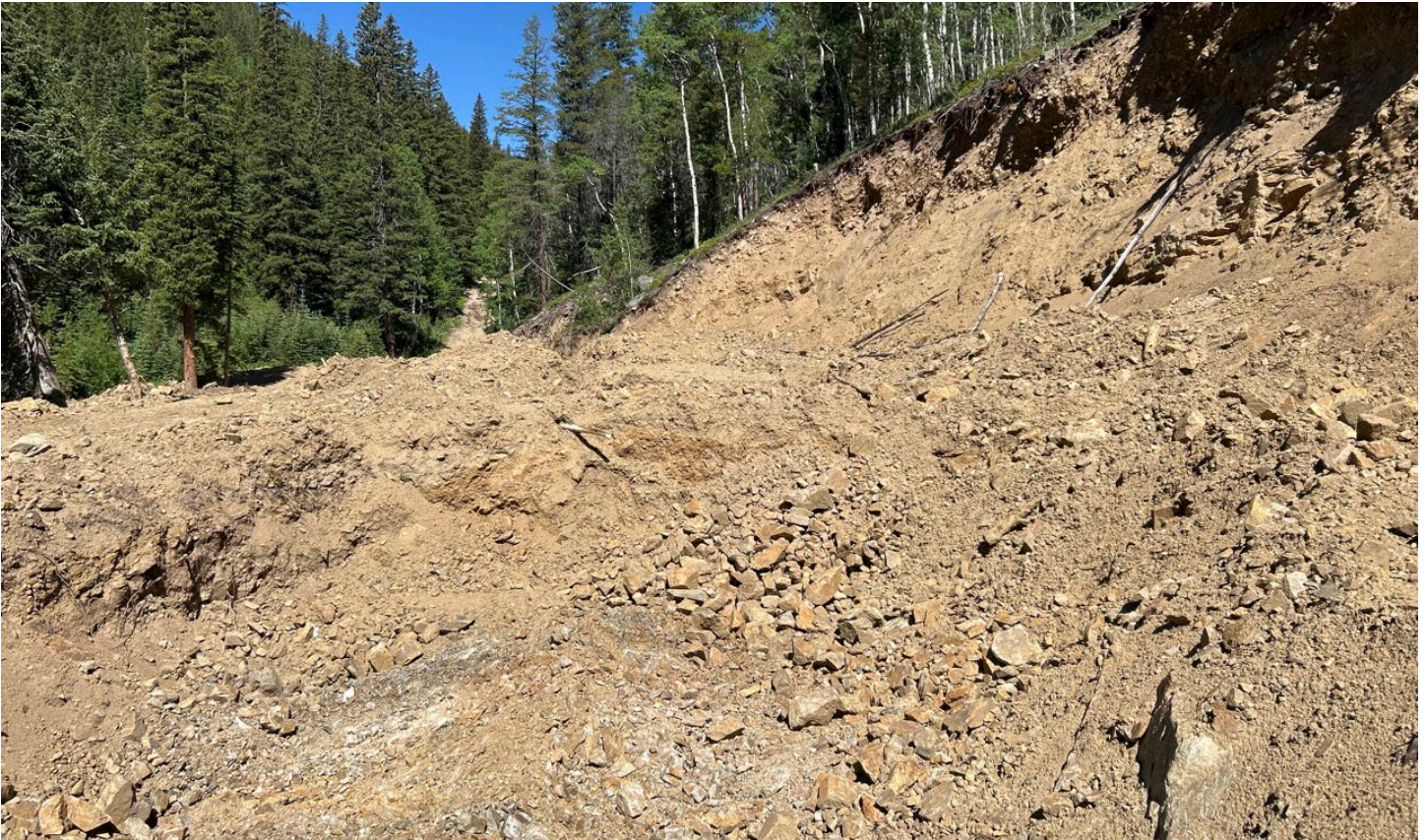
Figure 6: Pit