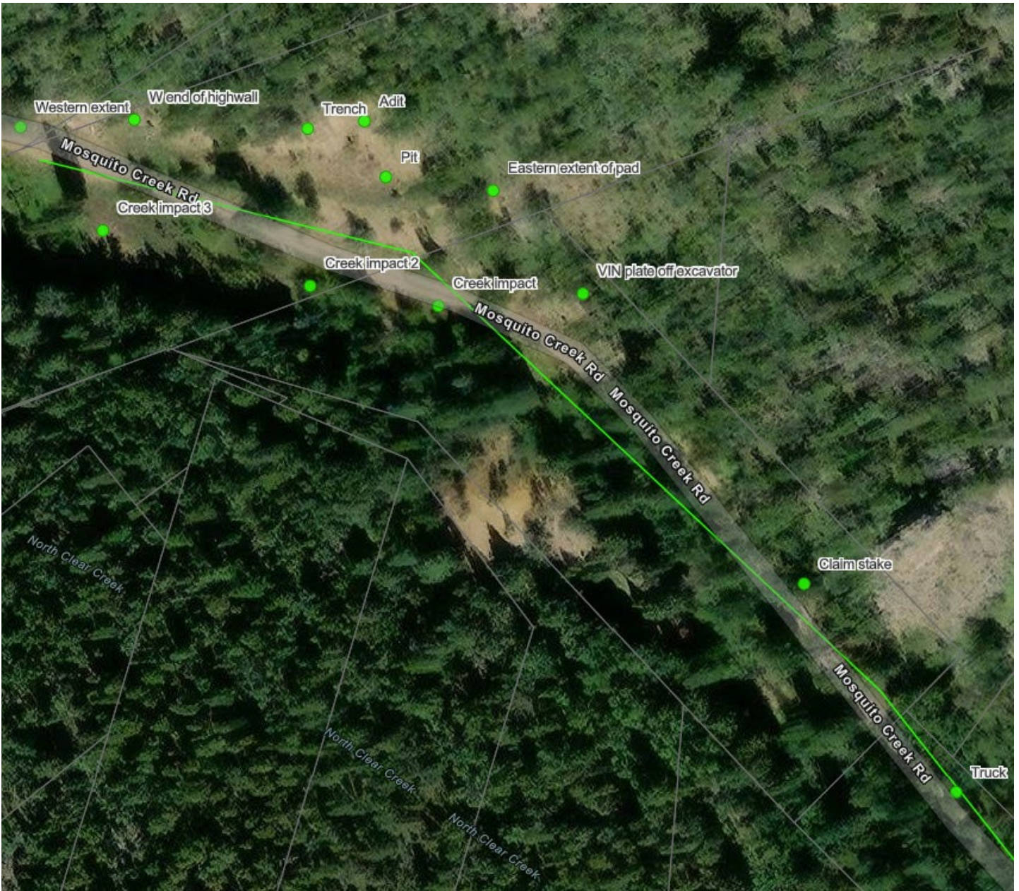
Figure 2: Screenshot of inspection map, zoomed in to disturbed area