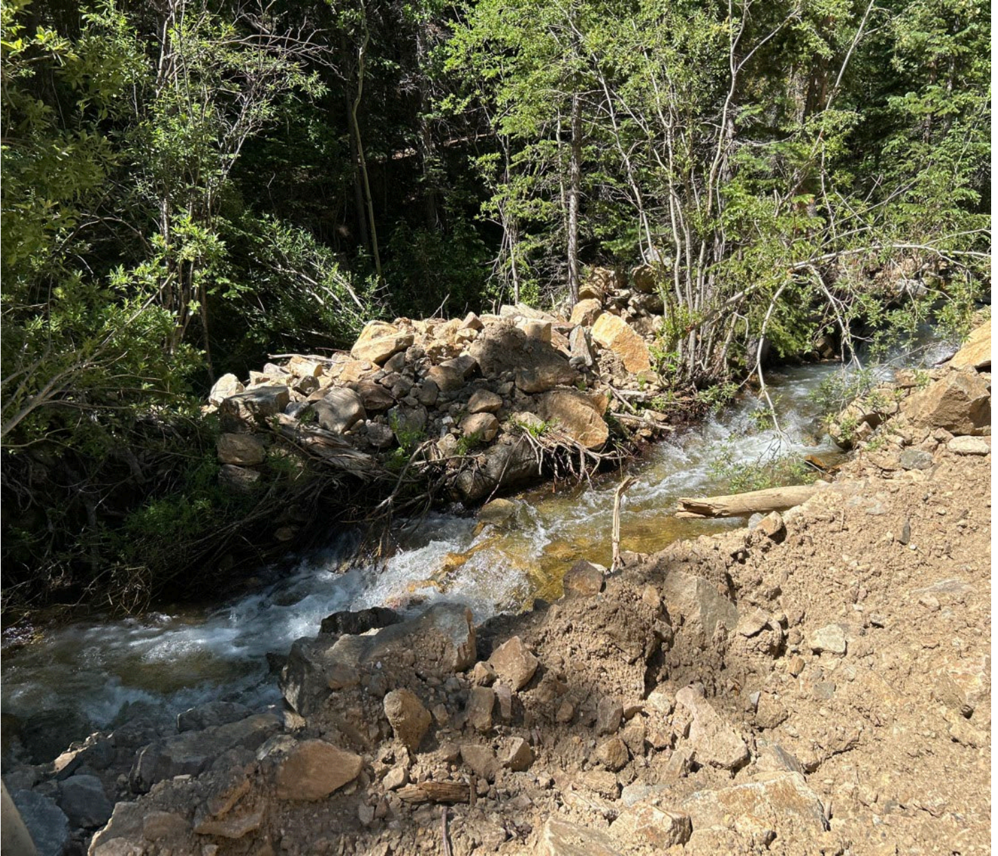
Figure 10: Creek Impact