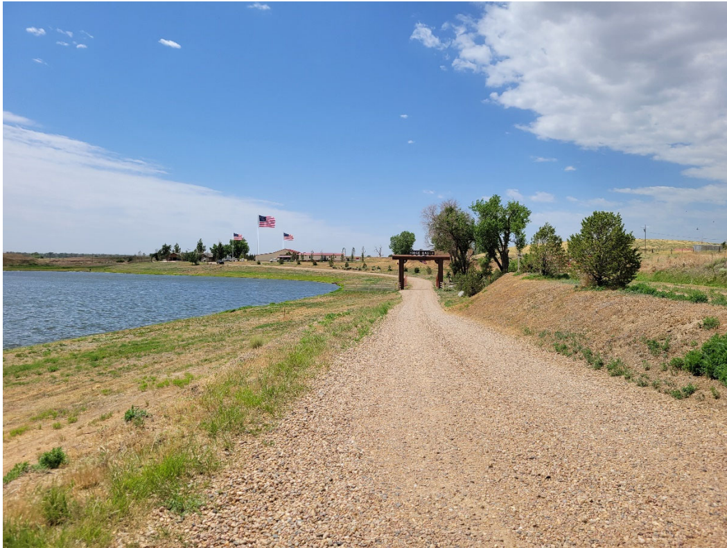
Photo 1: Looking south down the driveway from the entrance at the northwest corner of the parcel.