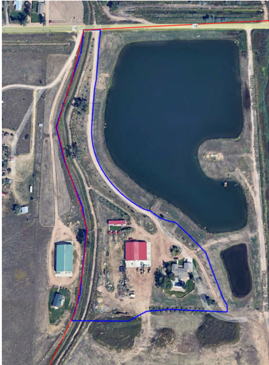
Figure 1: Blue line indicates 8.8 acre parcel owned by Freddy and Lisa Dodge. Red line is the permit boundary on the west side of the northern permit area. Google imagery dated 9/4/2023.