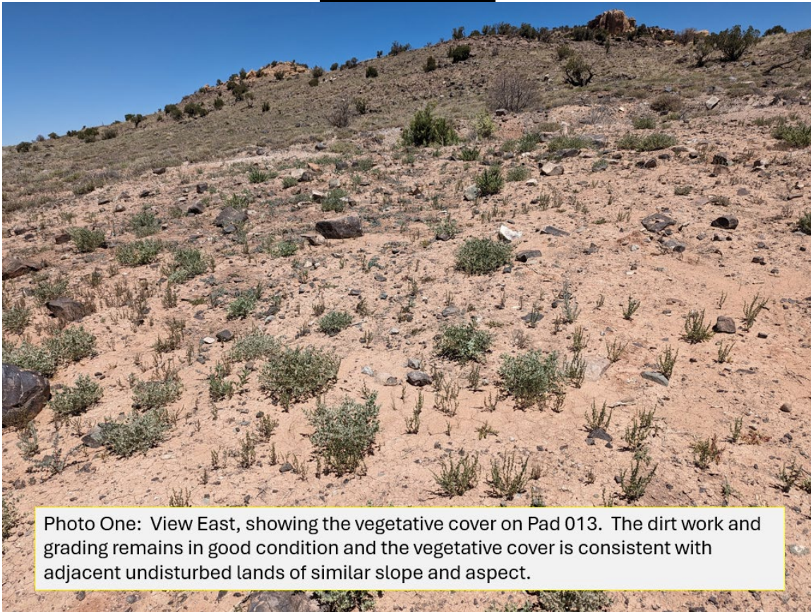
Photo One: View East, showing the vegetative cover on Pad 013. The dirt work and grading remains in good condition and the vegetative cover is consistent with adjacent undisturbed lands of similar slope and aspect.