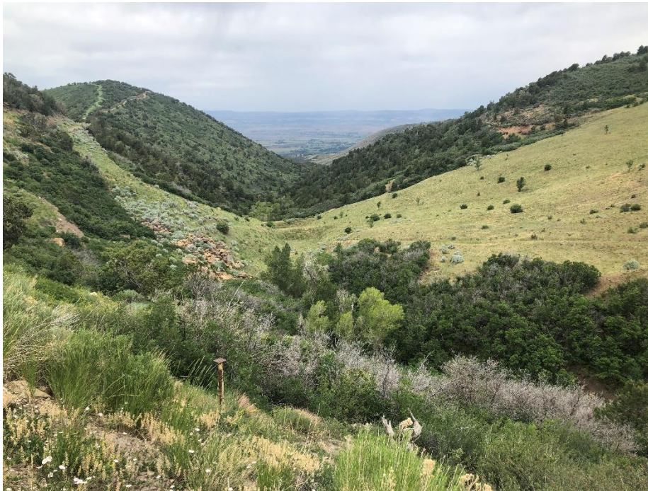
West Mine ponds

Number of Partial Inspection this Fiscal Year: 8