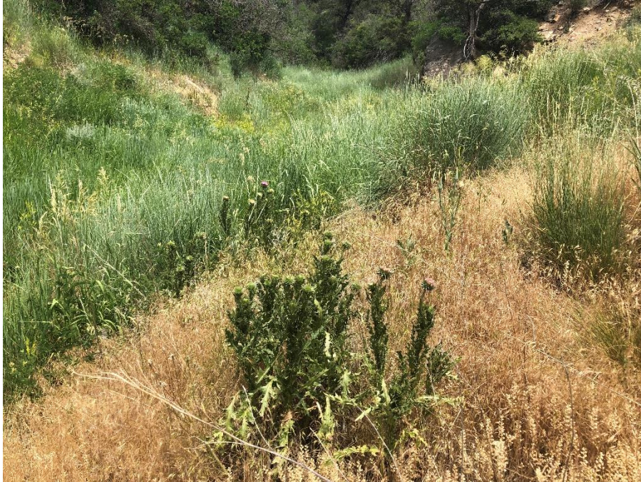
Thistle plants at reclaimed Pond 3