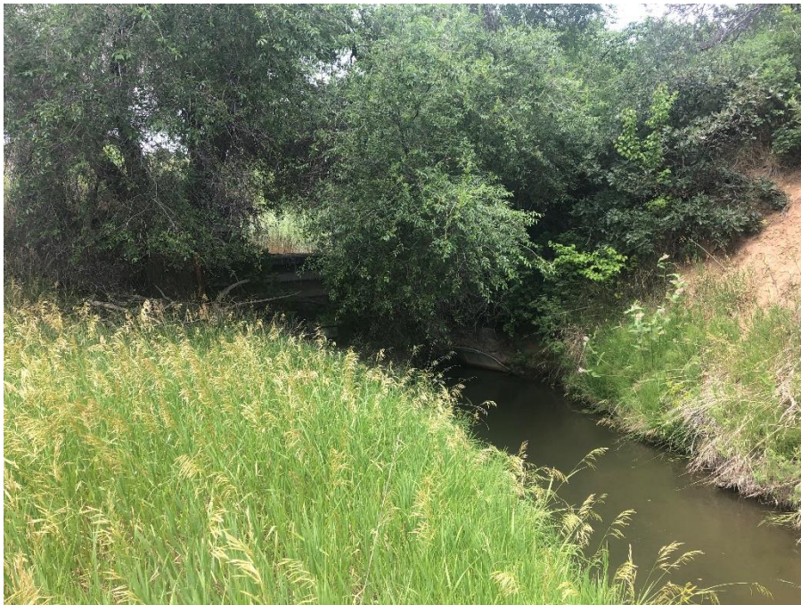
Culvert at the loadout (upstream end)

Number of Partial Inspection this Fiscal Year: 8