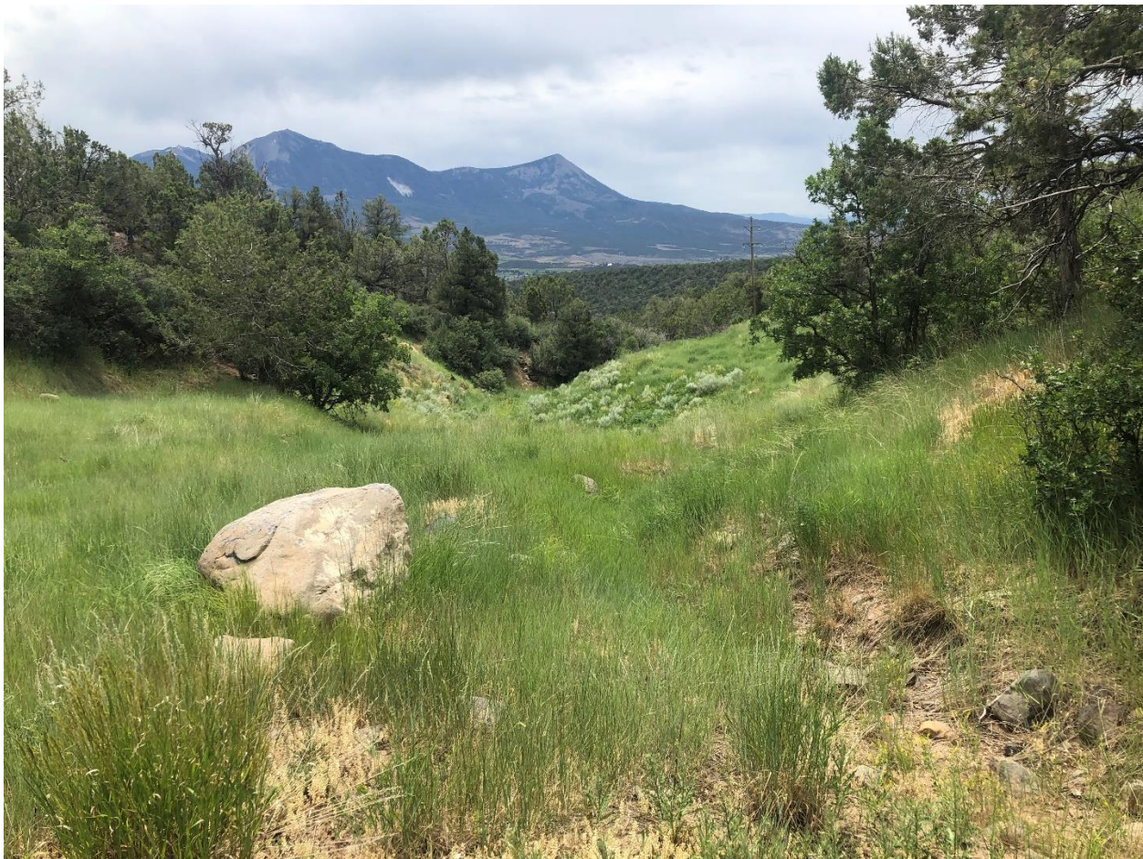
Reclaimed Pond 4 below the East Mine

Number of Partial Inspection this Fiscal Year: 8