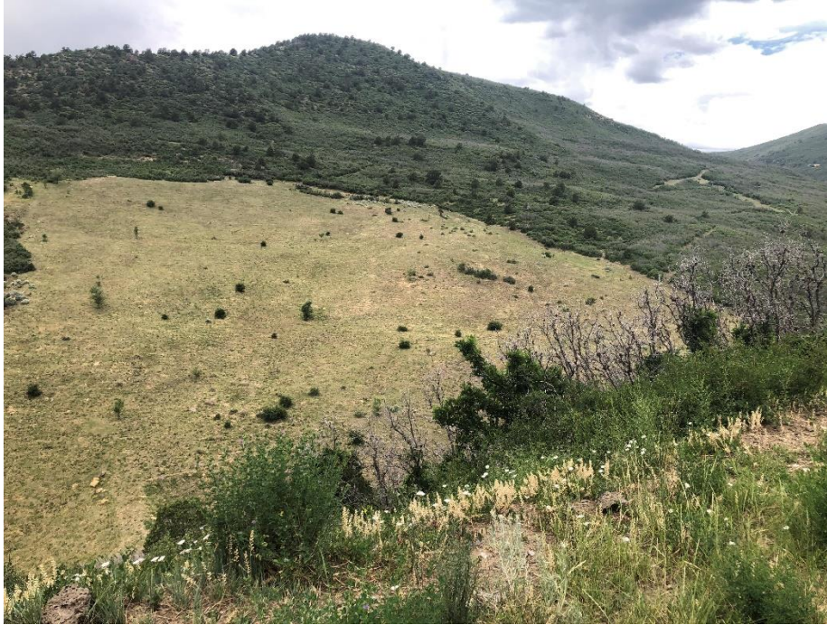
West Mine – reclaimed road in middle of photo