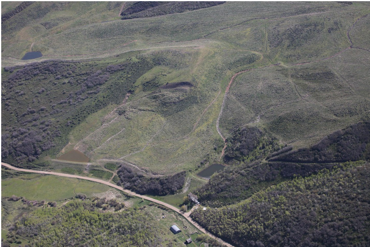
Photo 1: Ponds 13 (left ) and 14 (right) with old slump above Pond 13.

No enforcement actions were initiated as a result of this inspection, nor are any pending.