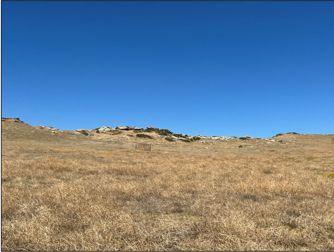
Figure 1: Several holes have been permanently abandoned via conversion to water wells.