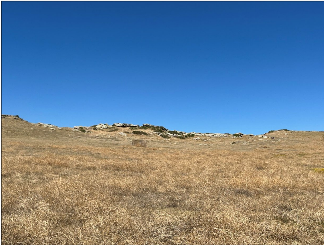
Figure 1: Several holes have been permanently abandoned via conversion to water wells.