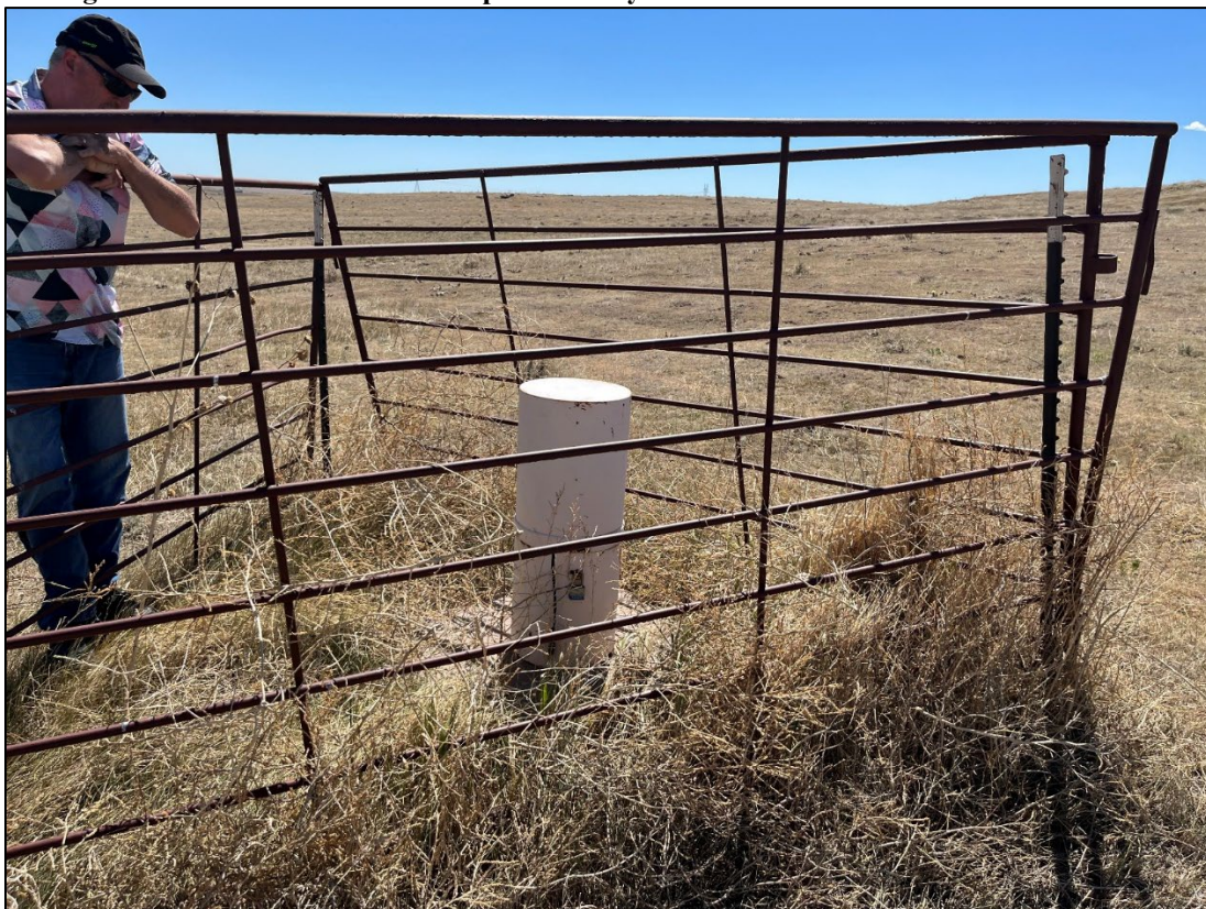
Figure 2: Wells are protected by cattle guards.