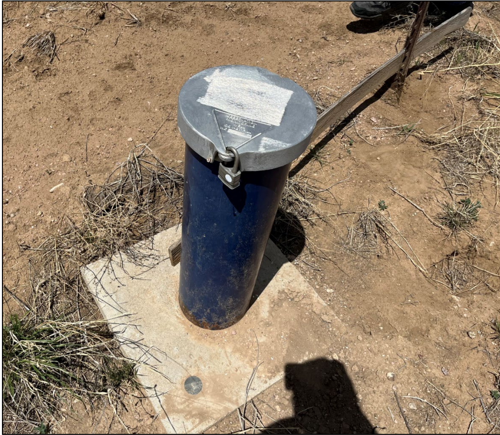
Figure 3: Wells are secured with locks and labeled with small, metal plates.

Peter Luthiger, Lisa Scheinost Powertech (USA) Inc. 101 N. Shoreline Blvd. Corpus Christi, TX 78401