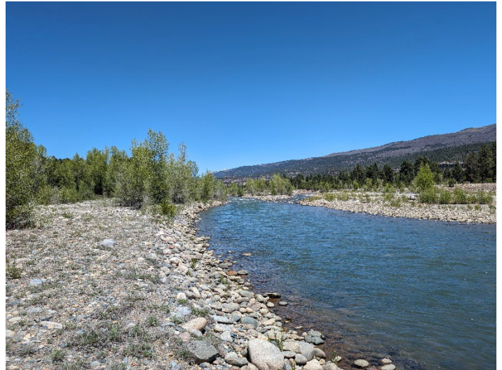
Animas riverbank adjacent to north pond