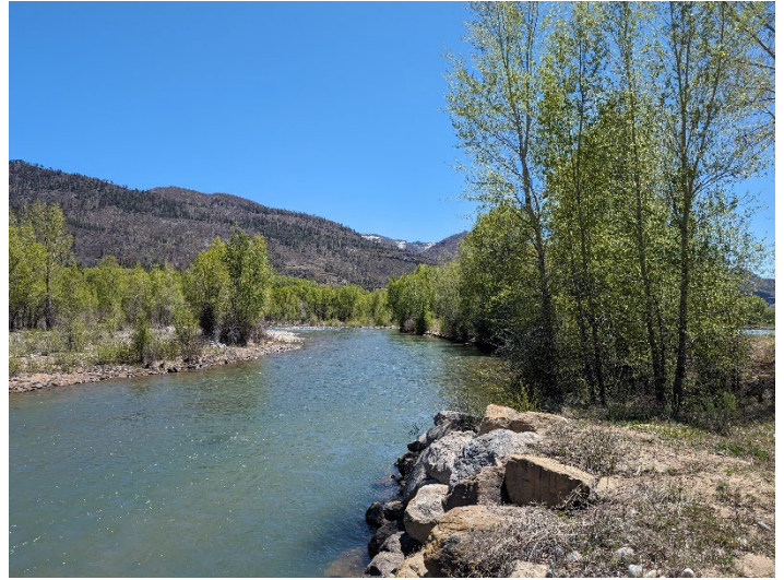
Jetty and armored bank