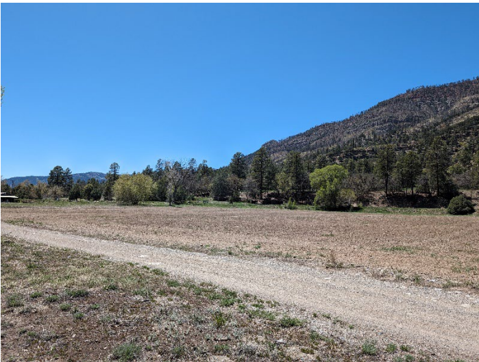
Irrigated cropland area