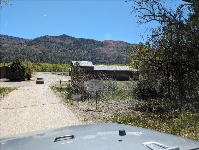
Mine sign posted at site entrance