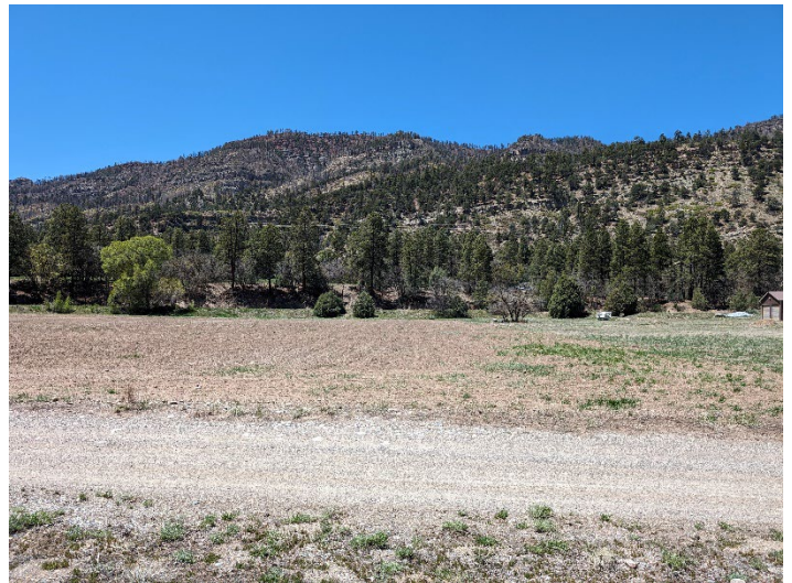
Irrigated cropland area