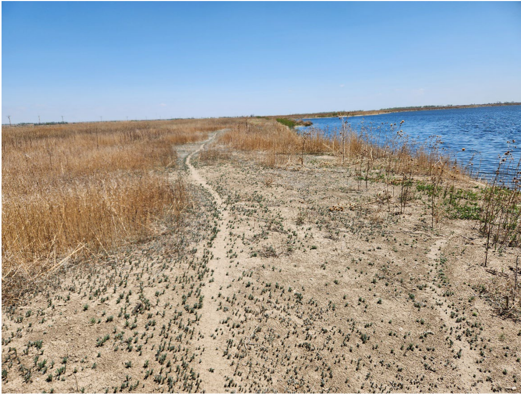
Photo 11. Bare patch along the northernmost shoreline, facing east.