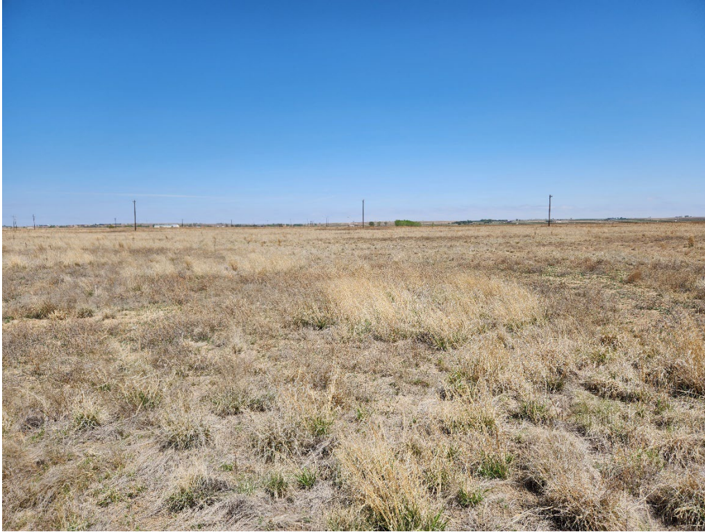
Photo 9. Revegetation in the middle of the site that appears dense and diverse with grasses, facing west.