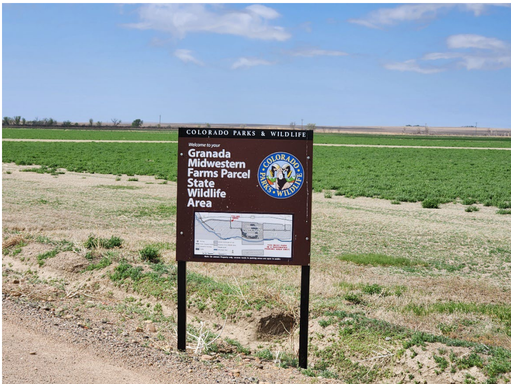
Photo 2. CPW Wildlife Area sign, facing south.