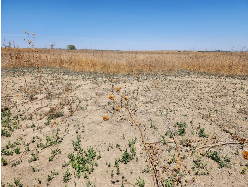
Photo 13. Bare patch in northern portion of the site, facing north.