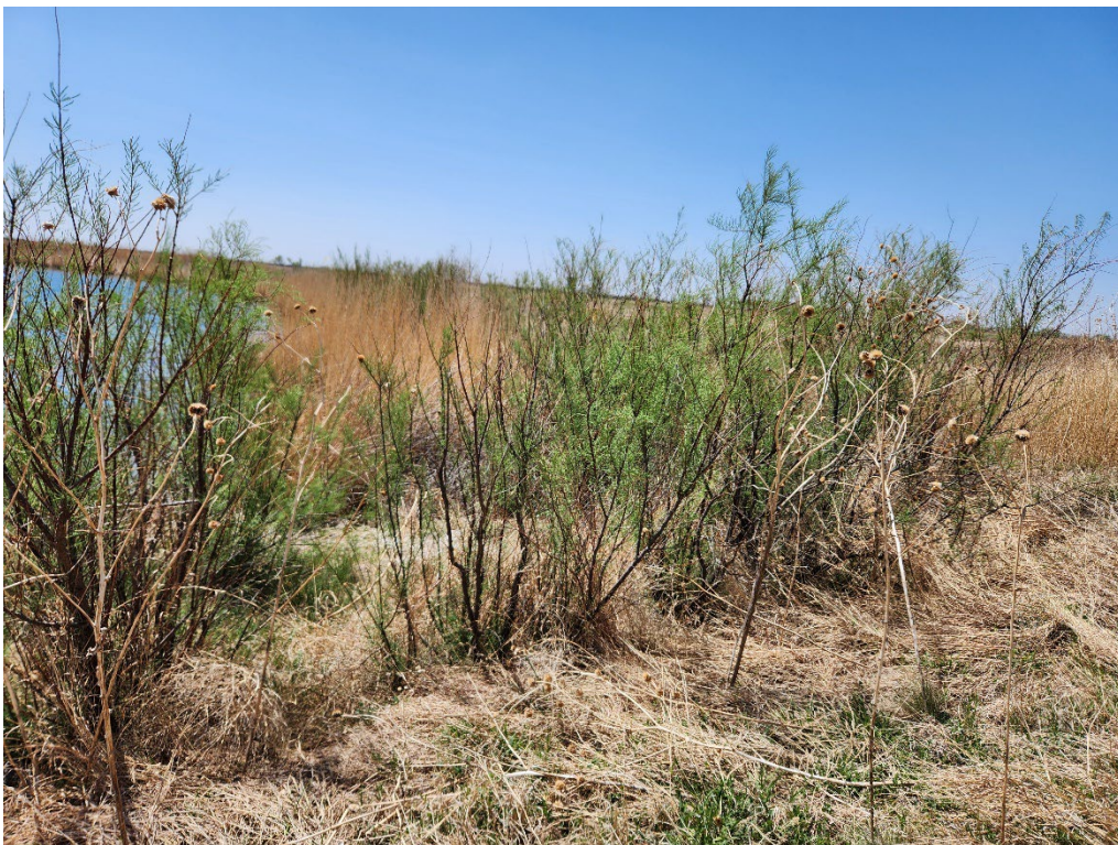
Photo 8. Tamarisk around the shoreline, facing south.