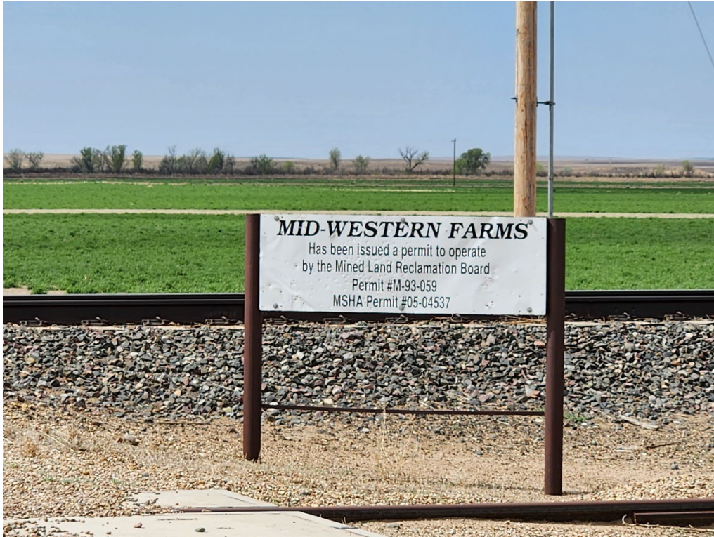
Photo 1. Mine entrance sign, facing south.