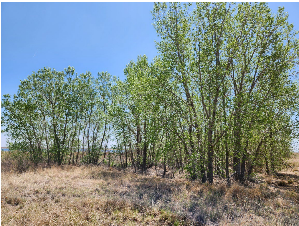
Photo 14. Cottonwoods in the northern part of the site, facing south.