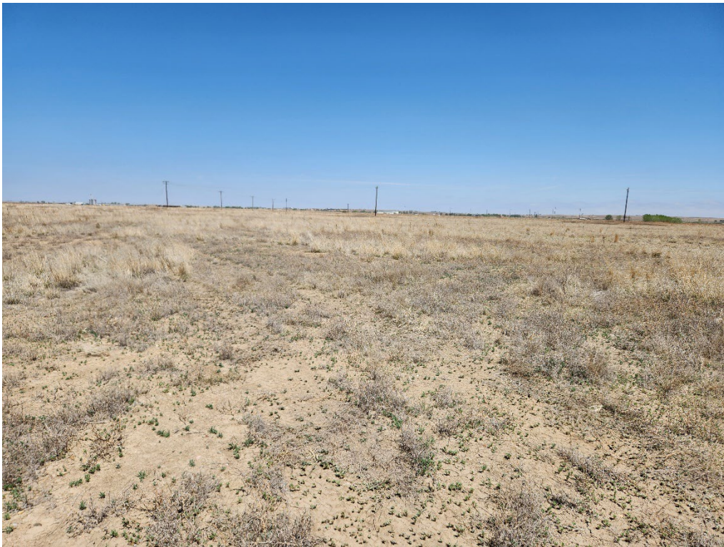
Photo 10. Bare patch with little grass regrowth, facing west.