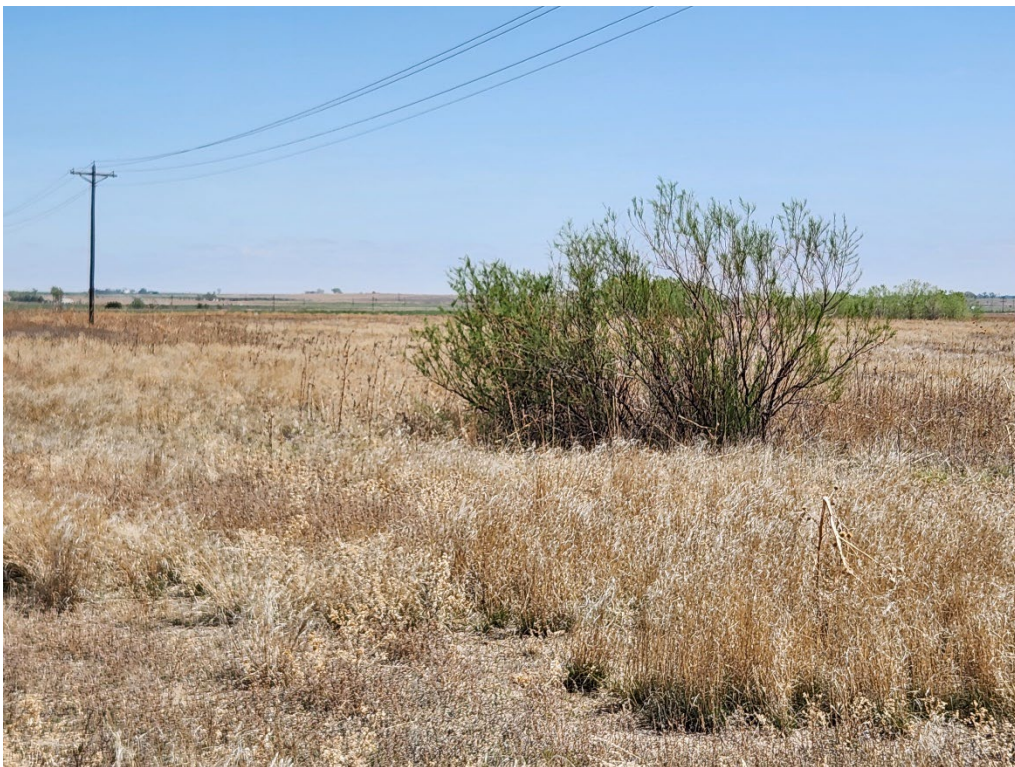
Photo 4. Tamarisk found near the powerlines that run through the middle of the site, facing east.