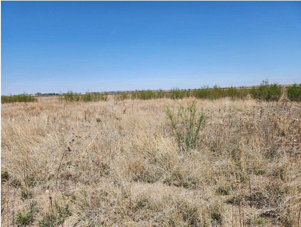
Photo 5. Revegetation north of the site with a large tamarisk outbreak, looking north.