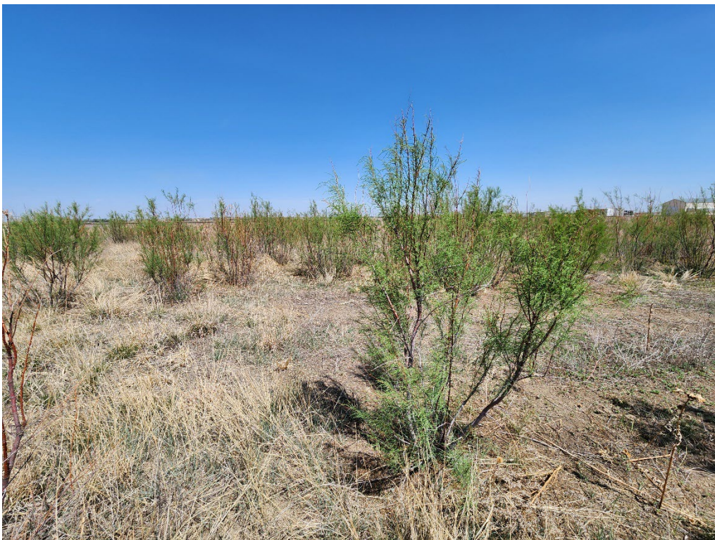
Photo 6. Tamarisk outbreak north of the site, facing north.