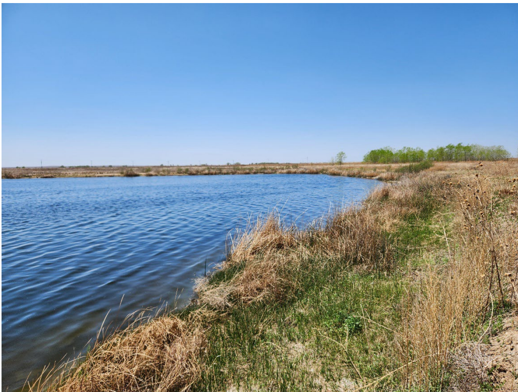
Photo 12. Regrowth along the nethermost shoreline, facing west.