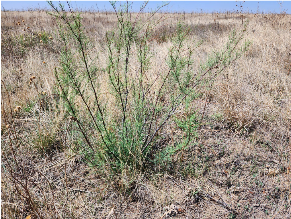
Photo 7. Tamarisk found on site.