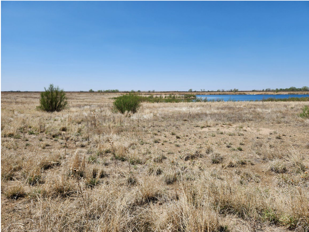
Photo 3. Grass regrowth near the pond. Tamarisk trees are imaged as well. Facing south.