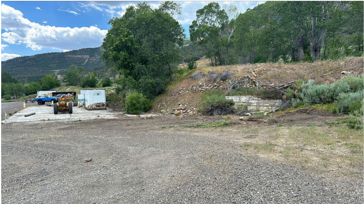
Figure 1: Overview of upper pad