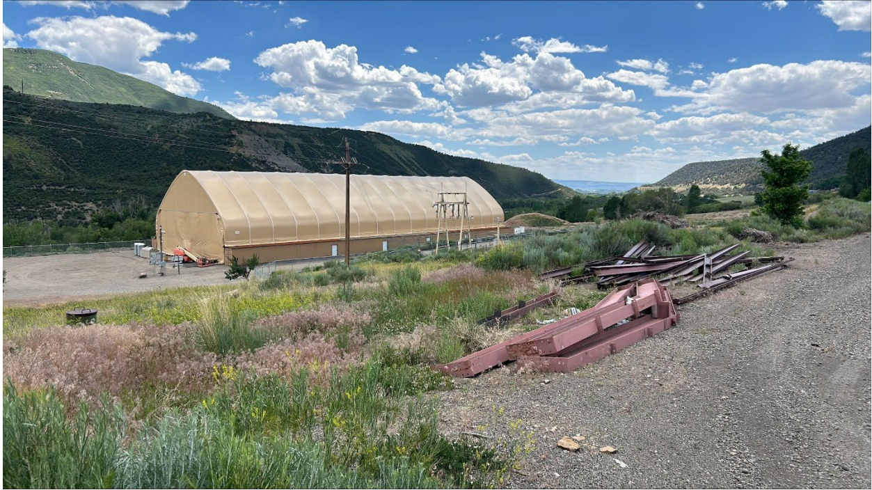
Figure 3: Temporary building on lower pad, with new metal in foreground

Number of Partial Inspection this Fiscal Year: 8