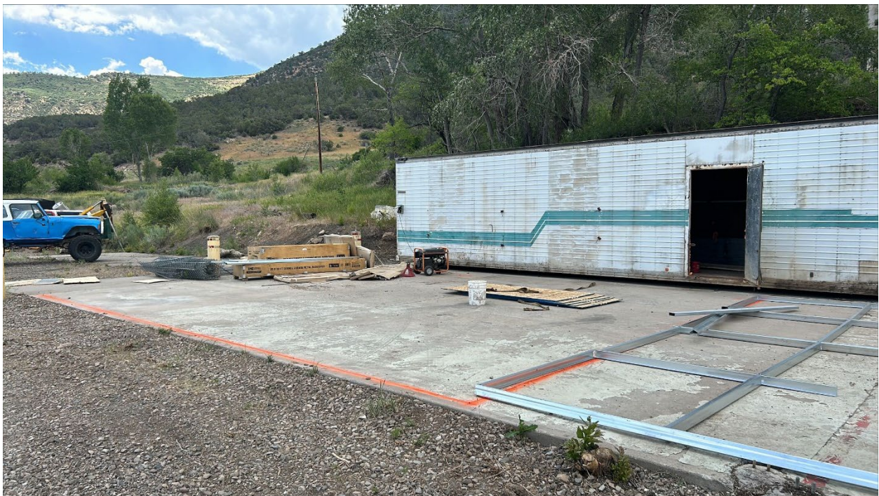
Figure 2: Trailer moved to concrete pad

Number of Partial Inspection this Fiscal Year: 8