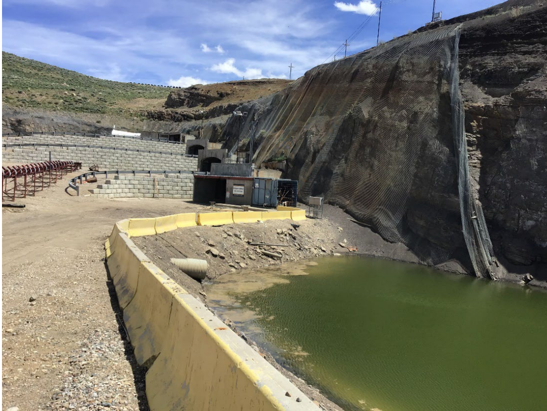
Photo 4: Sealed portals in background and settling pond in foreground.