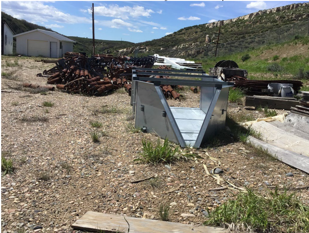
Photo 13: Replacement flume for Pond 2 in foreground of stockpiled materials.

Number of Partial Inspection this Fiscal Year: 0