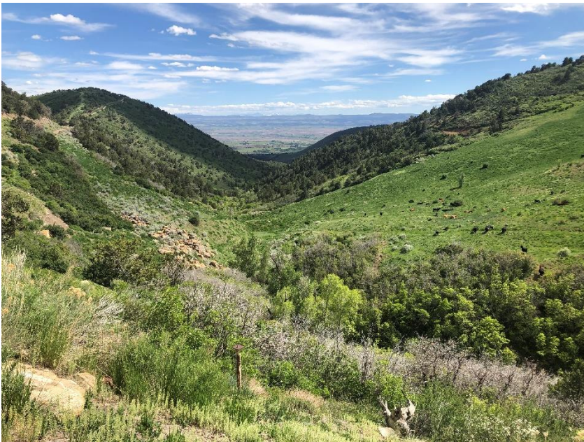
Ponds at West Mine

Number of Partial Inspection this Fiscal Year: 7