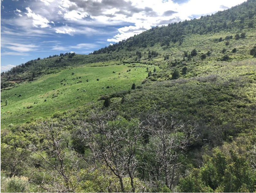
West Mine reclaimed road