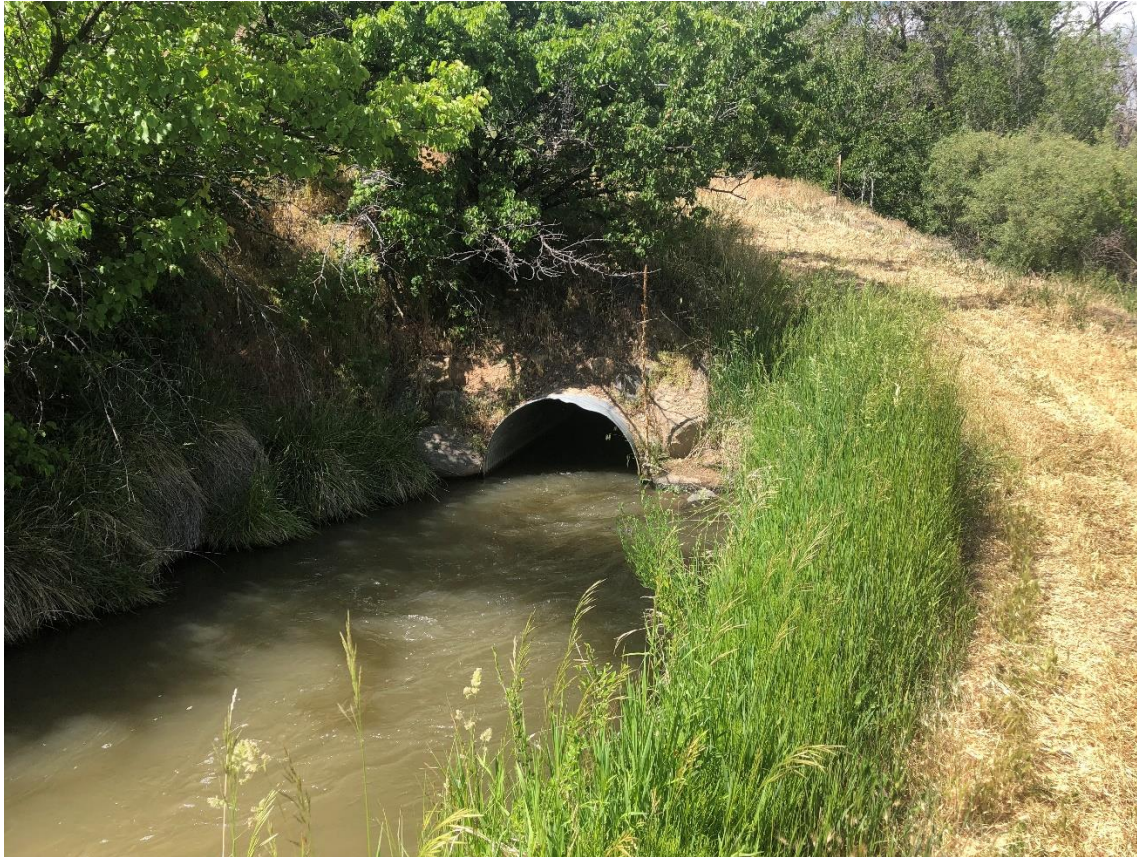
Water in Farmers Ditch at outlet of long culvert at loadout

Number of Partial Inspection this Fiscal Year: 7