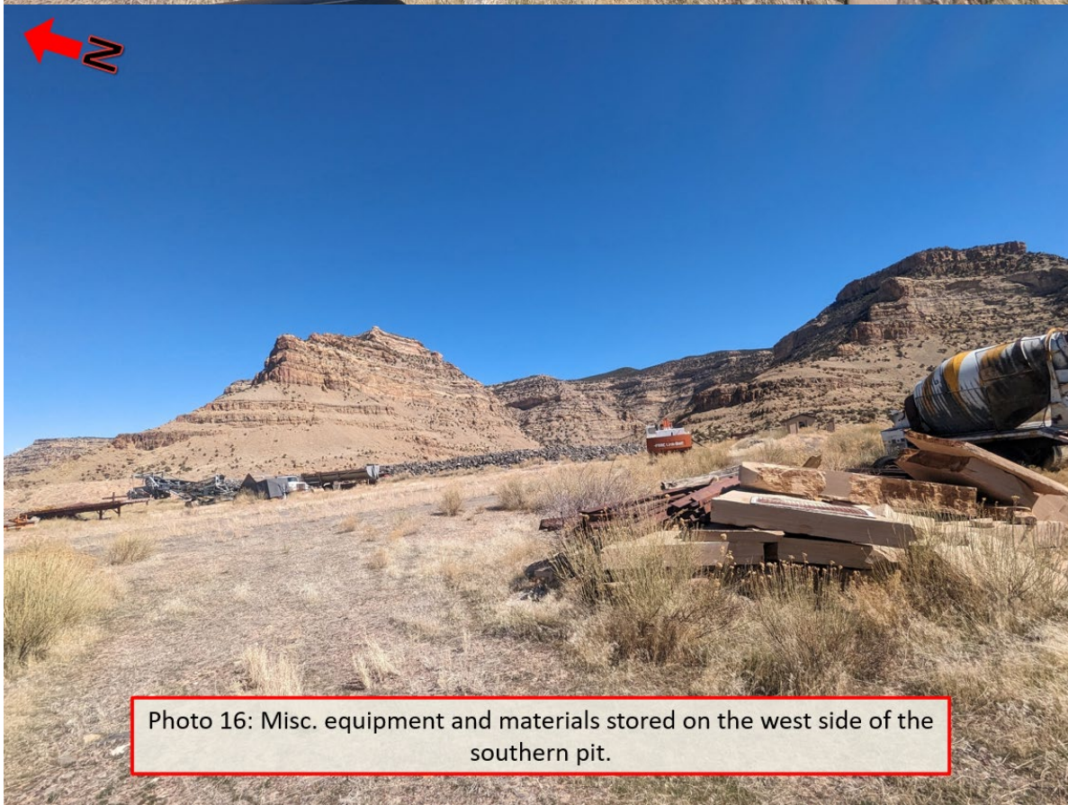
Photo 16: Misc. equipment and materials stored on the west side of the southern pit.