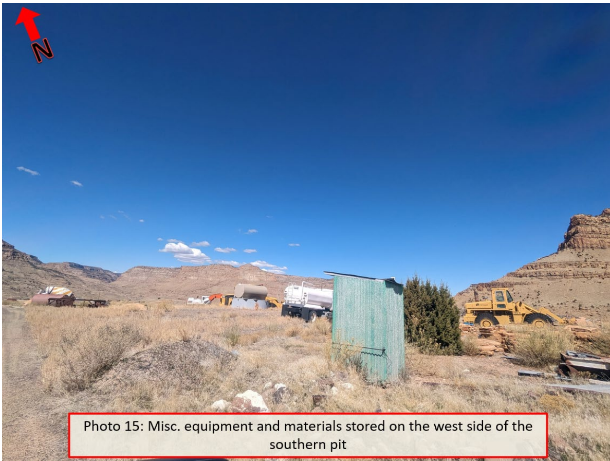
Photo 15: Misc. equipment and materials stored on the west side of the southern pit