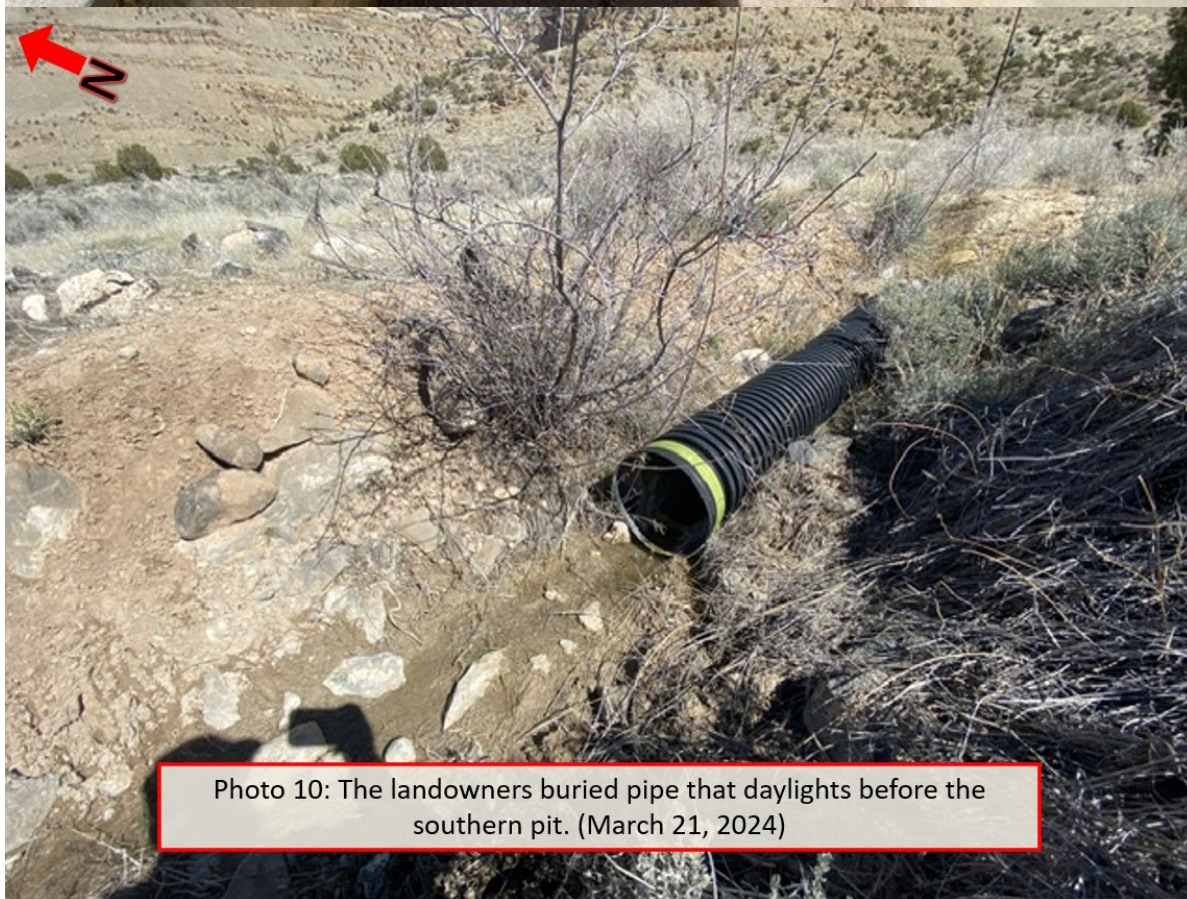
Photo 10: The landowners buried pipe that daylights before the southern pit. (March 21, 2024)