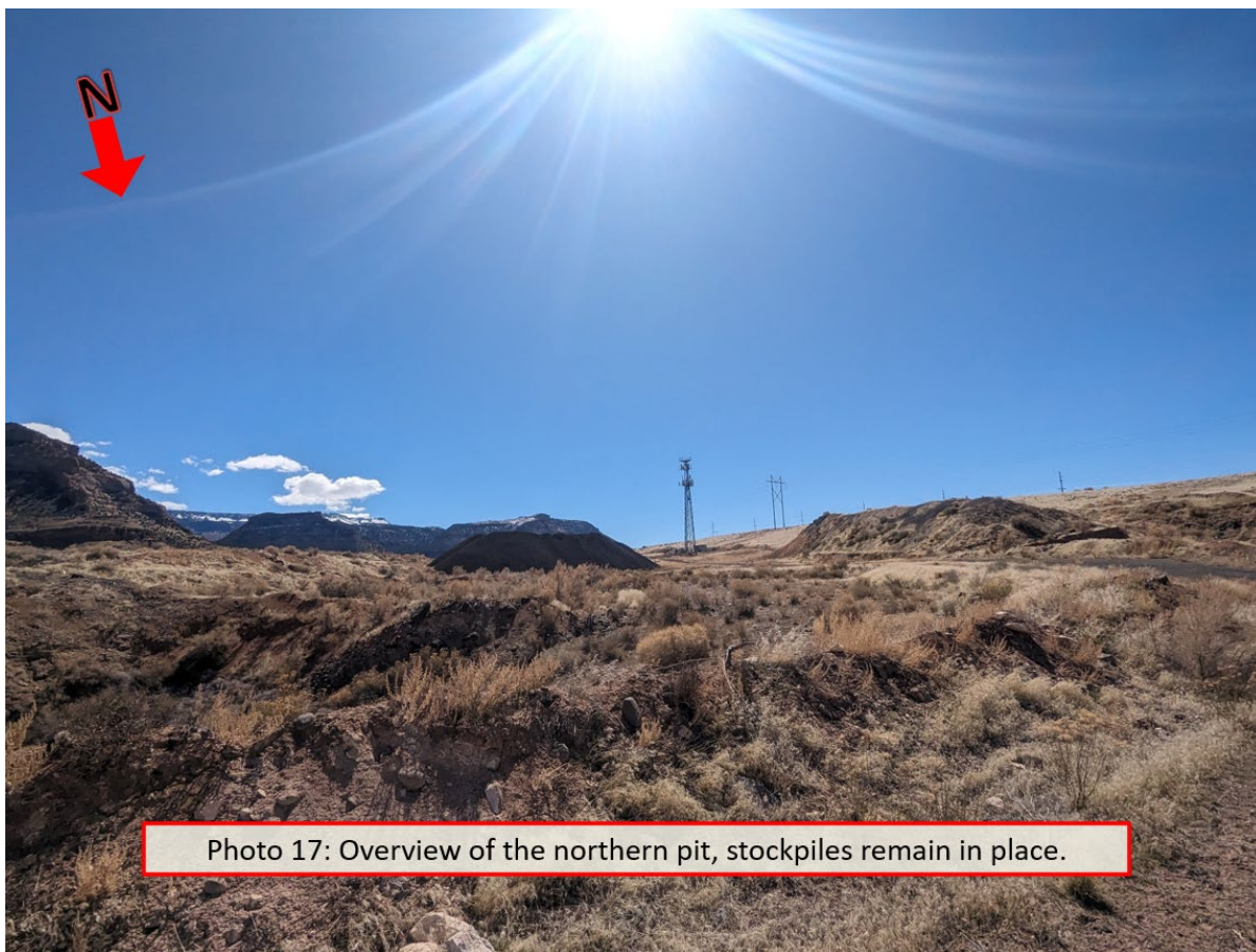
Photo 17: Overview of the northern pit, stockpiles remain in place.