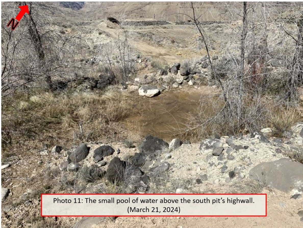
Photo 11: The small pool of water above the south pit's highwall. (March 21, 2024)