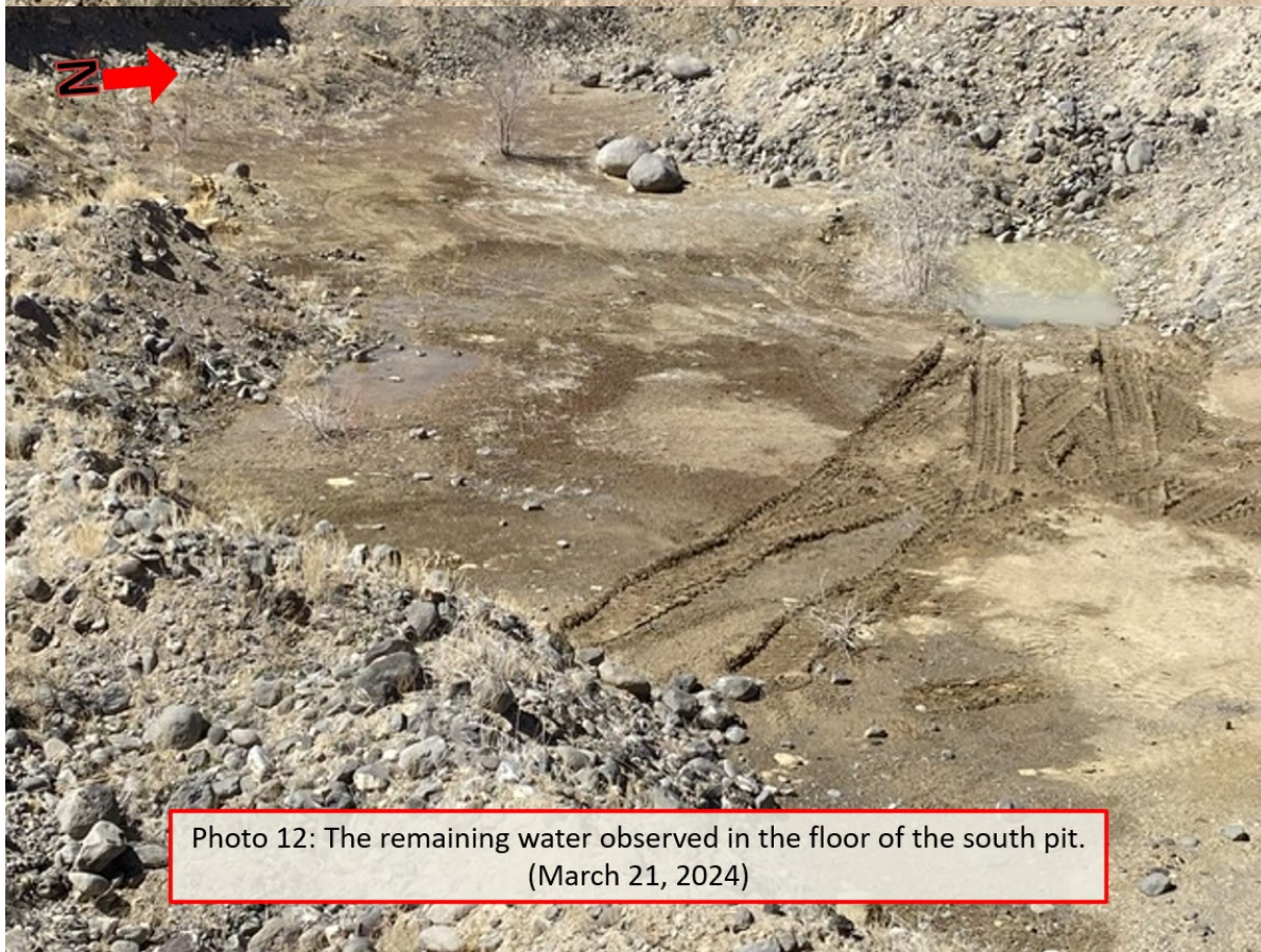
Photo 12: The remaining water observed in the floor of the south pit. (March 21, 2024)