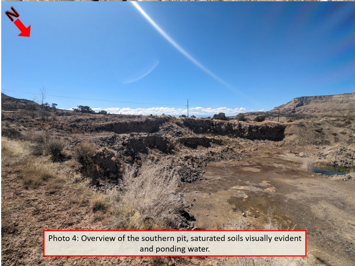
Photo 4: Overview of the southern pit, saturated soils visually evident and ponding water.