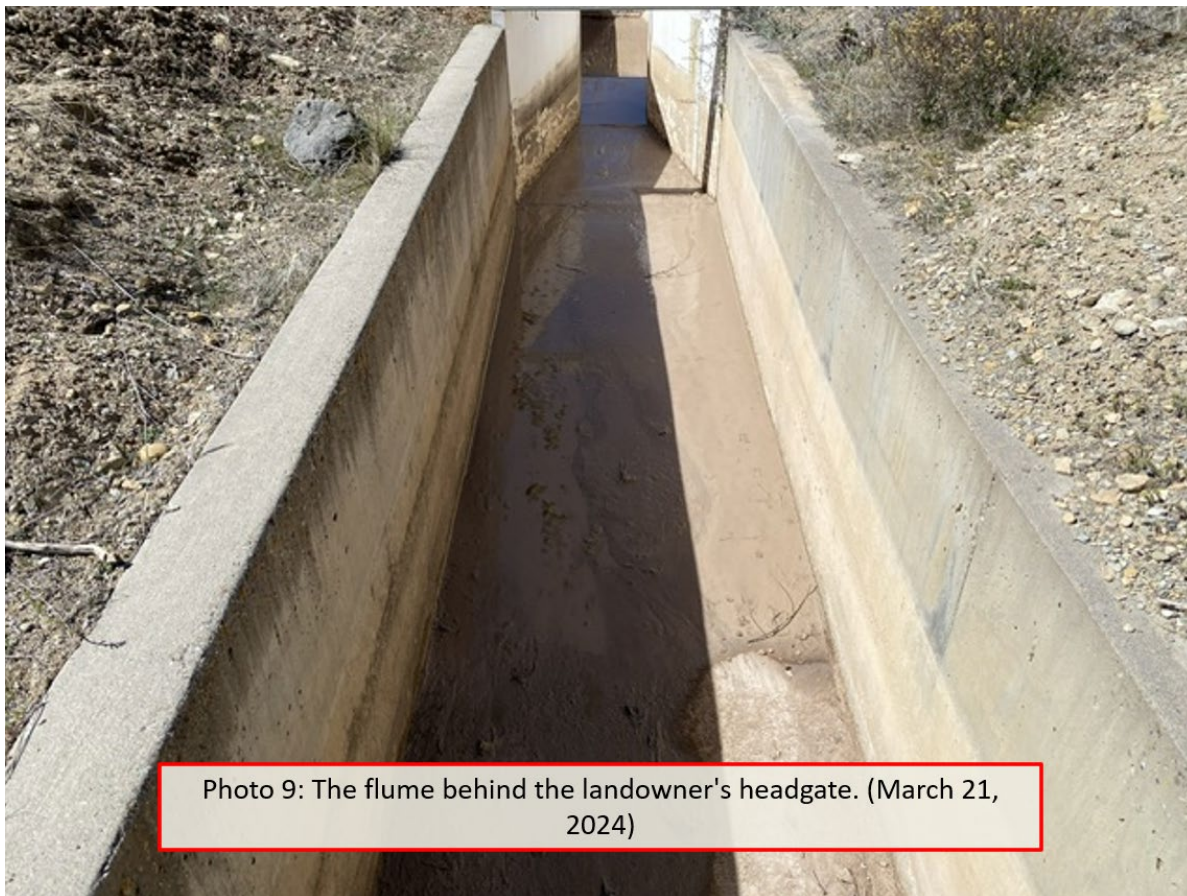
Photo 9: The flume behind the landowner's headgate. (March 21, 2024)