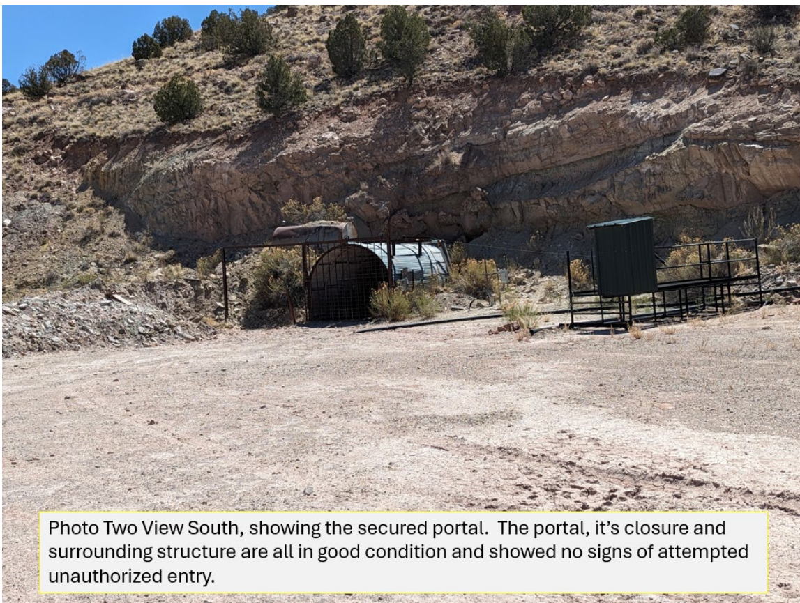
Photo Two View South, showing the secured portal. The portal, it's closure and surrounding structure are all in good condition and showed no signs of attempted unauthorized entry.