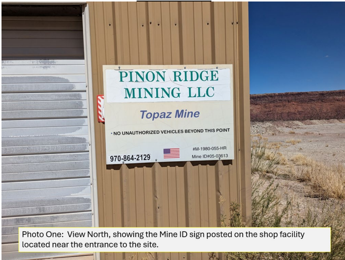
Photo One: View North, showing the Mine ID sign posted on the shop facility located near the entrance to the site.