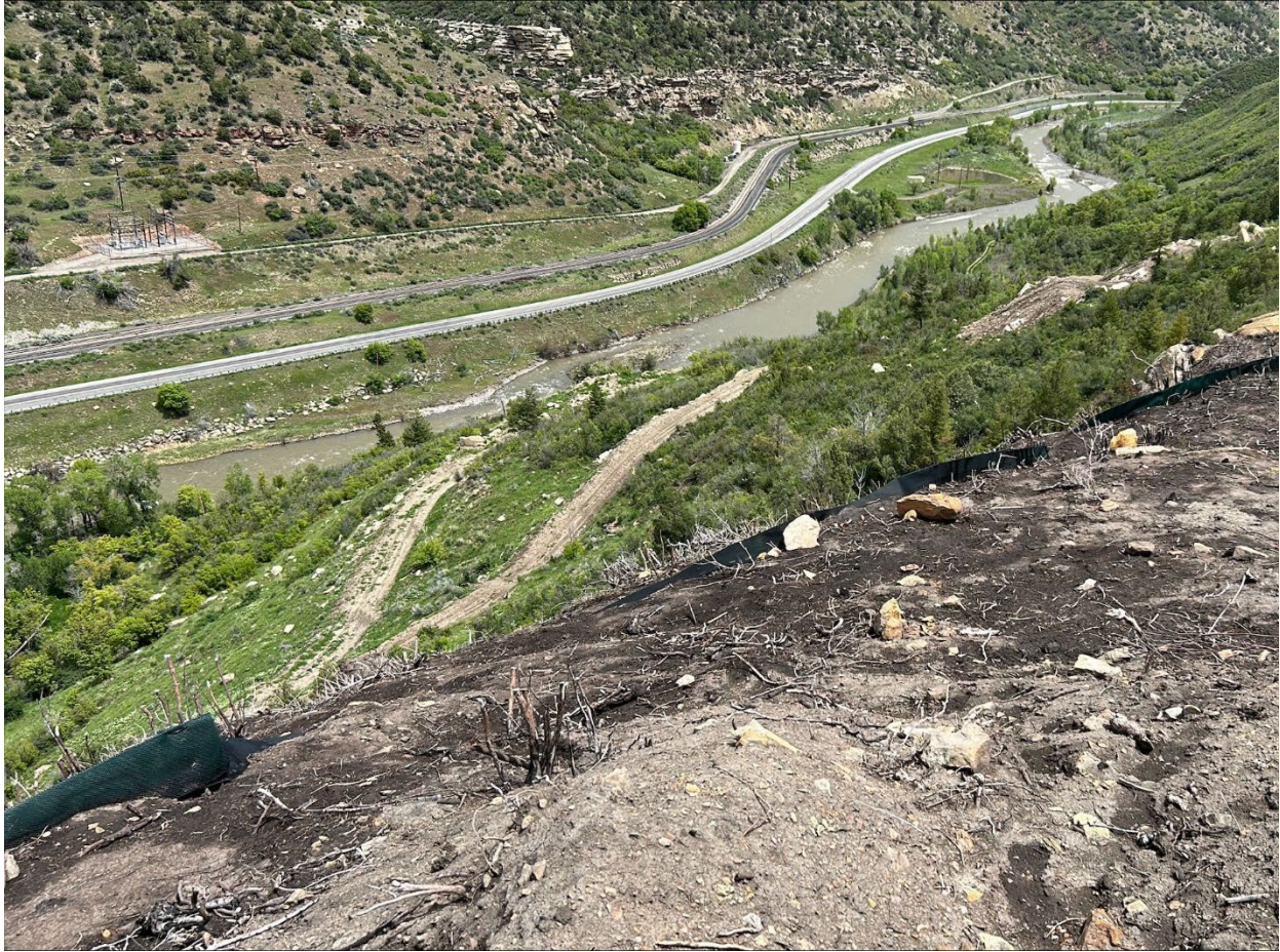
Figure 5: Silt fence sediment control

Number of Partial Inspection this Fiscal Year: 1