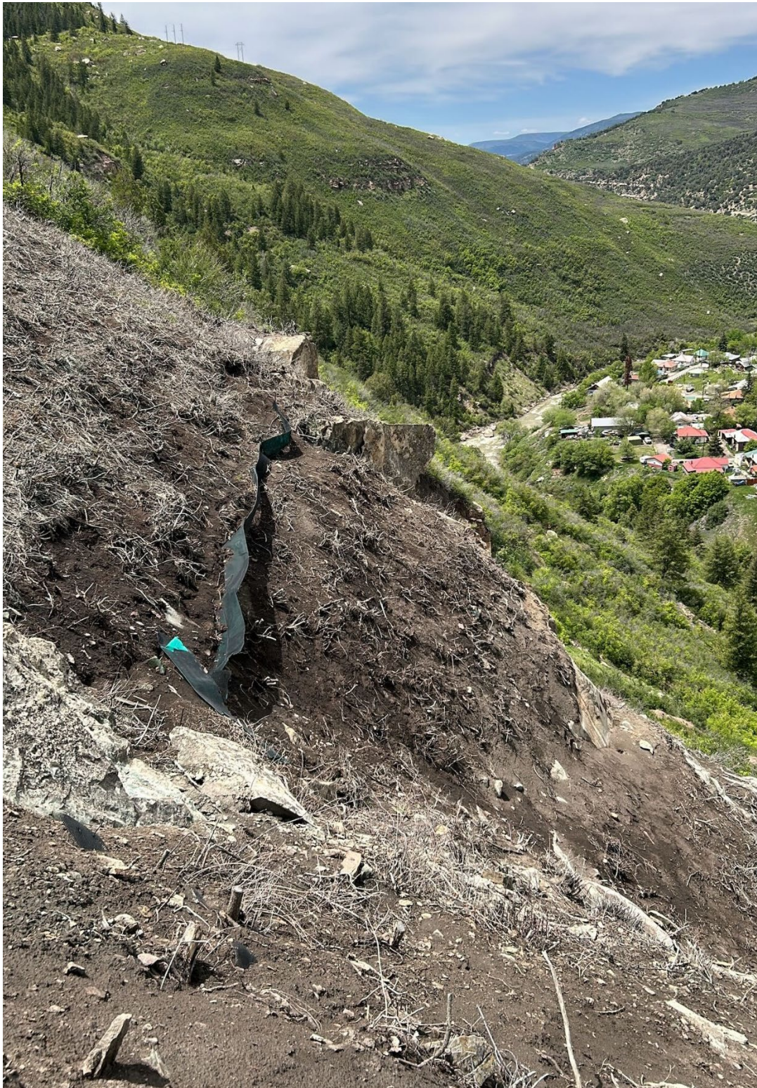
Figure 1: Silt fence below bench

Number of Partial Inspection this Fiscal Year: 1