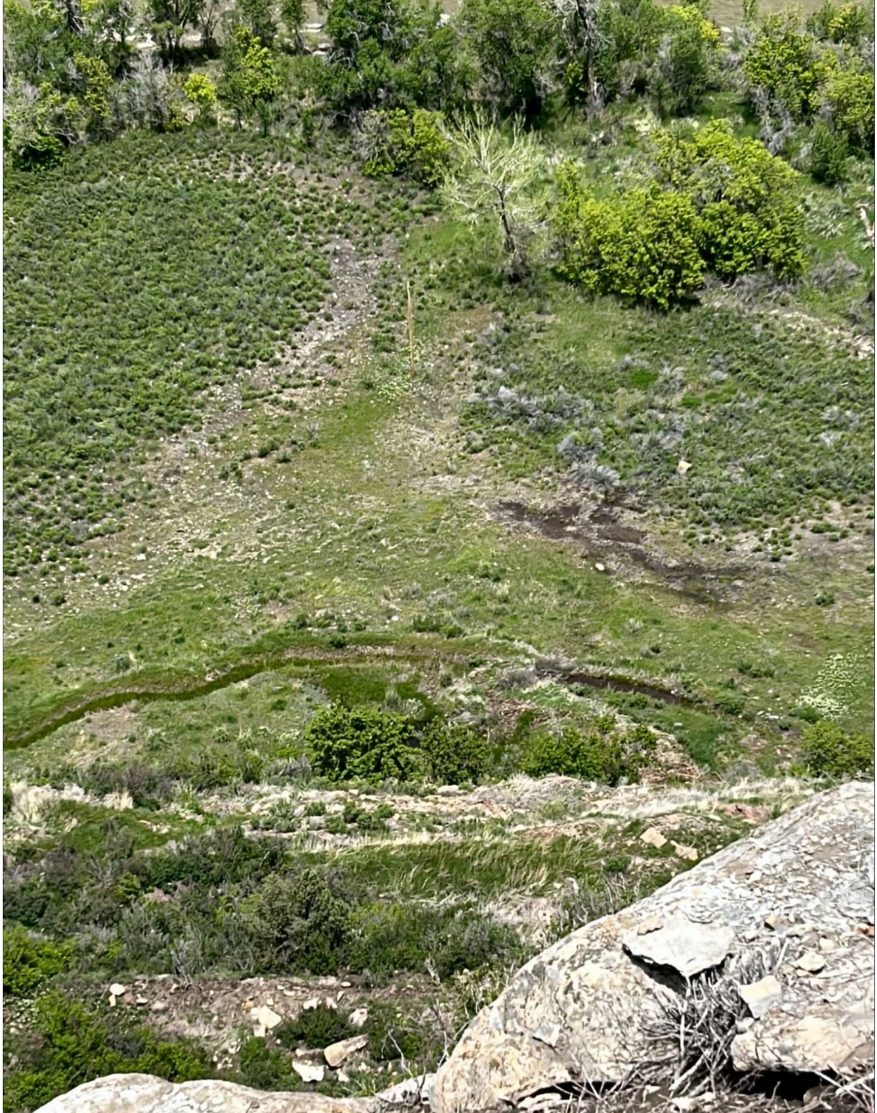
Figure 4: View of seep area from bench

Number of Partial Inspection this Fiscal Year: 1