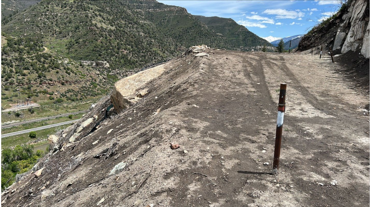
Figure 2: View along bench to the east