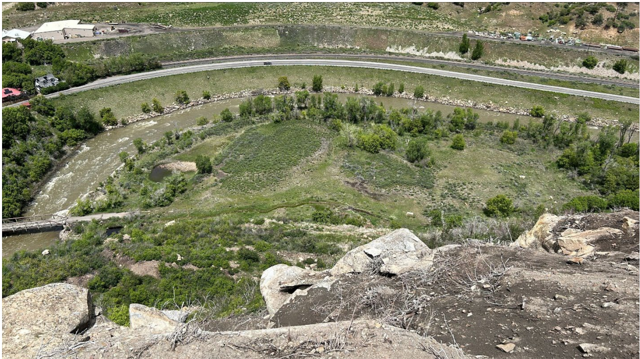
Figure 3: Overview of site

Number of Partial Inspection this Fiscal Year: 1