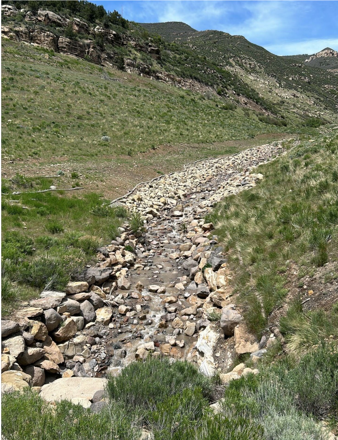
Figure 1: Lower section of reclaimed Elk Creek channel

Number of Partial Inspection this Fiscal Year: 8