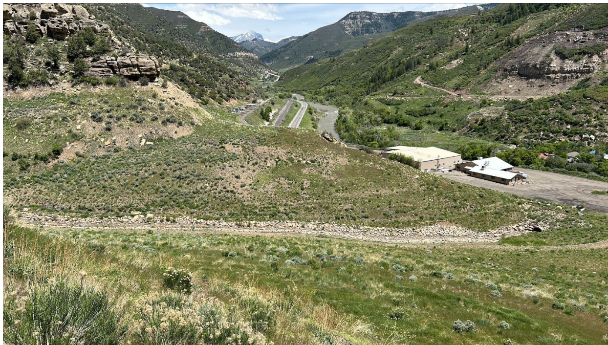
Figure 2: Reclaimed slopes of Elk Creek channel