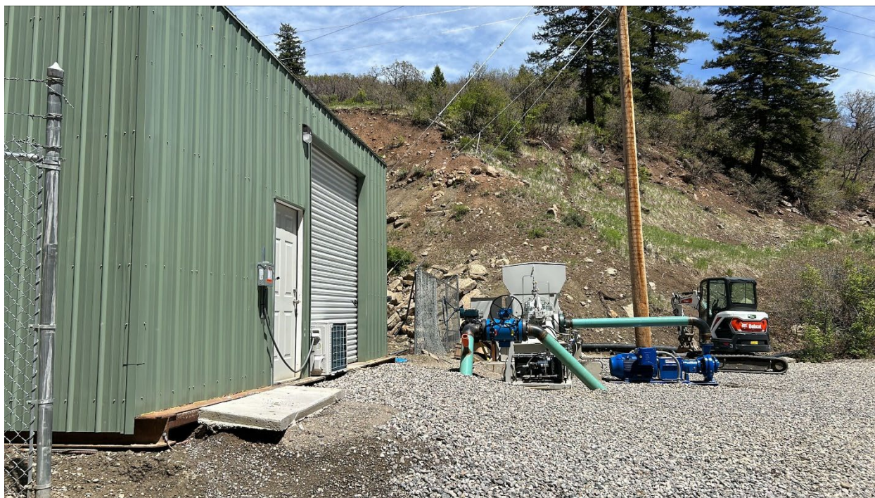
Figure 3: Recently installed equipment and broken fence at Bear Creek methane destruction facility

Number of Partial Inspection this Fiscal Year: 8