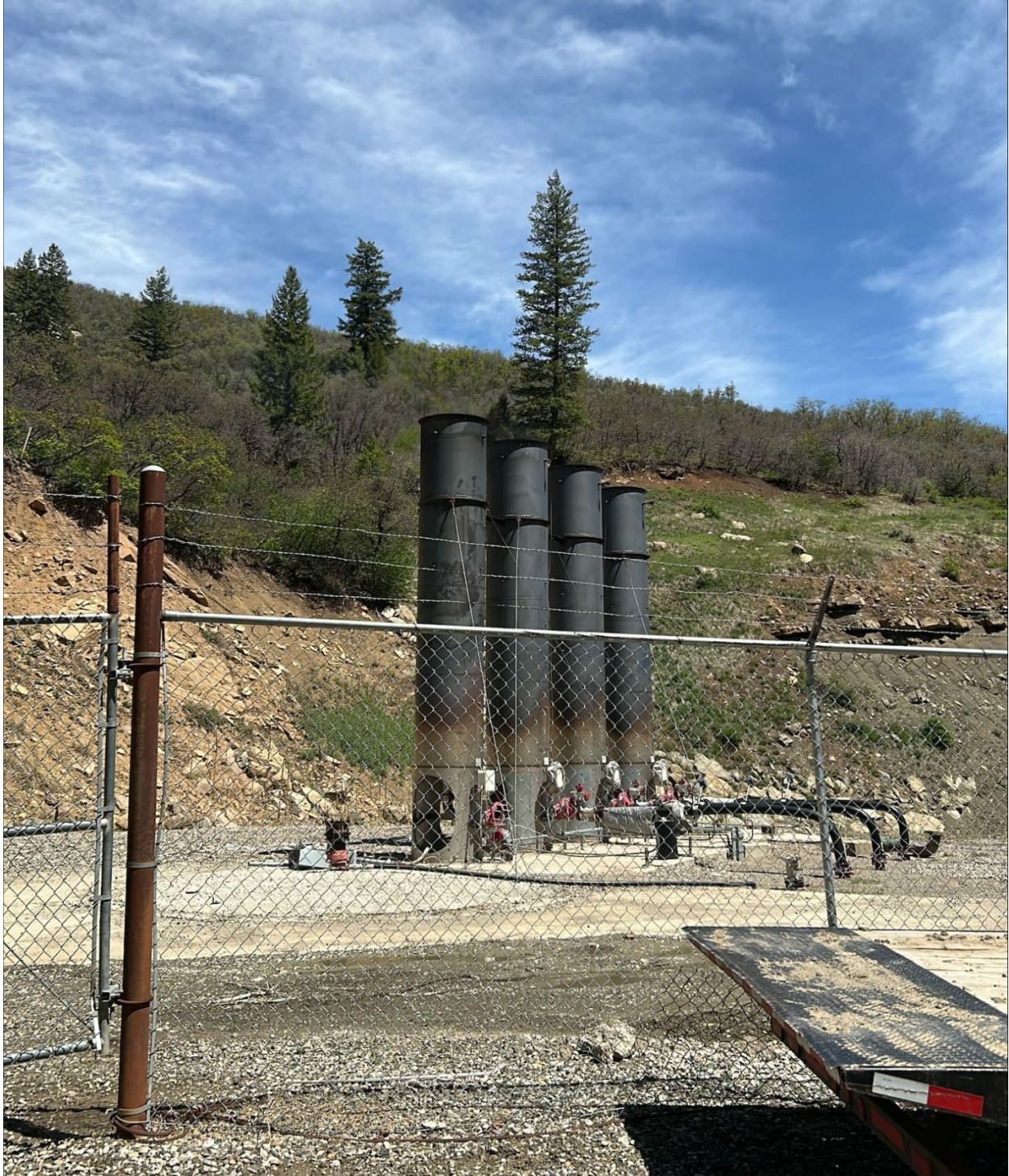
Figure 4: All four burners at Bear Creek Methane Destruction Facility operating

Number of Partial Inspection this Fiscal Year: 8