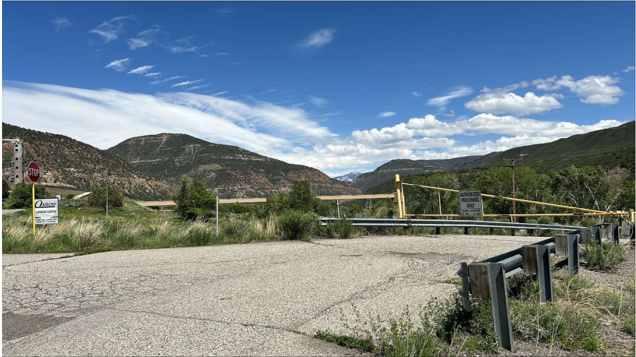
Figure 1: Gate locked, Mine ID sign in place