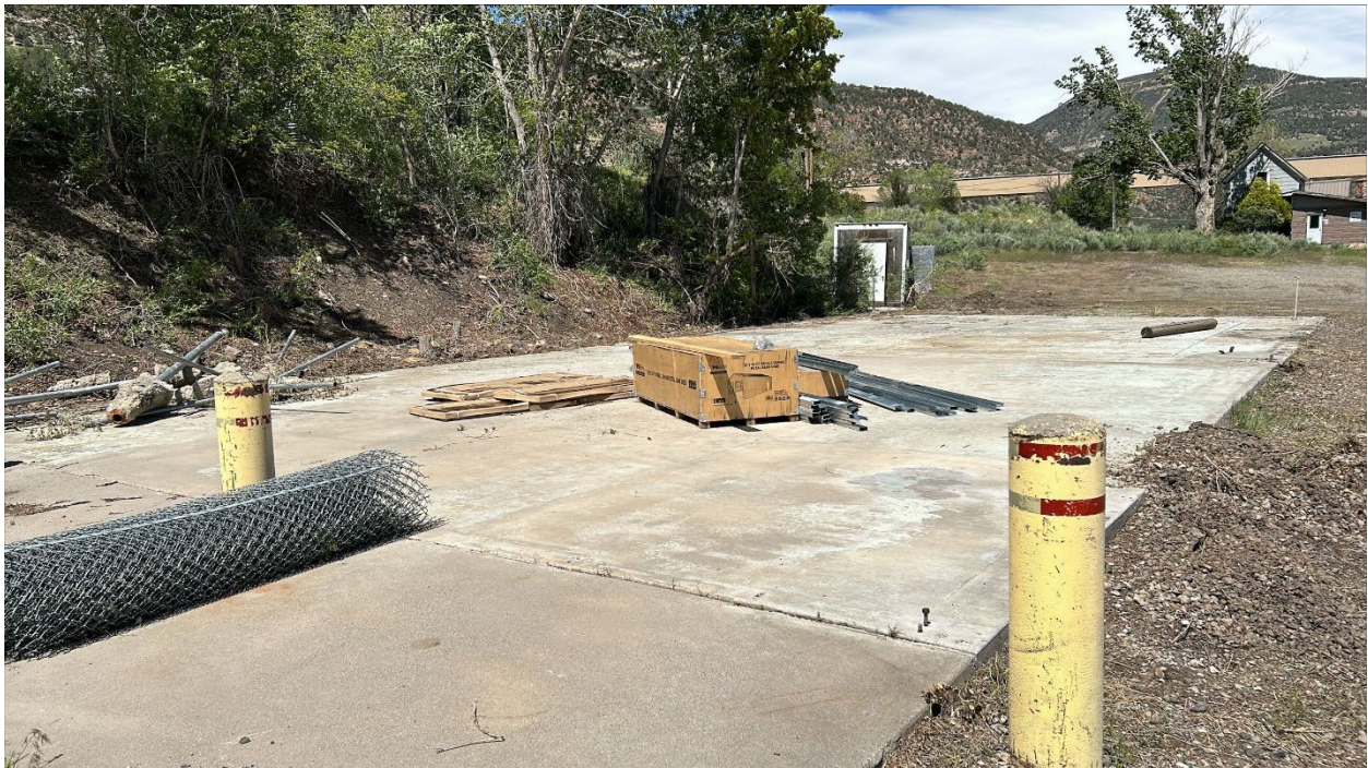
Figure 4: Garage/shop foundation pad

Number of Partial Inspection this Fiscal Year: 8