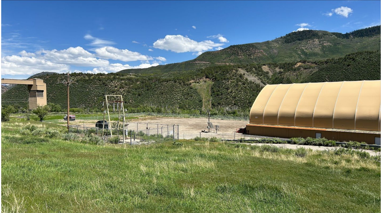
Figure 5: Lower pad and temporary building