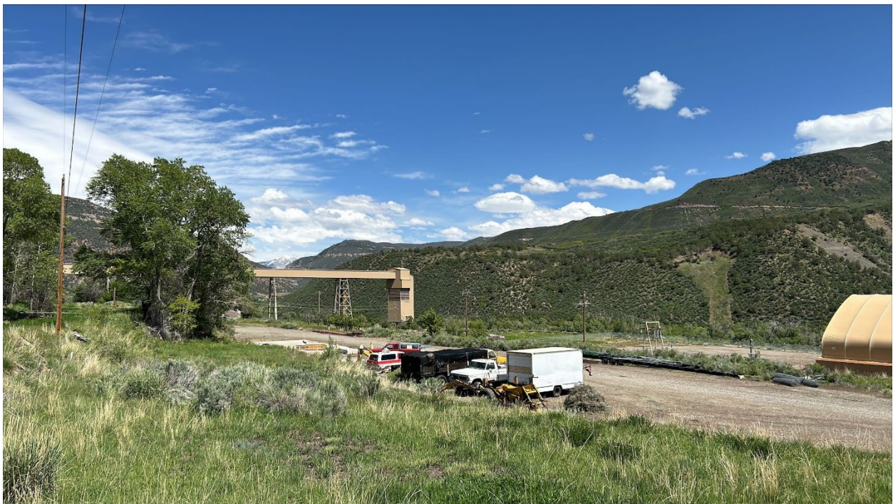
Figure 2: Overview of upper pad

Number of Partial Inspection this Fiscal Year: 8