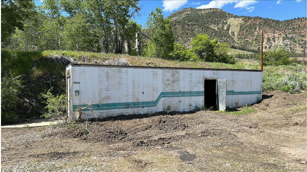
Figure 3: Trailer