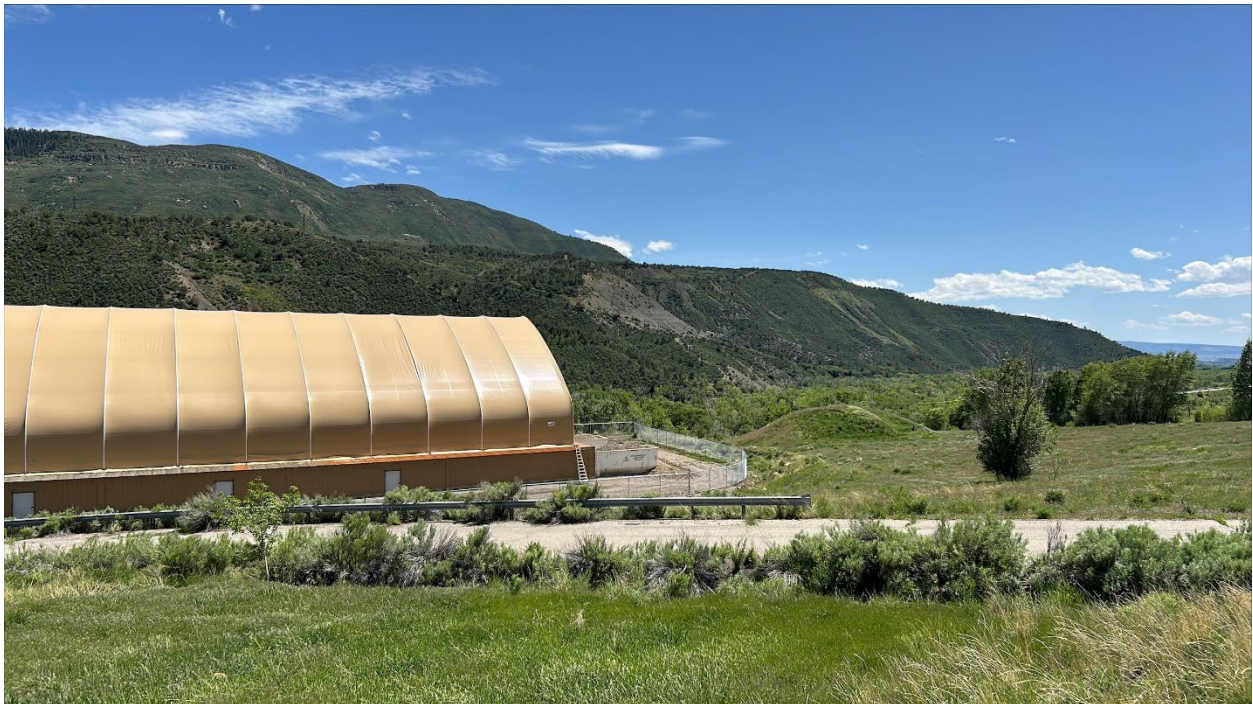
Figure 6: Western end of lower pad and temporary building

Number of Partial Inspection this Fiscal Year: 8