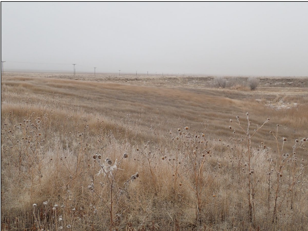
Photo 2. Sample photo of reclamation work (northern slope); looking east.