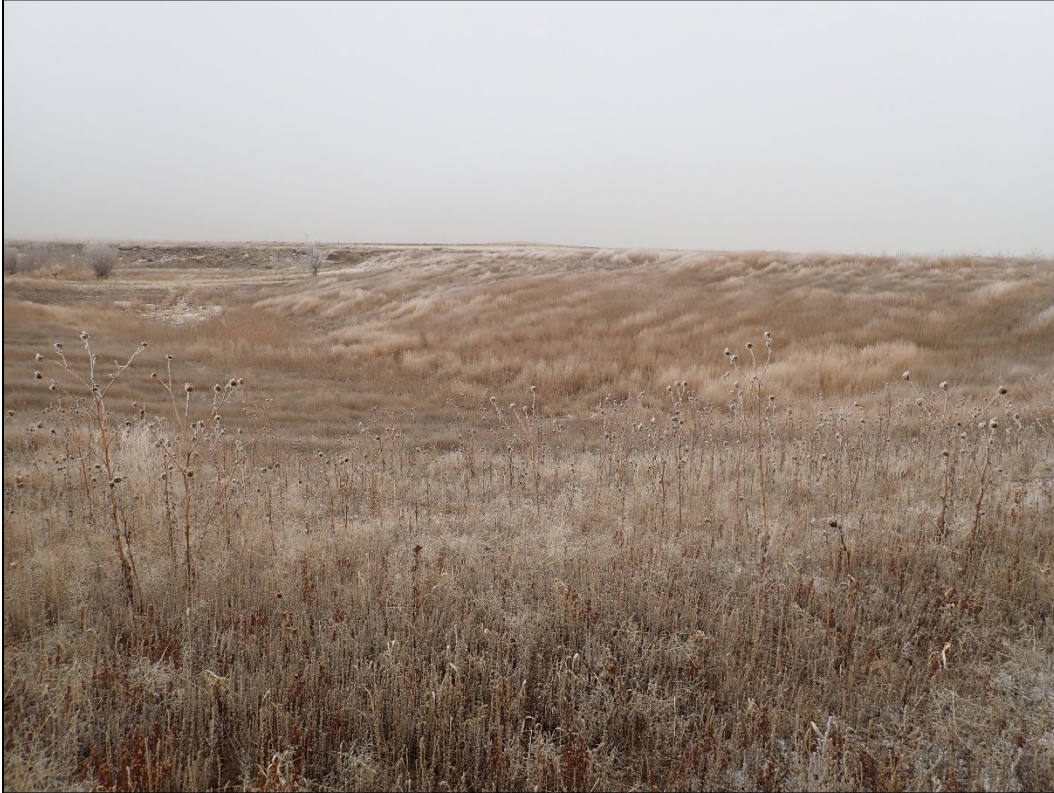
Photo 1. Sample photo of reclamation work (southern slope); looking southeast.