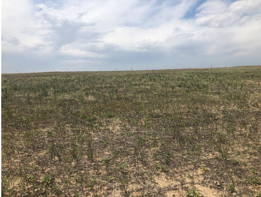
East side of Area 37, with emerging grasses