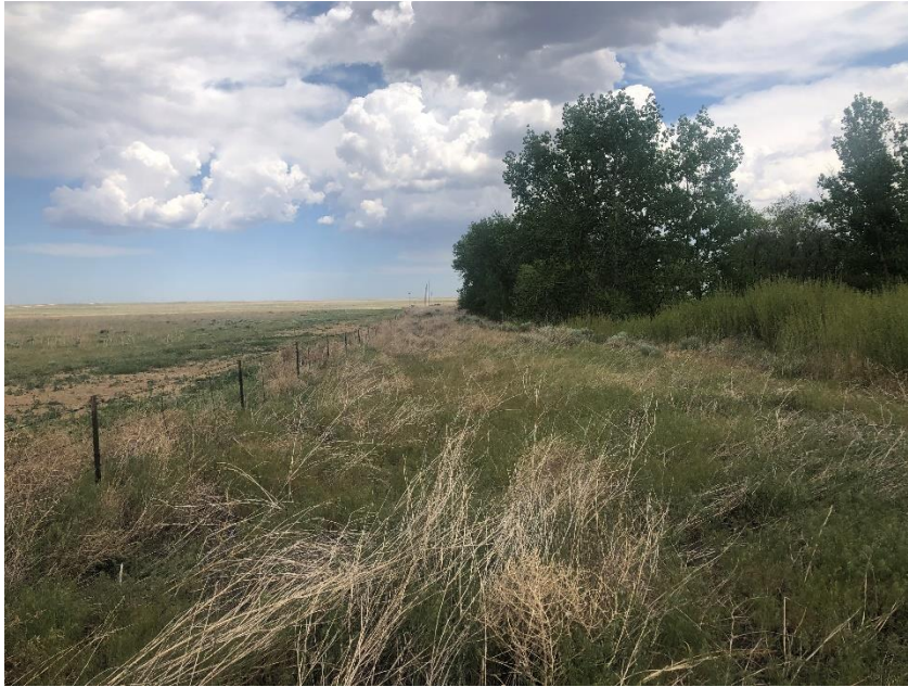
Sediment Pond 2, looking east towards spillway