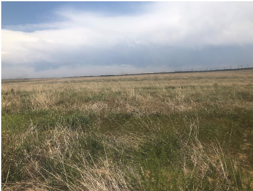
Southwest corner of permit area, looking south

Number of Partial Inspection this Fiscal Year: 7