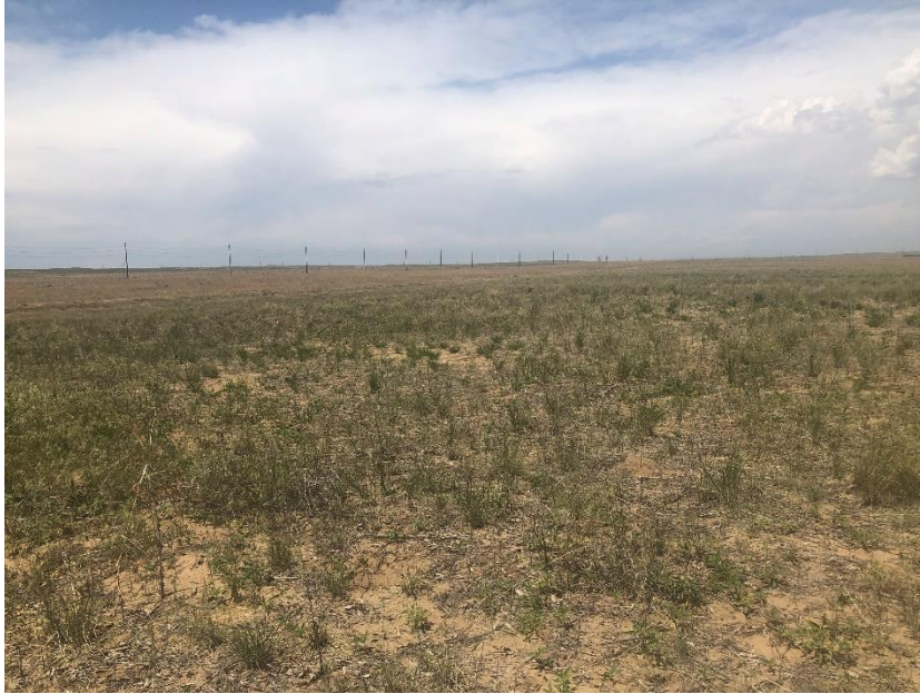
West side of permit area, looking northwest