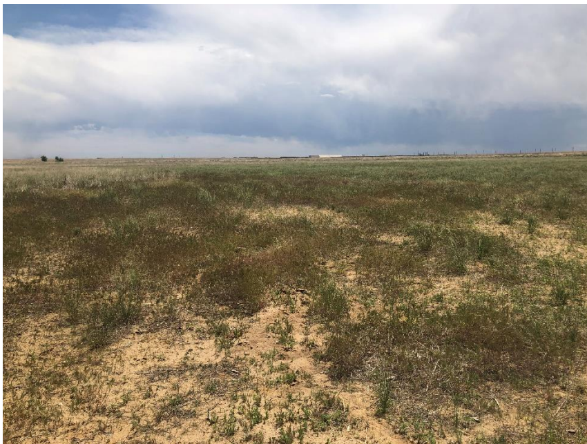
Southwest corner of Area 37, with cheat grass

Number of Partial Inspection this Fiscal Year: 7