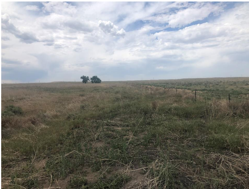
North boundary, looking west

Number of Partial Inspection this Fiscal Year: 7