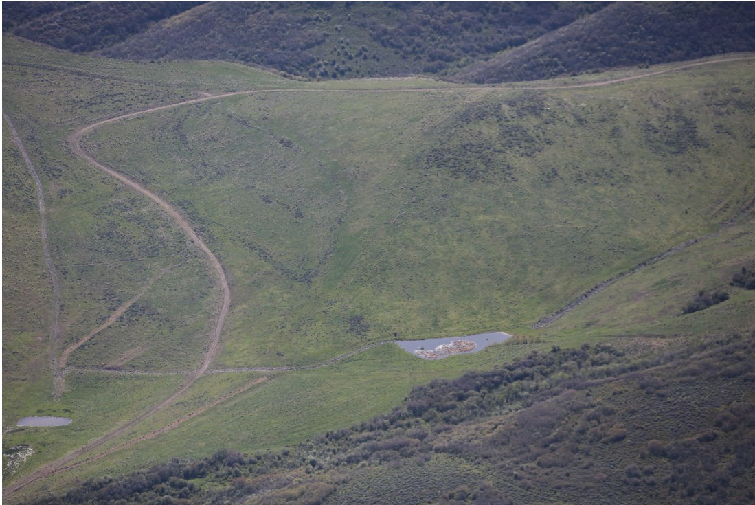
Photo 4: Stock Tank 18 full, not discharging, and associated reclamation.