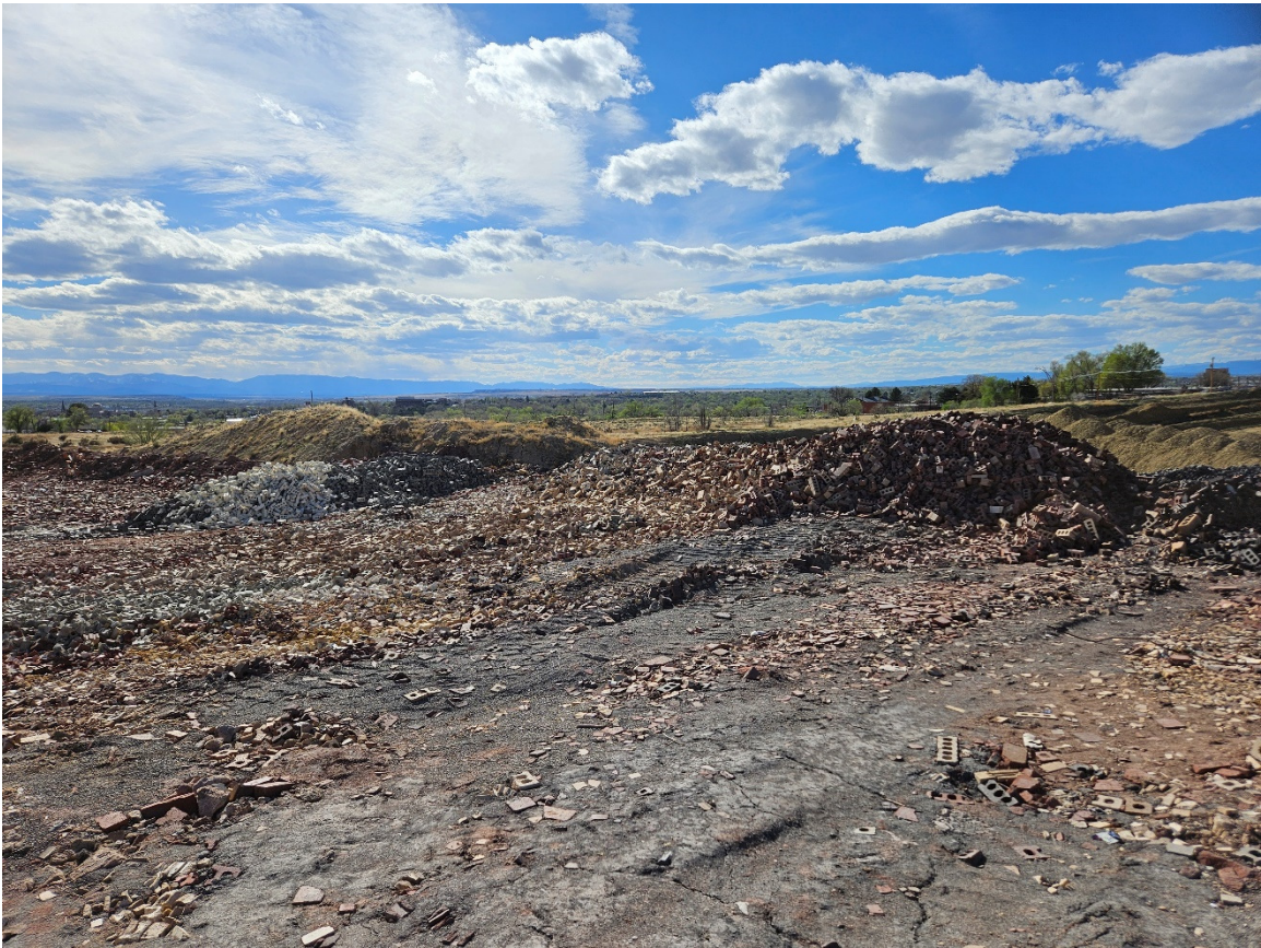
Photo at top of brick backfill looking to the northwest while standing further west