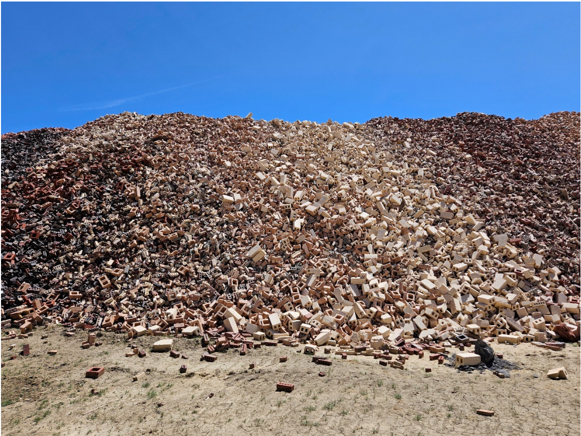
Photo at bottom of brick backfill looking to the south