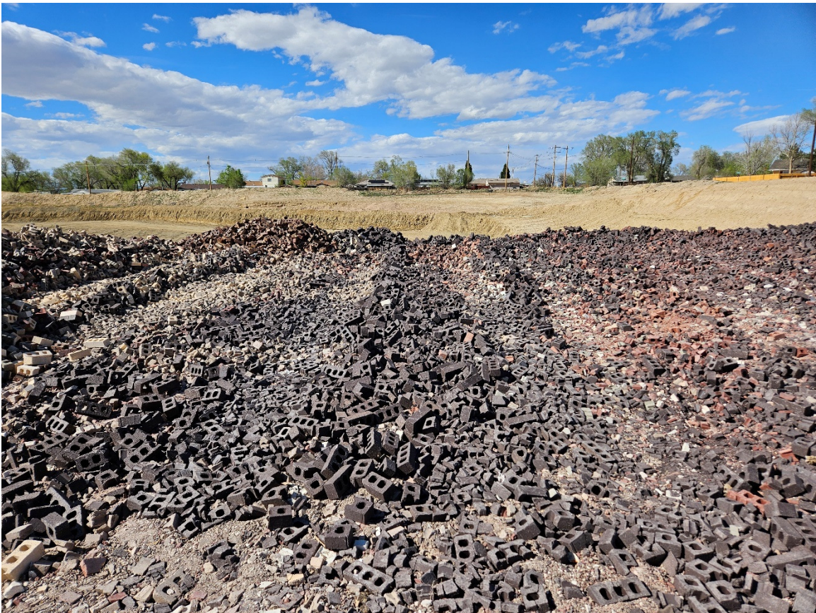
Photo at top of brick backfill looking to the north