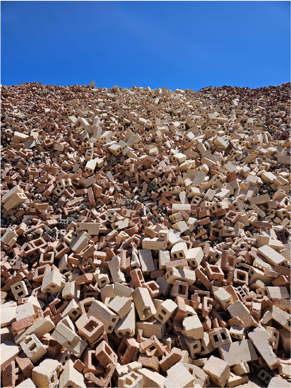
Photo of third closeup of brick backfill material at bottom