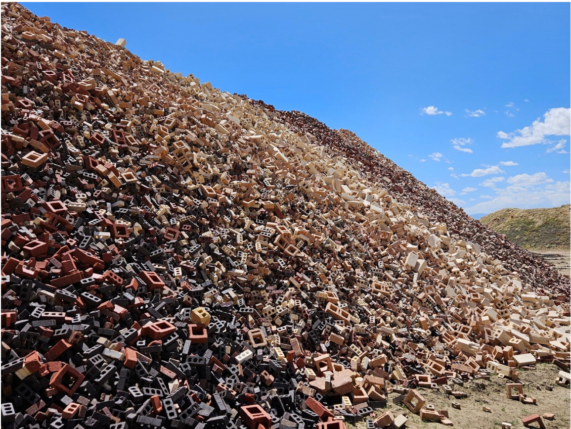
Photo at bottom of brick backfill looking to the west