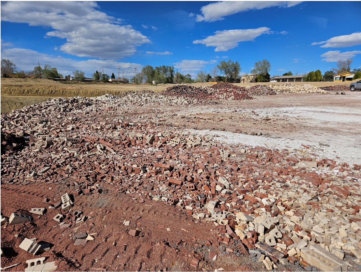
Photo at top of brick backfill looking to the east