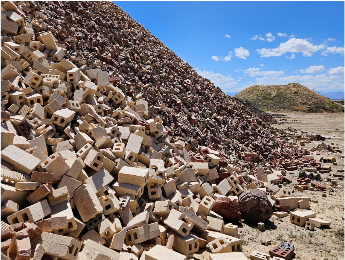
Photo at bottom of brick backfill looking to the west while standing further west