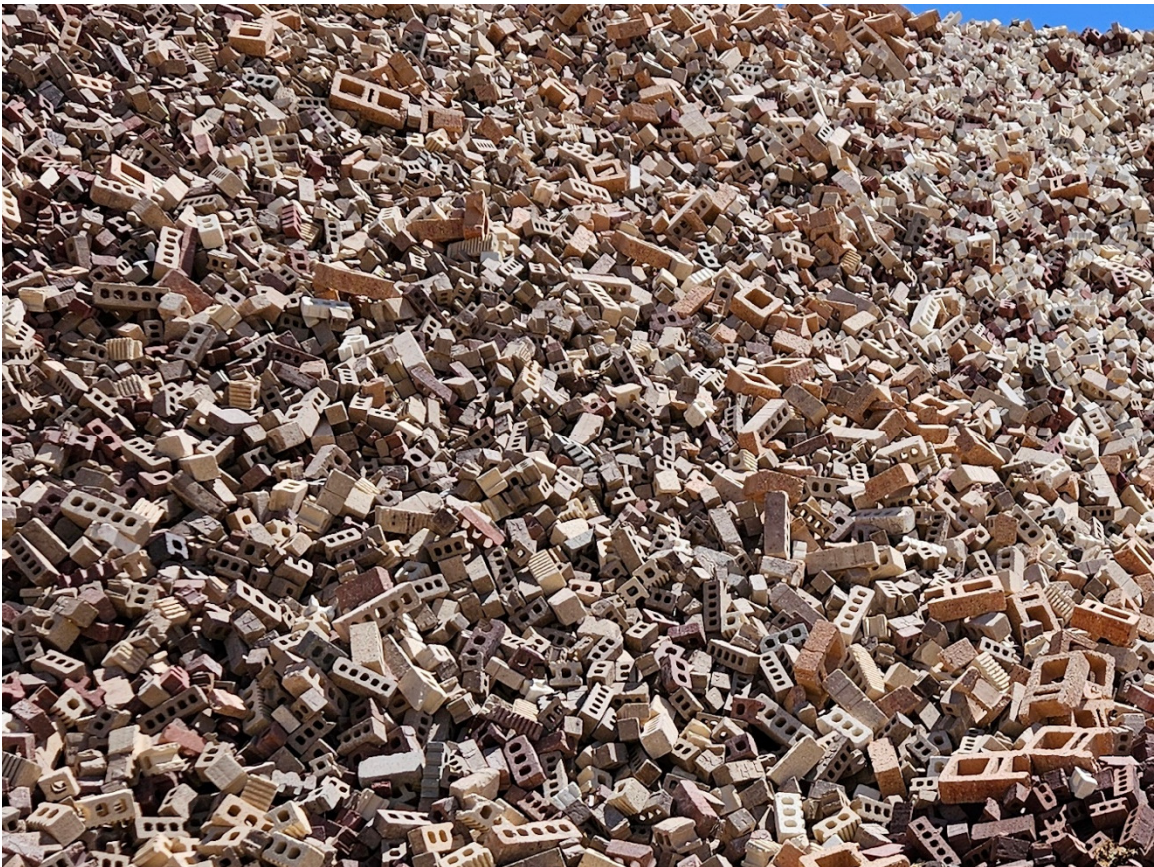
Photo of closeup of brick backfill material at bottom