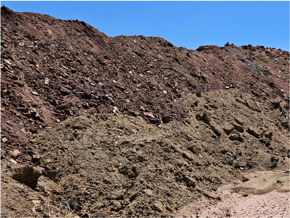
Photo of brick backfill material on ramp to pit floor with trees removed.