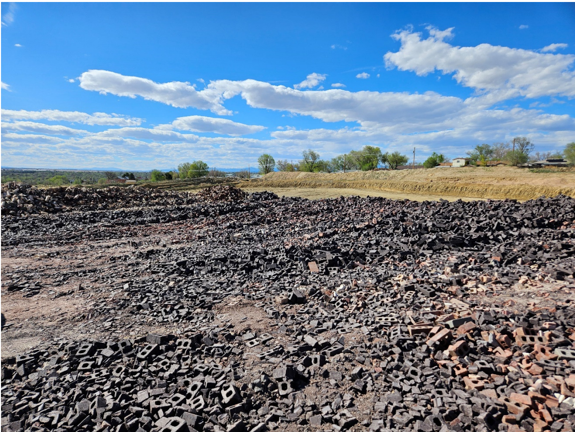
Photo at top of brick backfill looking to the northwest