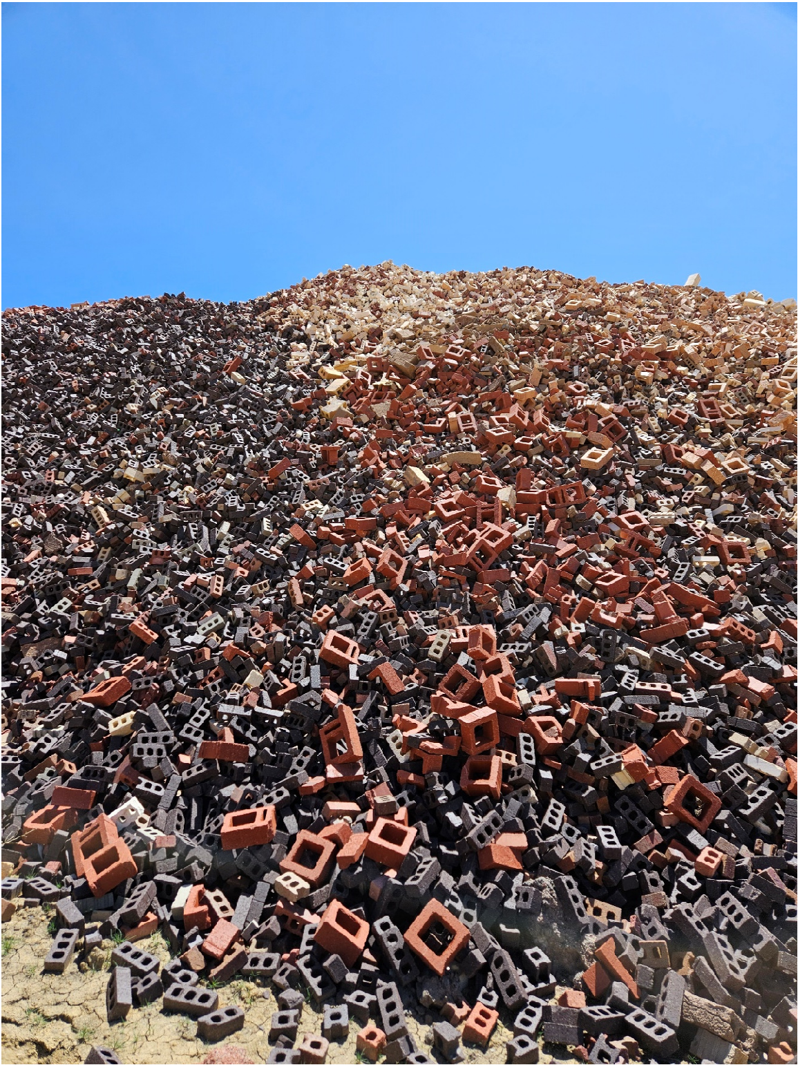
Photo of second closeup of brick backfill material at bottom