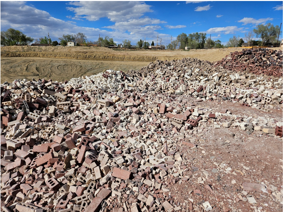
Photo of second closeup of brick piles at top of brick backfill