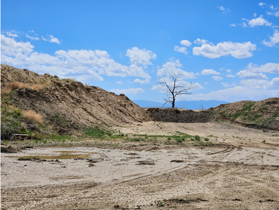
Photo of north side of topsoil stockpile with side re-sloped to be at angle of repose

CORRECTIVE ACTION COMPLETED: The slopes of the topsoil stockpile have been re-sloped to be at the angle of repose. The disturbed areas of the topsoil stockpile slopes shall be revegetated in accordance with our permit.