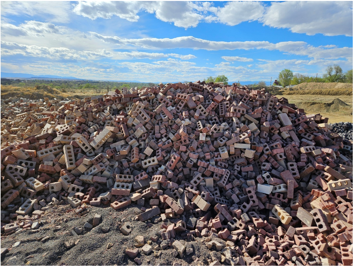
Photo of closeup of brick pile at top of brick backfill