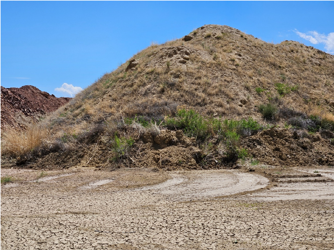
Photo of topsoil stockpile looking west with tamarisk plants removed

CORRECTIVE ACTION COMPLETED: The tamarisk plants were removed from near the topsoil stockpile. As tamarisk is an ongoing issue since tamarisk was known to be established near the Fountain River, the existing weed control plan shall be followed.