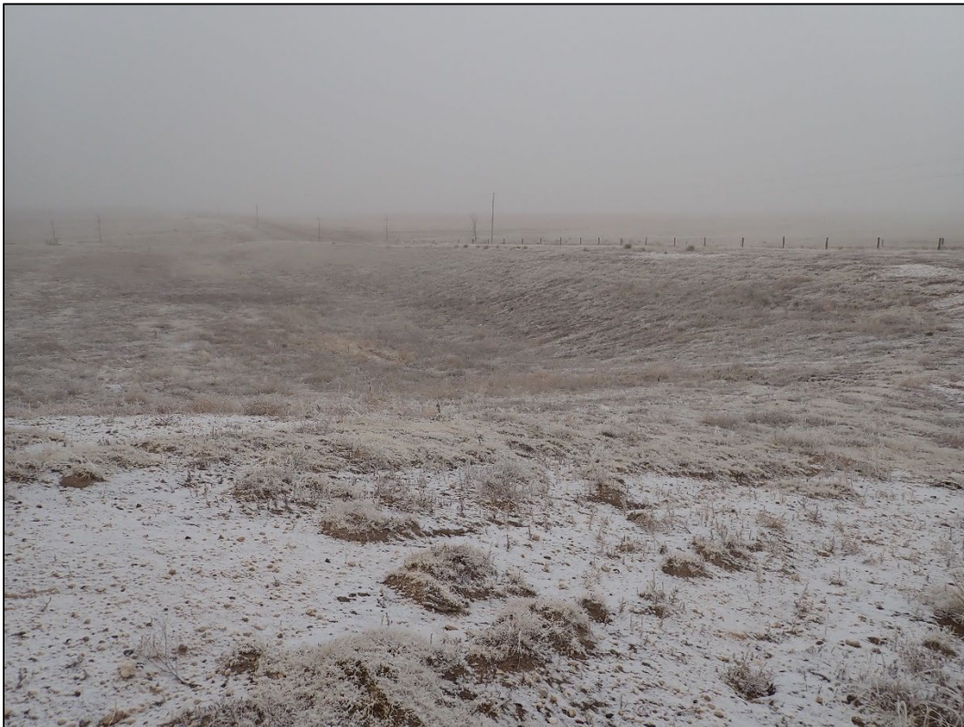
Photo 4. Sample photo of the reclaimed southern mining area; looking northeast.