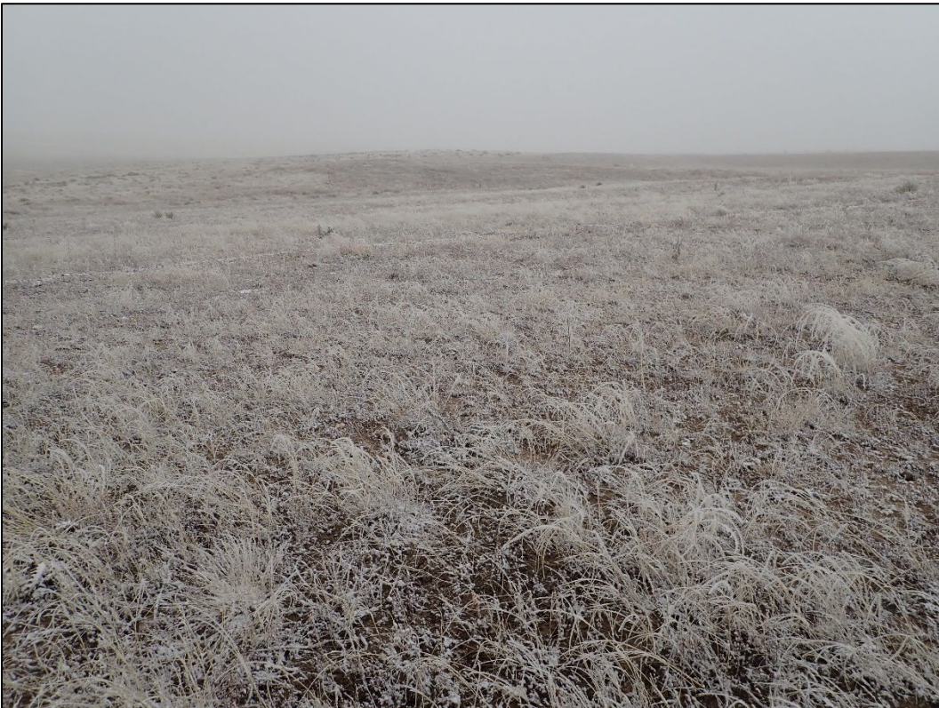
Photo 2. Sample photo of the reclaimed northern mining area; looking northwest.