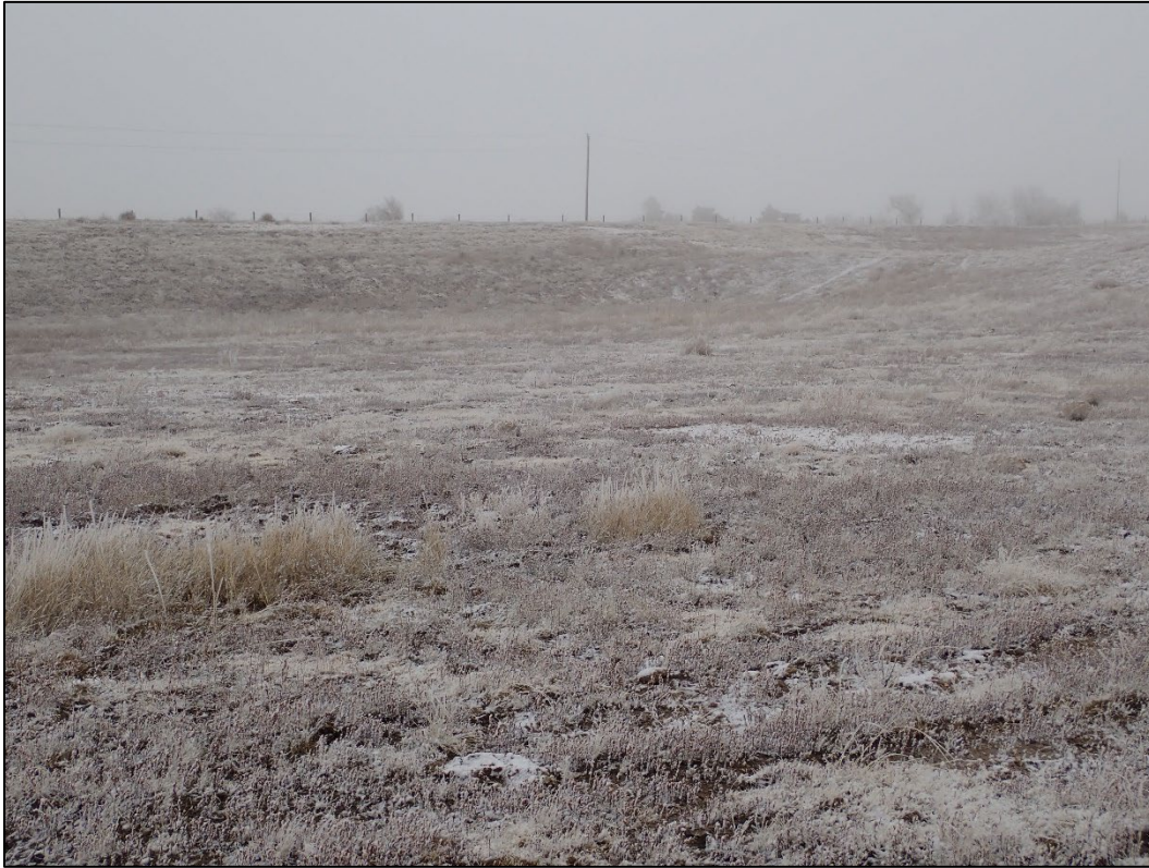
Photo 3. Sample photo of the reclaimed southern mining area; looking southeast.