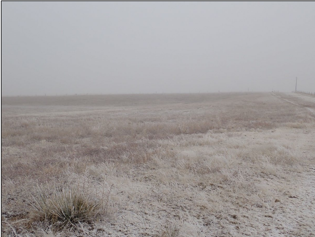
Photo 1. Sample photo of the reclaimed northern mining area; looking north.