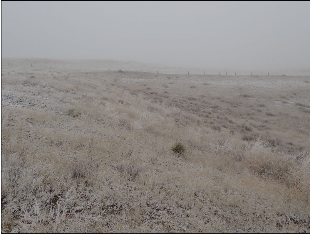
Photo 5. Sample photo of the reclaimed mining area located to the west of the southern mining area; looking south.

Jim McCormick McCormick Excavation & Paving, LLC 30887 Hwy 24 Stratton, CO 80836