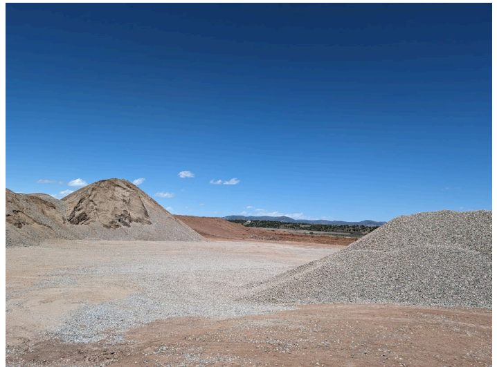
Phase B Area