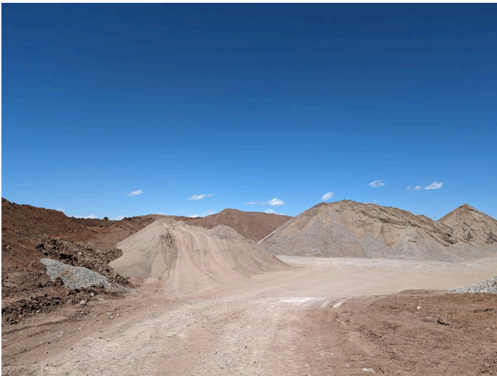
Phase B Area