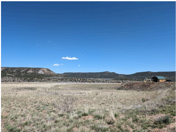
Phase D Area