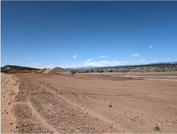
Phase C Area