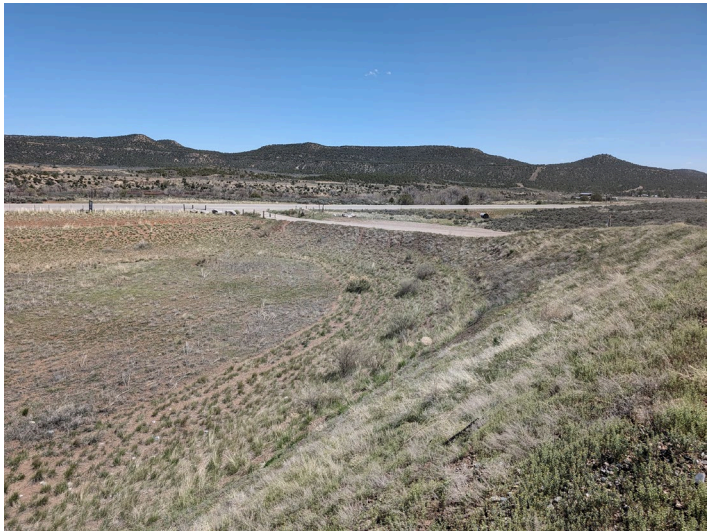
Phase D Area