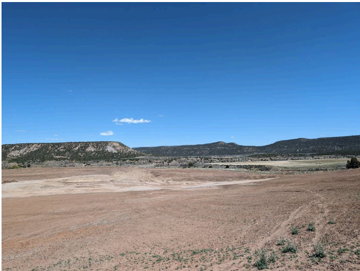
Phase C Area