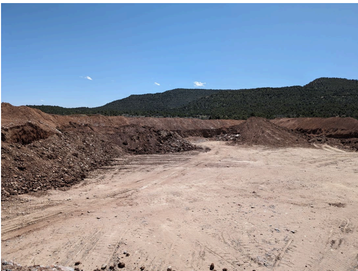
Phase A Area