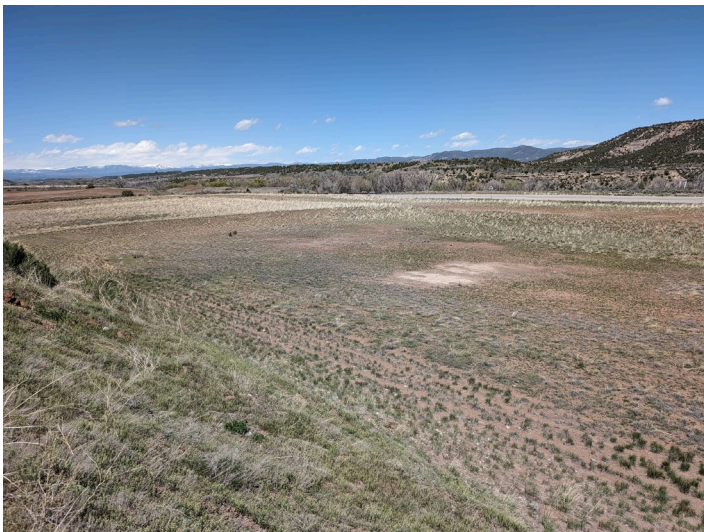
Phase D Area