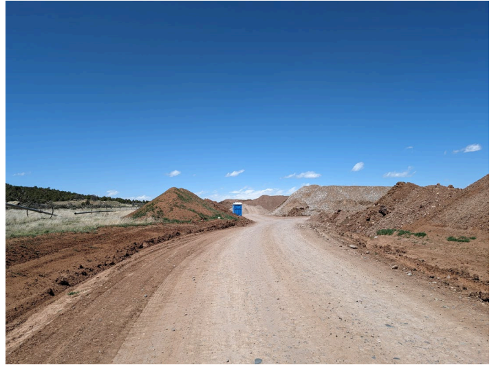
New road to Phase A and B areas