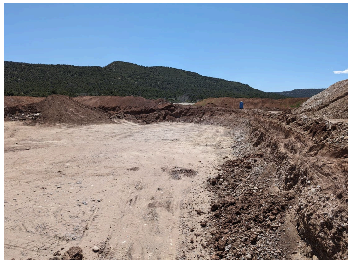
Phase A Area