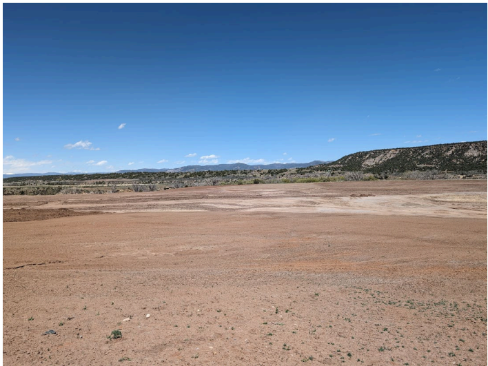
Phase C Area