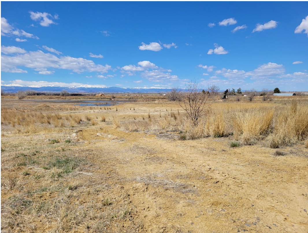
Photo 4: Looking down into the reservoir from the access road on the eastern side.