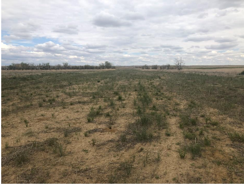
Area 42 near Area 33, looking east toward Dugout Pond