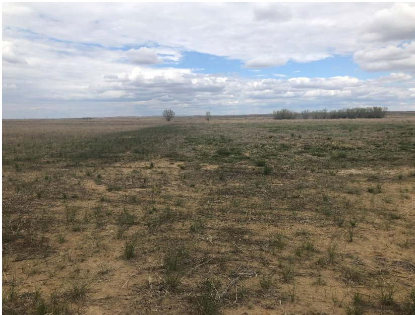
Area 42 near Area 33, looking north toward Sediment Pond 2

Number of Partial Inspection this Fiscal Year: 7