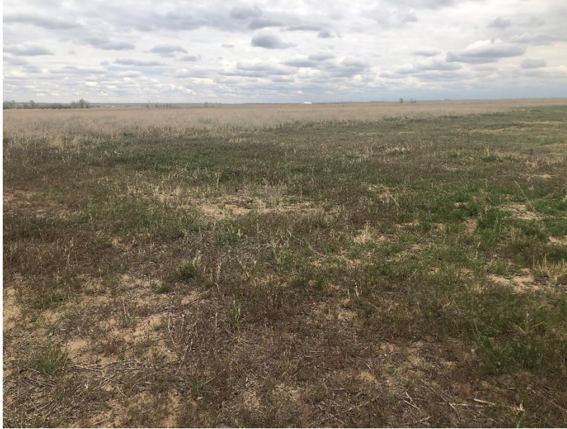
Area 37 – area reseeded in 2023