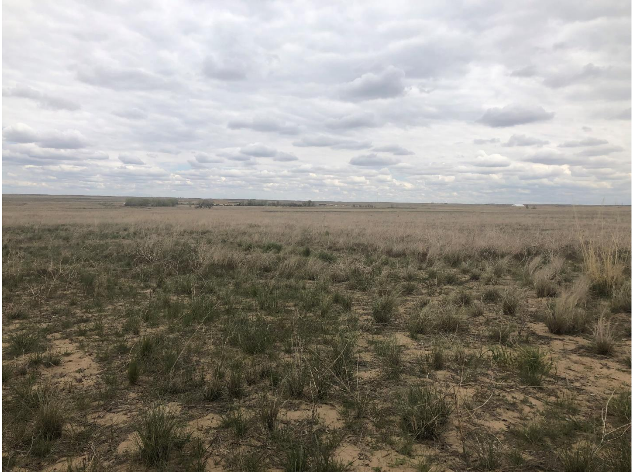
Long Term Spoil area, looking east from Area 44

Number of Partial Inspection this Fiscal Year: 7