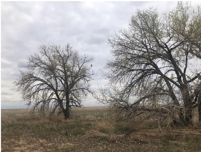
Owl in tree west of Sediment Pond 2

Number of Partial Inspection this Fiscal Year: 7