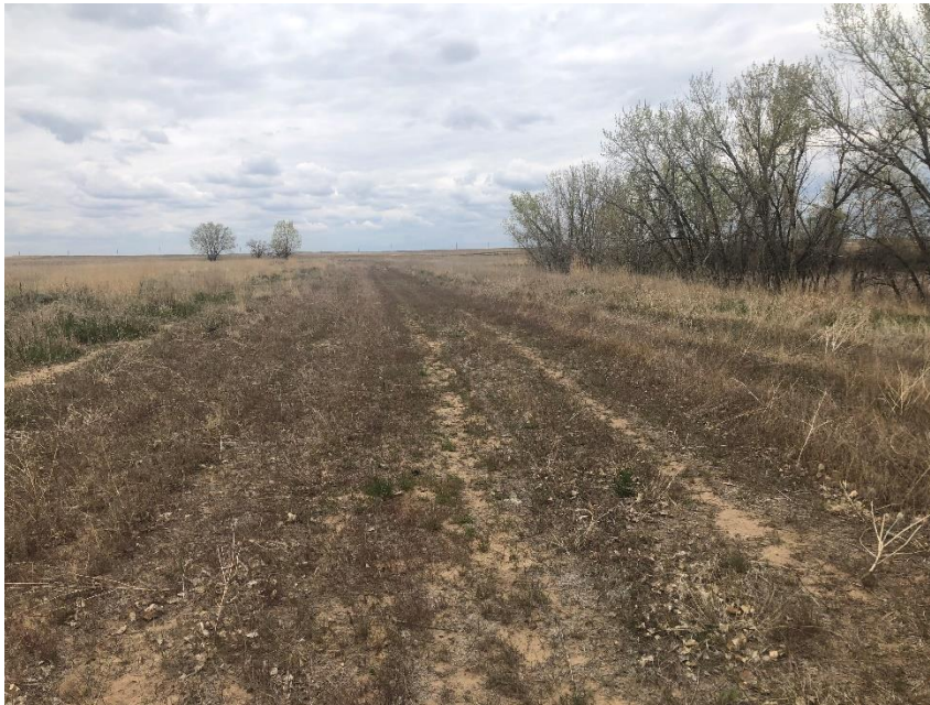
Reclaimed road adjacent to Sediment Pond 2