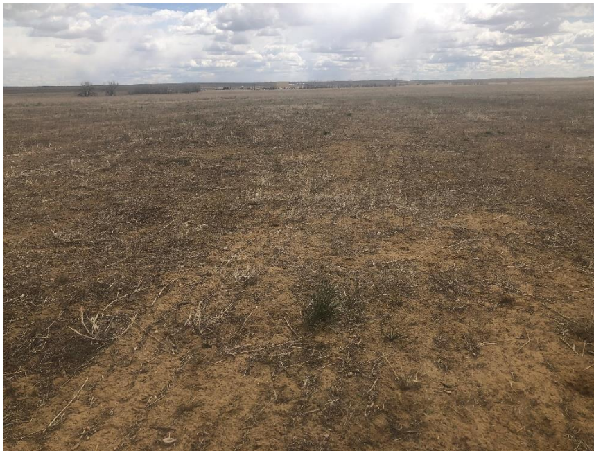
Emerging grass in Area 36, which was harrowed and seeded in 2023

Number of Partial Inspection this Fiscal Year: 6