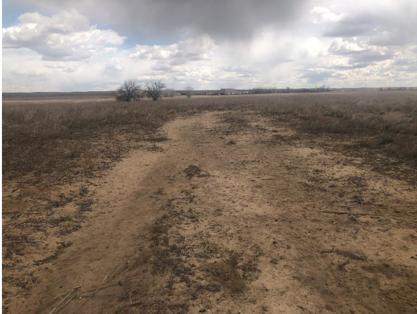
Bare ground in Area 37