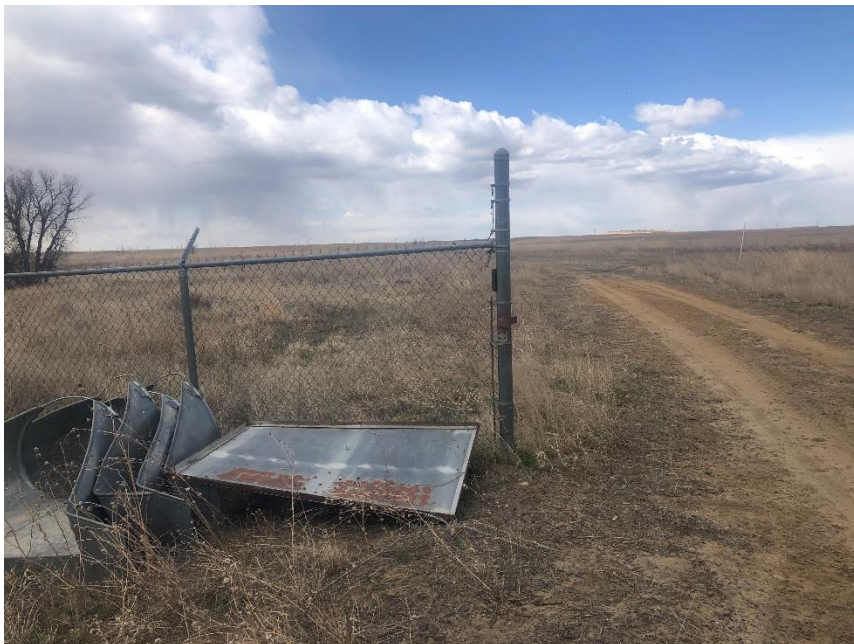
Entrance sign on ground

Number of Partial Inspection this Fiscal Year: 6