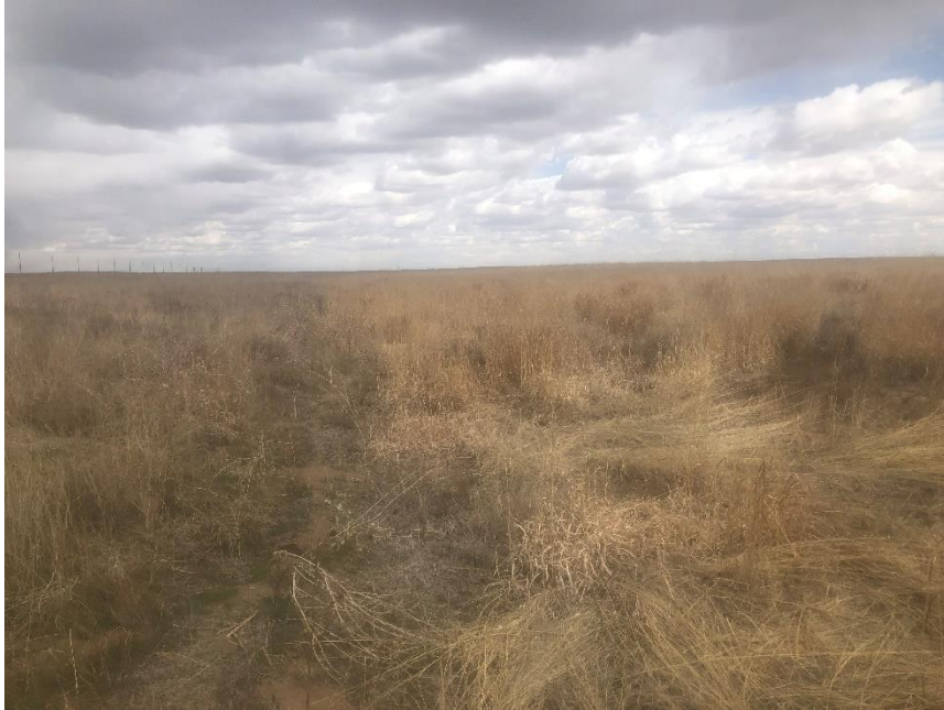
West side of disturbed area, with Area 31 on the right side of photo