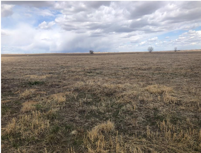
Area 25, looking northwest