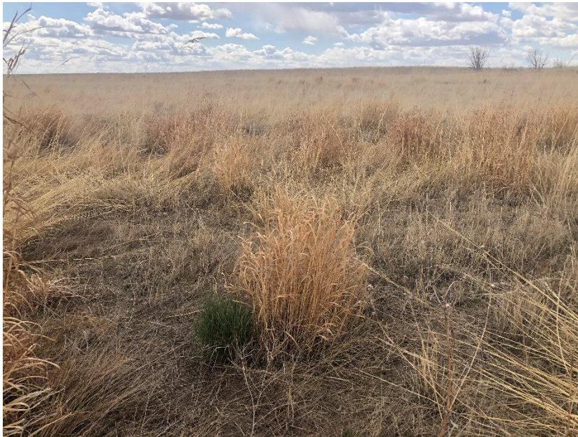
Emerging grass in Area 35

Number of Partial Inspection this Fiscal Year: 6