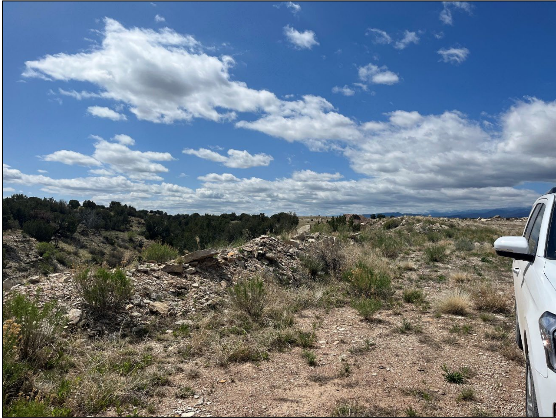
Photo 3: View south along the edge of disturbance and towards the access road.