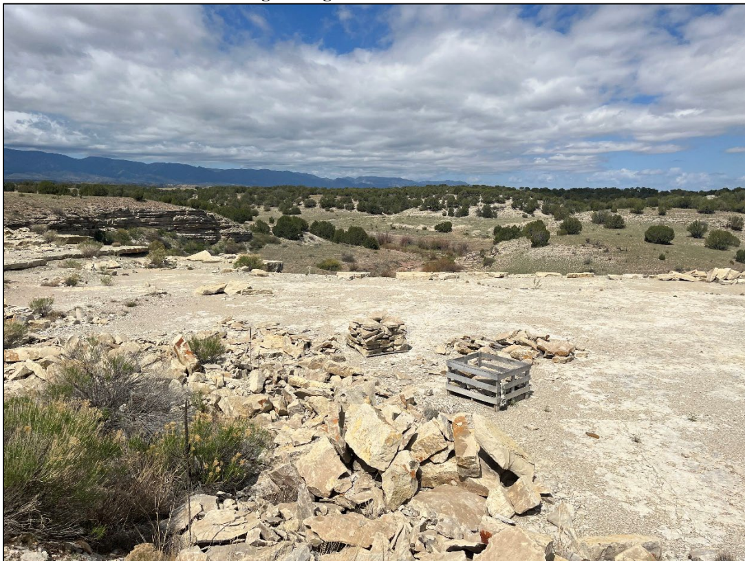
Photo 4: View west of the actively mined area. Red Creek Canyon is just below this limestone outcrop.