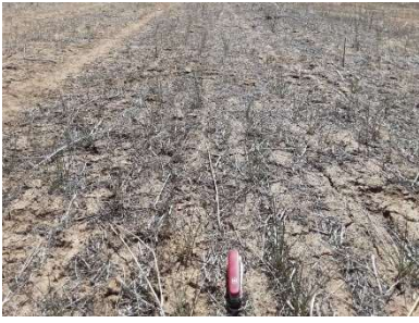
Fall 2023 overseeded haul road showing early signs of significant vegetation improvement (photo 10).