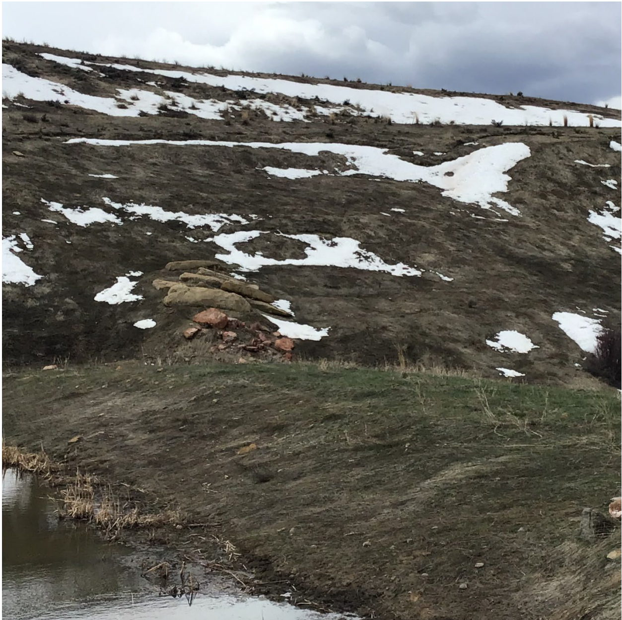
Photo 4: The crack below the haul road that expanded upslope in spring of 2023.

Number of Partial Inspection this Fiscal Year: 7