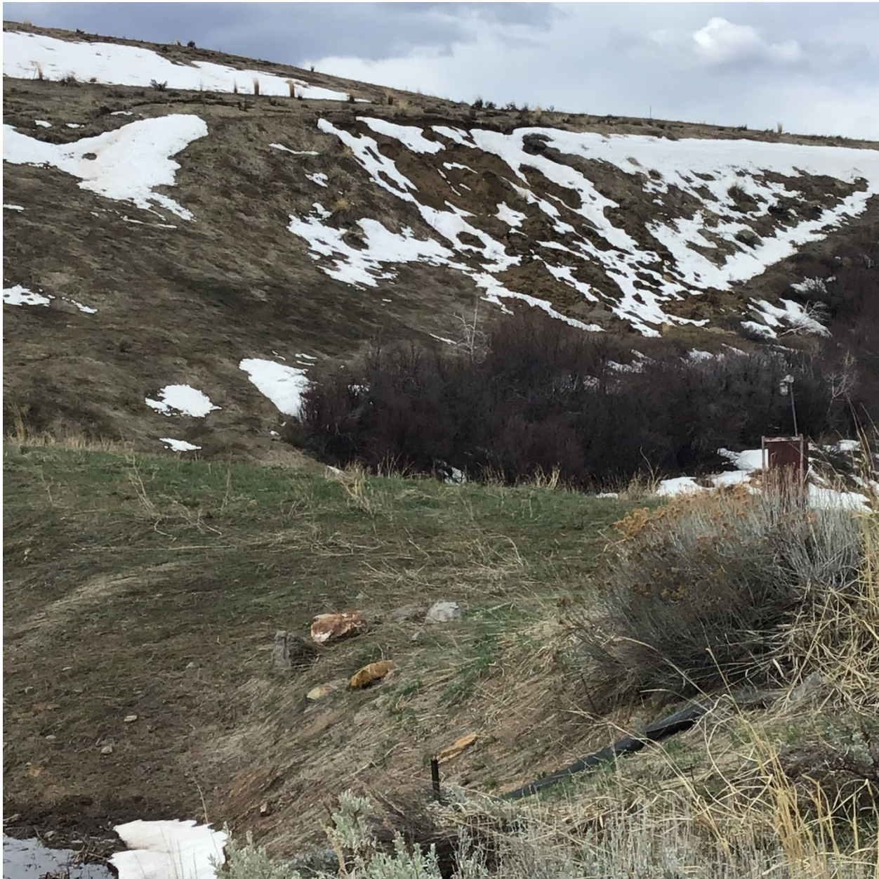
Photo 5: A crack below the haul road and the 2023 slide area above Pond 6.

Number of Partial Inspection this Fiscal Year: 7