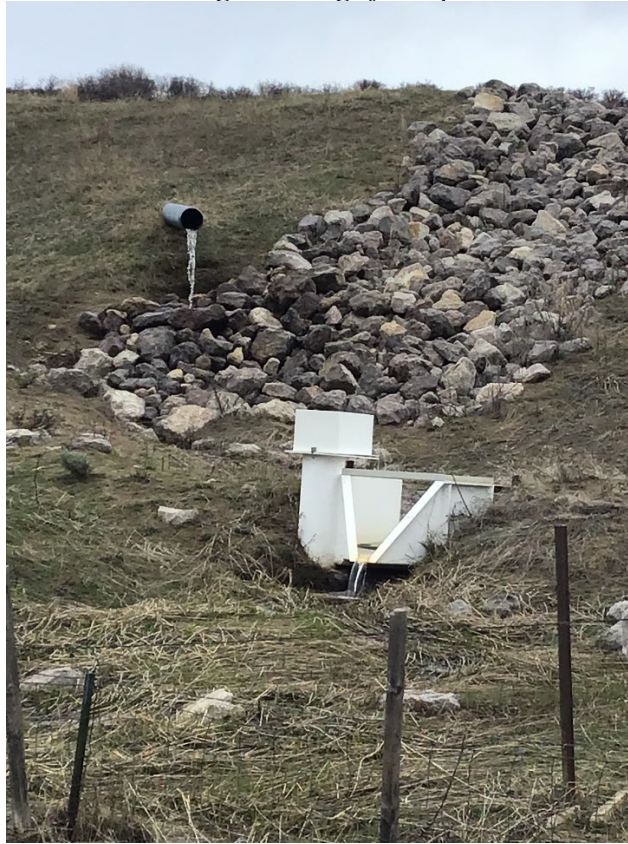
Photo 3: Pond 13 decant culvert and weir. showing discharge from pond.