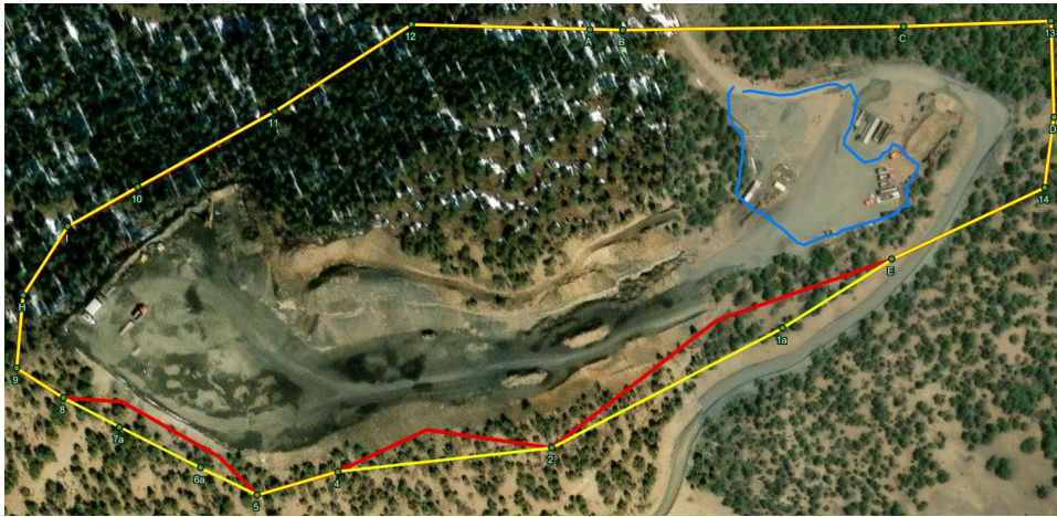
Photo 8: Figure indicating the approximate location of the newly proposed boundary (yellow polygon), the currently approved boundary (red polygon), and the 'test-plot' area that had been recently seeded at the time of the inspection (blue polygon).