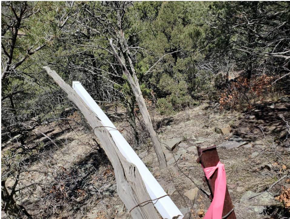
Photo 14: Looking east along the northern fence from the north-western corner boundary marker on the fence line.