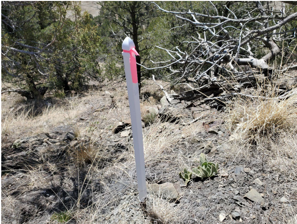
Photo 12: Original permit boundary marker t-post with white fence covering and pink ribbon.