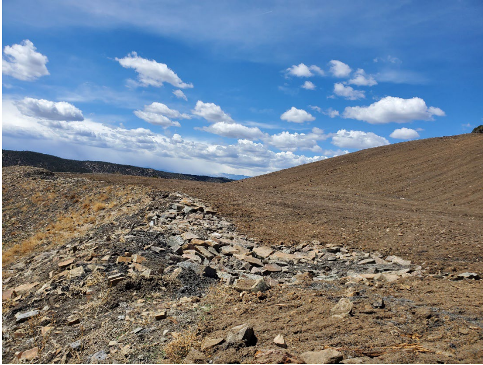
Photo 1: Looking east at an armored drainage along the southern side of the mined area.