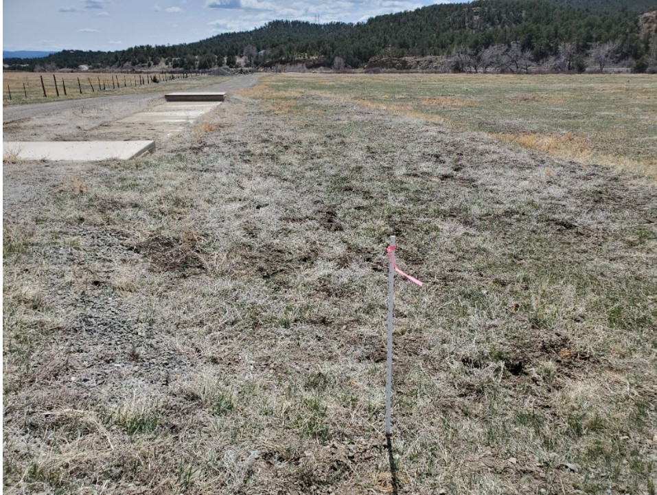
Photo 11: White marker pole with pink ribbon alongside the proposed 'road area'.