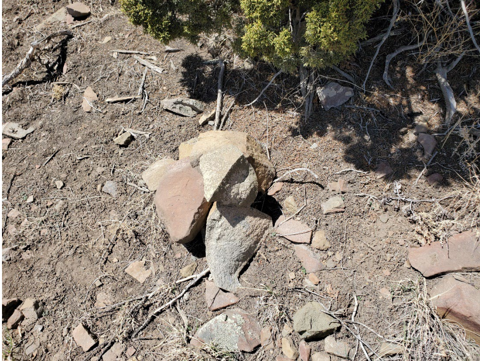
Photo 13: Rock monument indicating a new proposed boundary marker location.