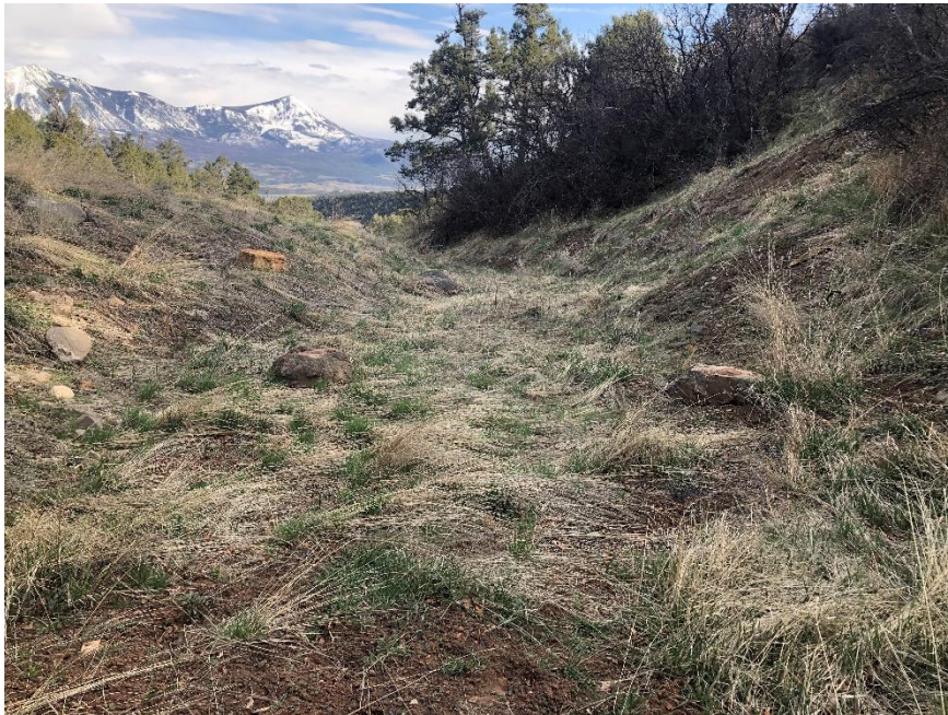
Pond 3, looking down the drainage at reclaimed pond

Number of Partial Inspection this Fiscal Year: 6