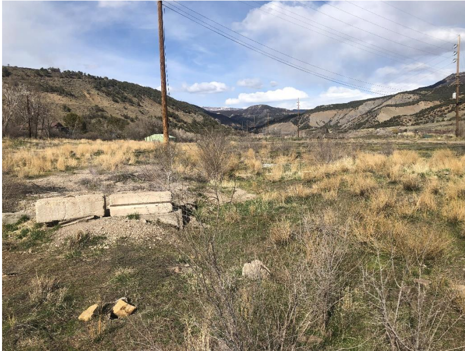
West side of loadout