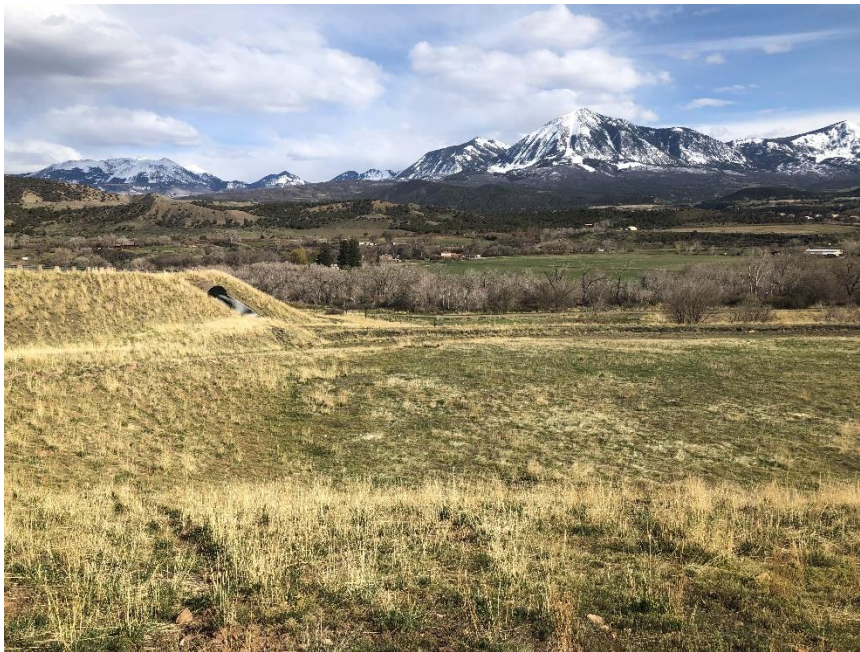
Coal storage by Black Bridge Road, looking south towards pond

Number of Partial Inspection this Fiscal Year: 6