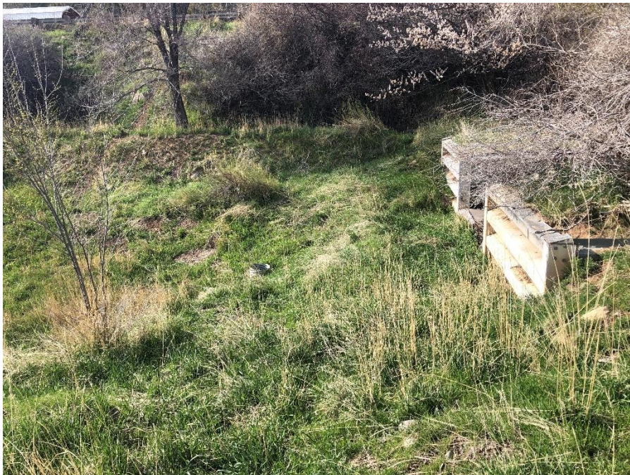
Pond at loadout

Number of Partial Inspection this Fiscal Year: 6