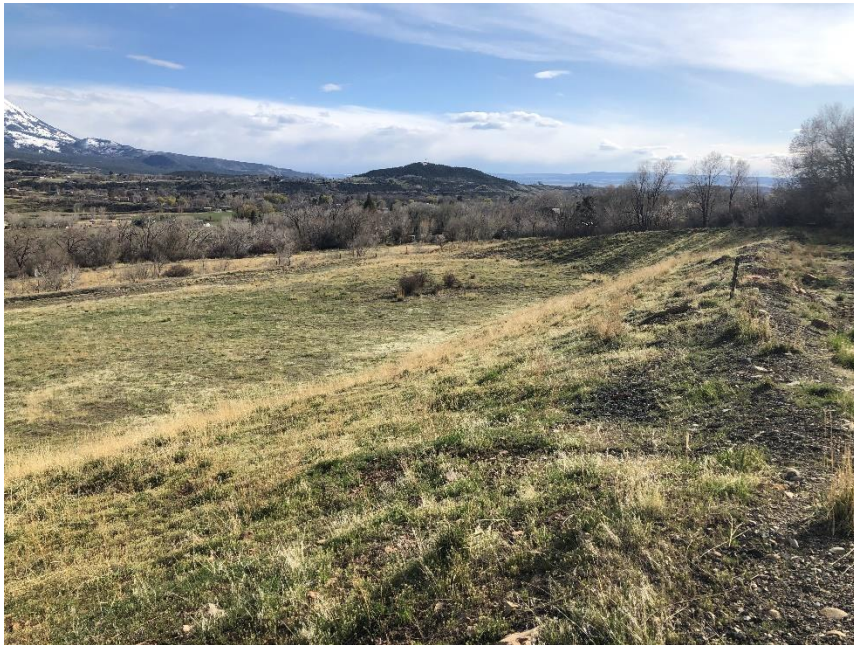
Coal storage by Black Bridge Road, looking west