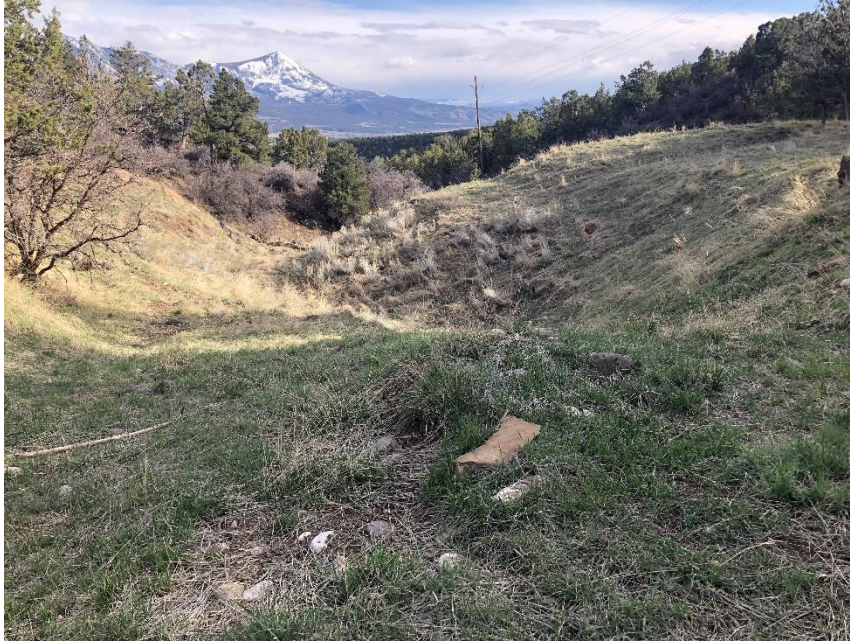
Pond 4, looking down the drainage at reclaimed pond