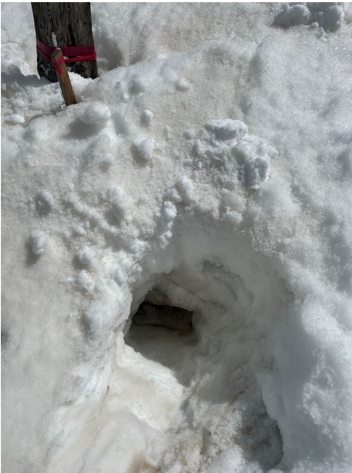
Photograph 2: View of the GV-06 surface water monitoring location after removal of snow. Photo taken 4/10/2024 at approximately 15:15 MDT.