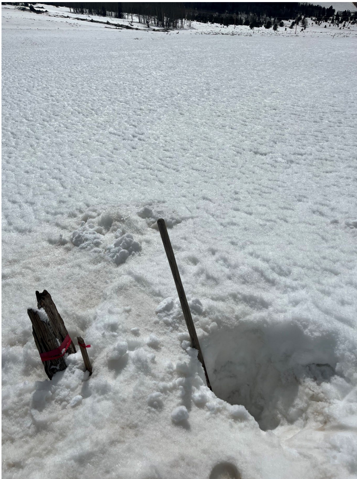
Photograph 4: View of the GV-06 surface water monitoring location showing the depth of snow. Photo taken 4/10/2024 at approximately 15:15 MDT.