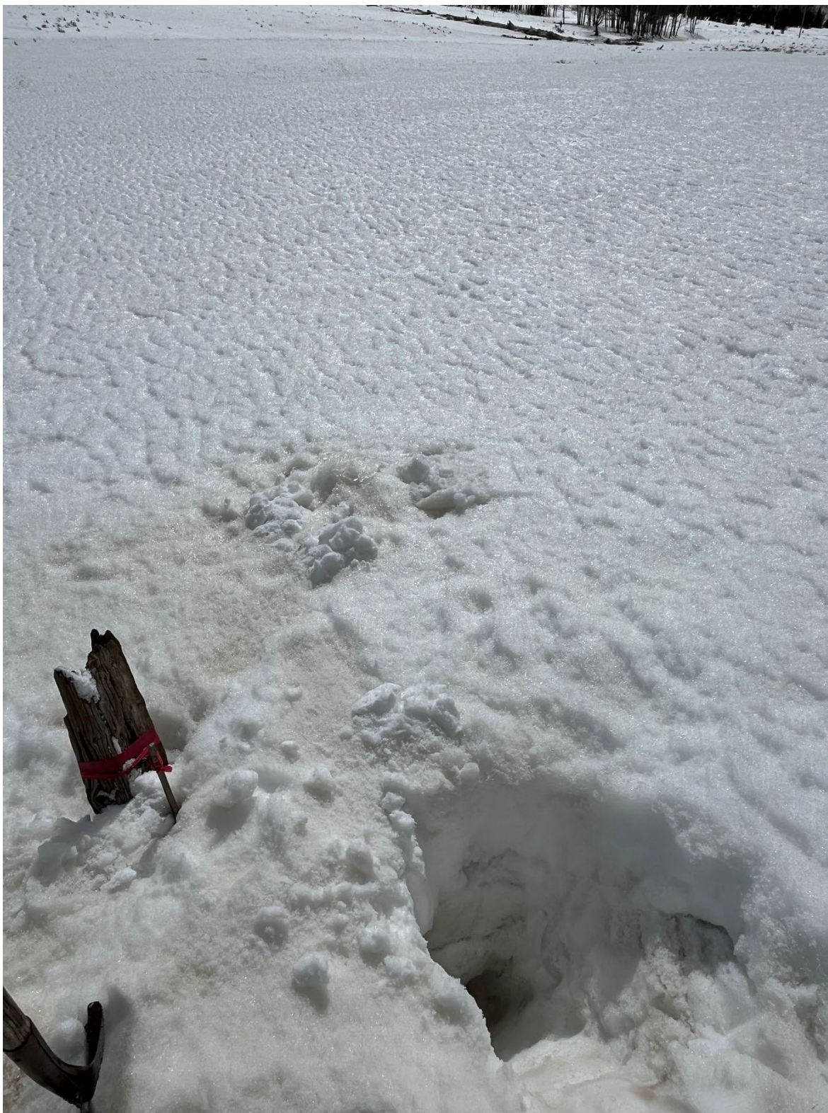
Photograph 1: View of the GV-06 surface water monitoring location, looking southwest. Photo taken 4/10/2024 at approximately 15:15 MDT.