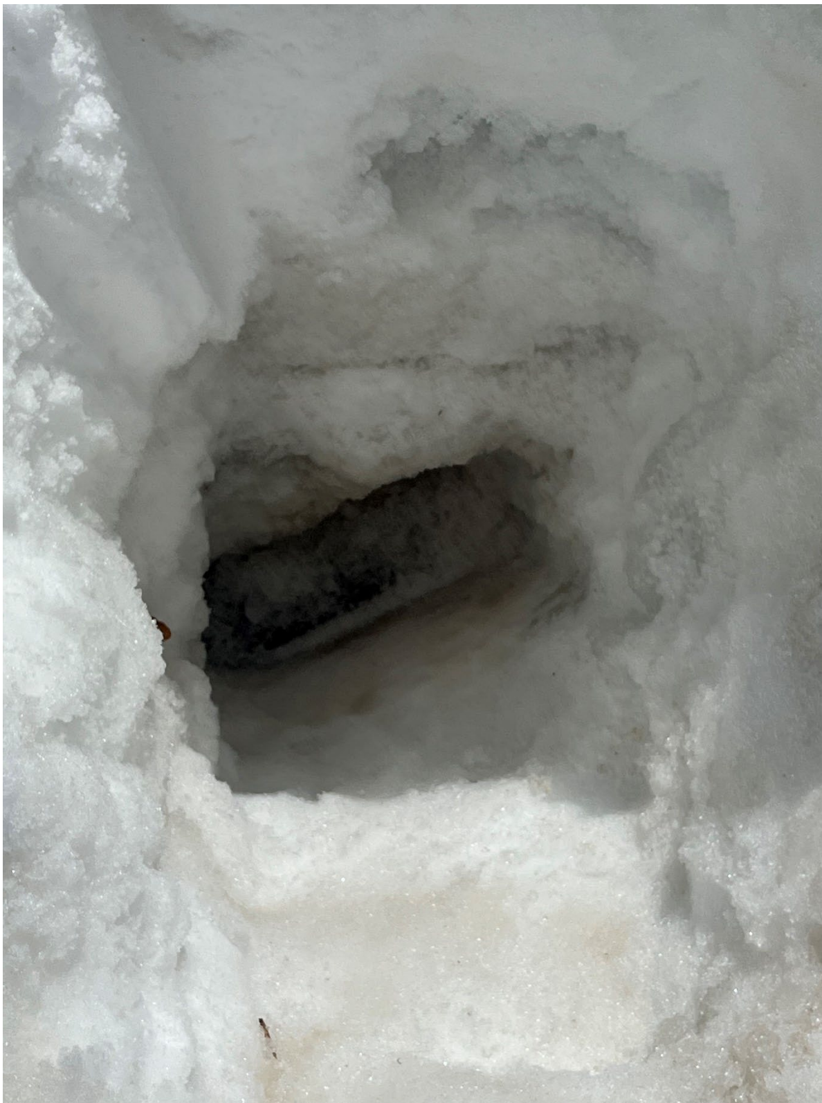
Photograph 3: View of the GV-06 surface water monitoring location after snow and ice was removed. No flowing water was observed at the location. Photo taken 4/10/2024 at approximately 15:15 MDT.