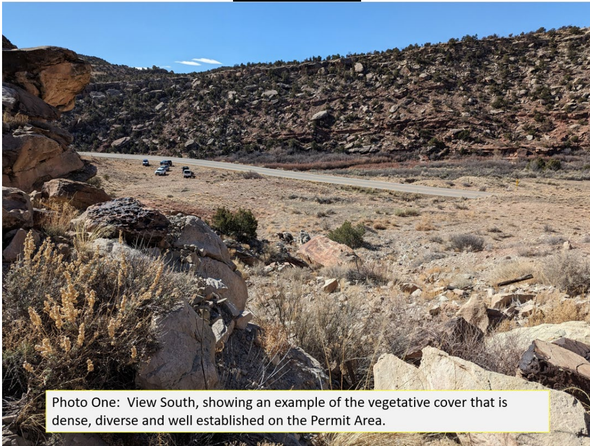
Photo One: View South, showing an example of the vegetative cover that is dense, diverse and well established on the Permit Area.