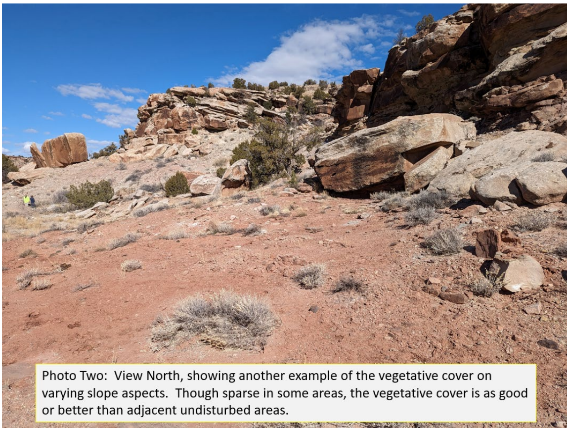
Photo Two: View North, showing another example of the vegetative cover on varying slope aspects. Though sparse in some areas, the vegetative cover is as good or better than adjacent undisturbed areas.