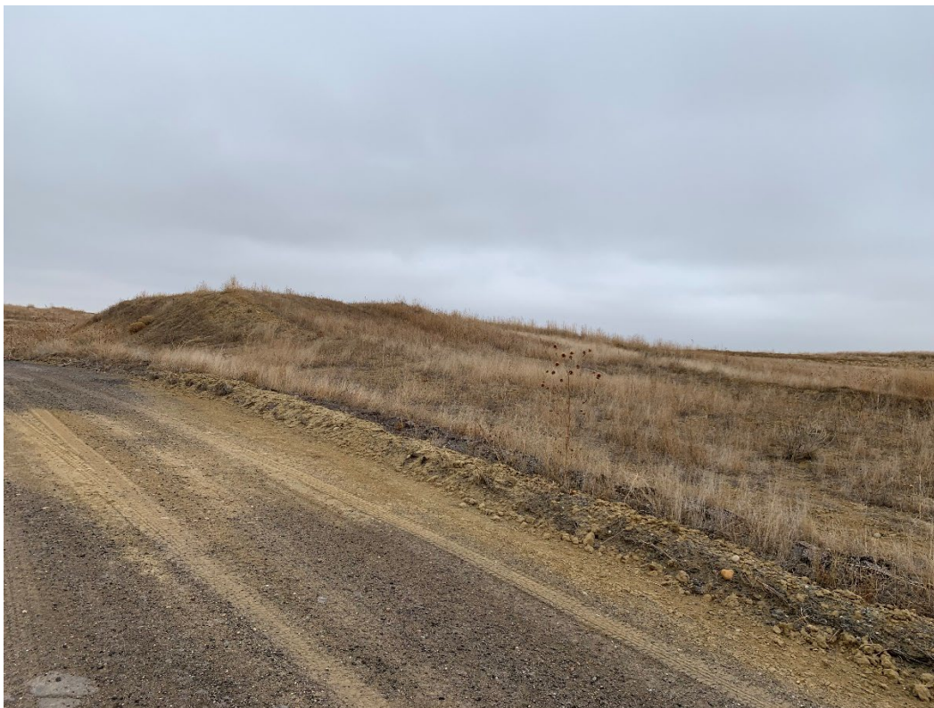
Photo 4 – Topsoil stockpile along the norther access road, facing east.