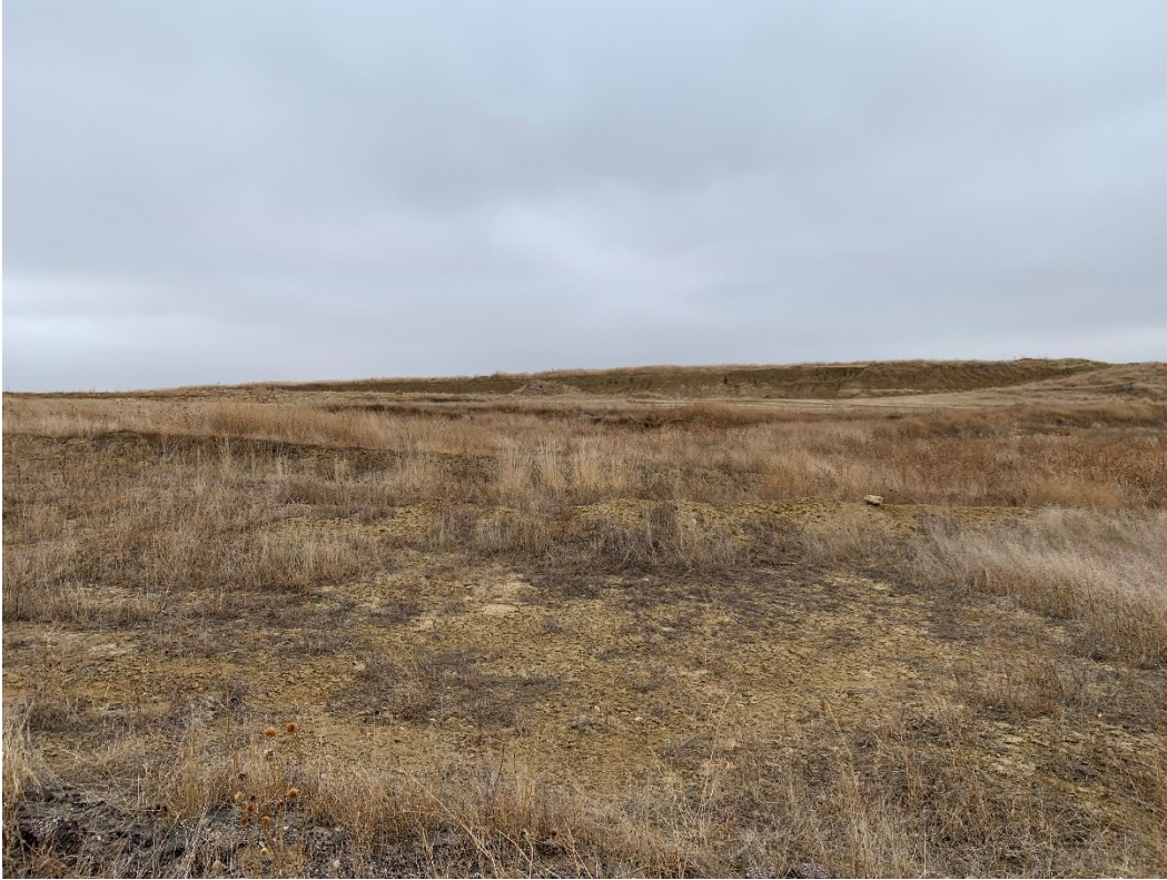
Photo 1 – View of highwall from north permit boundary, facing south.