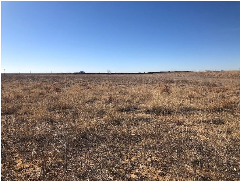
Area 34 (southwest corner of site), looking south

Number of Partial Inspection this Fiscal Year: 5