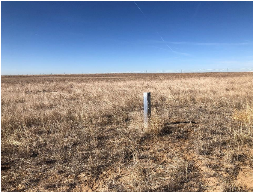
Southwest corner of Area 37, with monitoring well

Number of Partial Inspection this Fiscal Year: 5