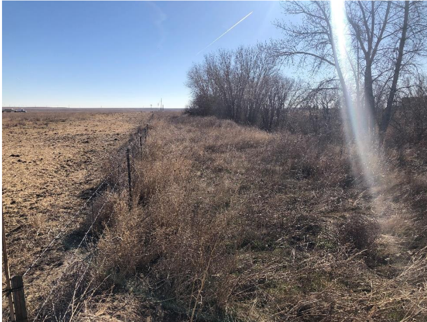
Sediment Pond 2 embankment