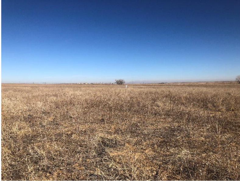
East side of Area 36 (note weather station in center of photo)