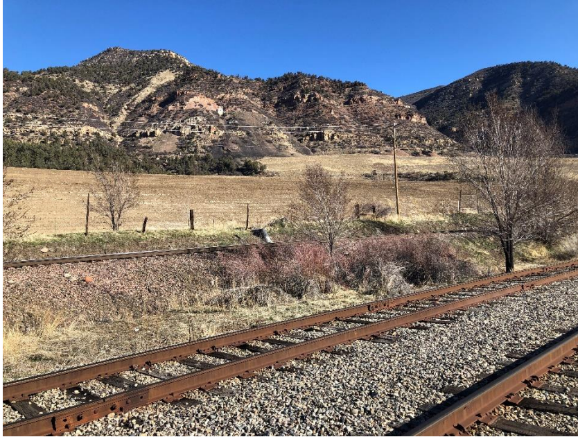
Lower slope of Gob Pile #3 (east end), center of photo