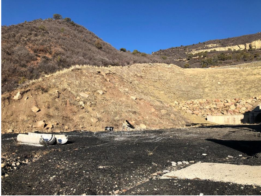
Slide at B Portal bench