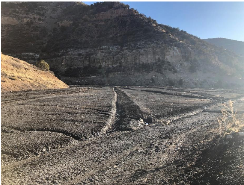
Gob Pile #2, upper portion

Number of Partial Inspection this Fiscal Year: 5