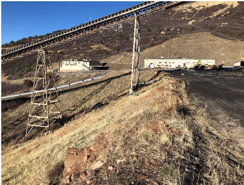
Slope below D Portal bench

Number of Partial Inspection this Fiscal Year: 5