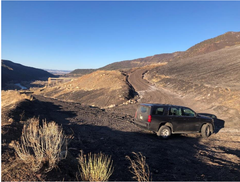
Gob Pile #2, middle portion