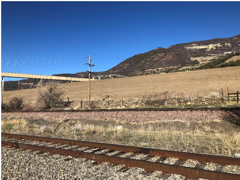
Lower slope of Gob Pile #3 (west end), center of photo

Number of Partial Inspection this Fiscal Year: 5