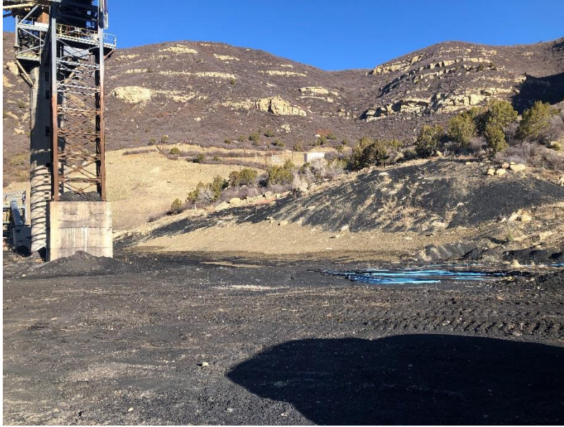
Slope above D Portal bench