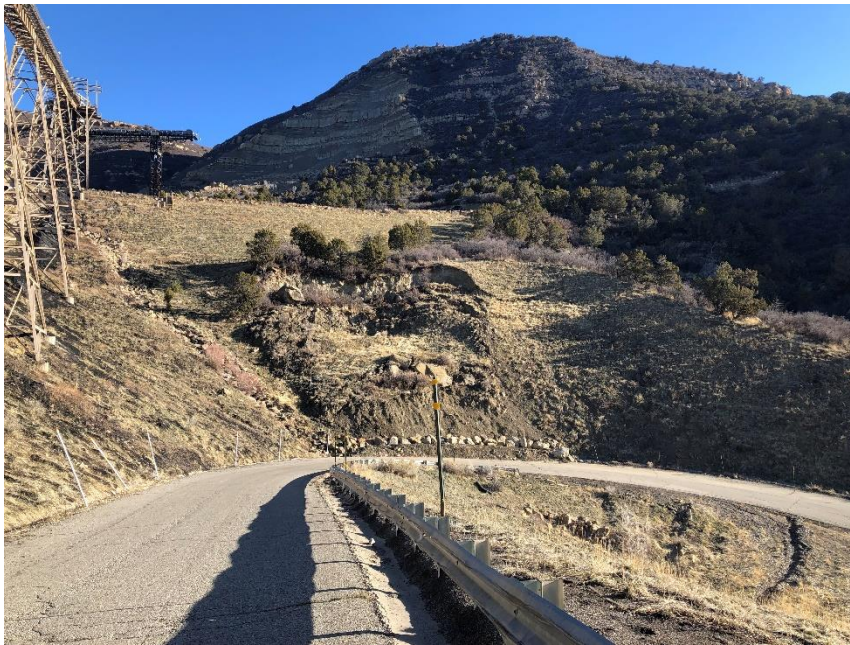
Slide at Curve 10

Number of Partial Inspection this Fiscal Year: 5