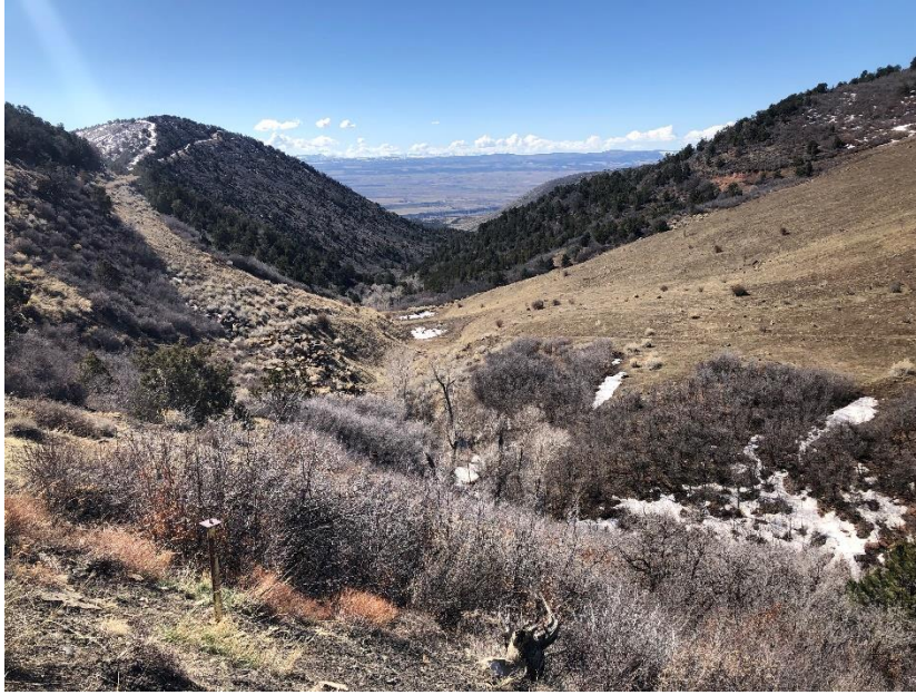
Ponds at West Mine