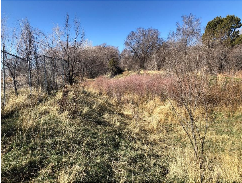
Loadout pond, looking west