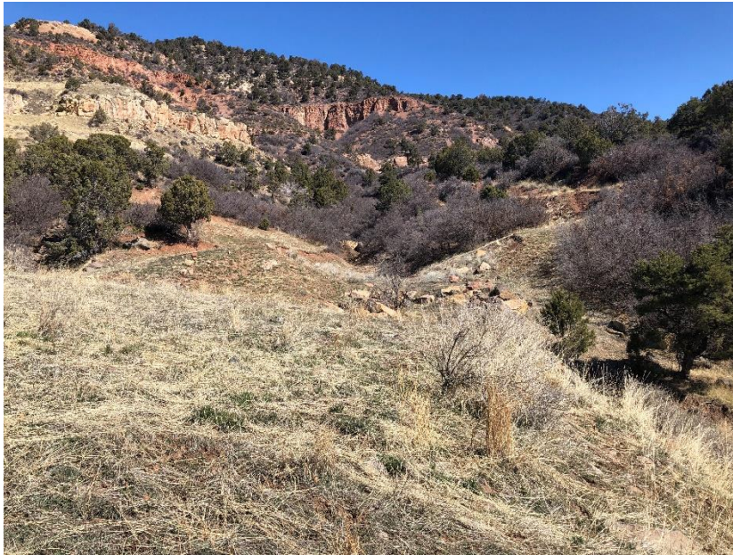
Reclaimed ponds at East Mine

Number of Partial Inspection this Fiscal Year: 5