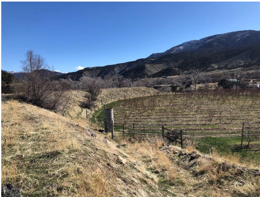
Slope below loadout, looking toward trestle

Number of Partial Inspection this Fiscal Year: 5