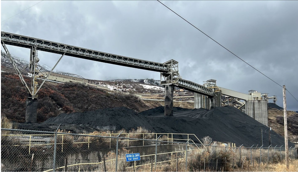
Figure 6: Clean coal stockpile, with silos in background

Number of Partial Inspection this Fiscal Year: 7