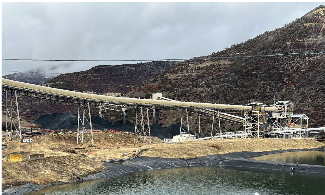
Figure 5: Run-of-mine coal stockpile, with fines at western end (left of frame)

Number of Partial Inspection this Fiscal Year: 7