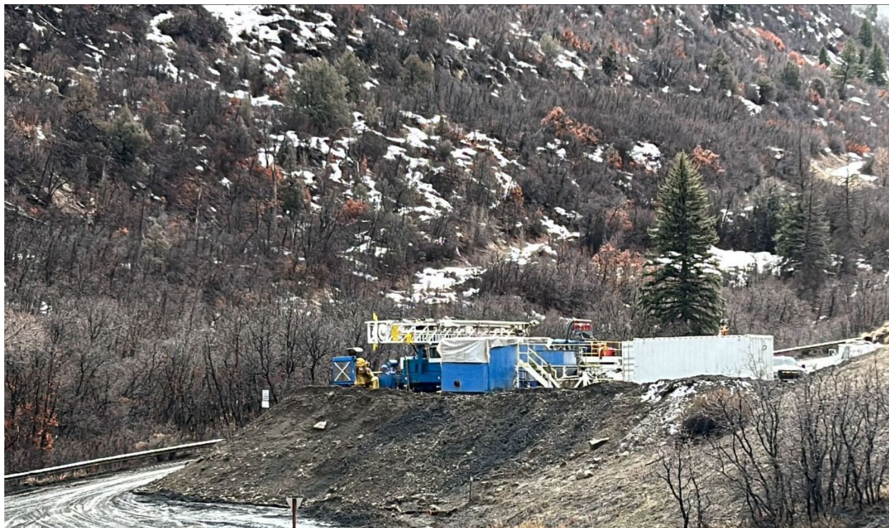
Figure 4: Work ongoing at Box Canyon North well