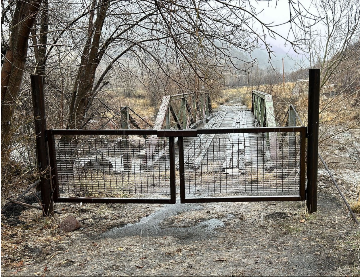
Figure 2: Site access

Number of Partial Inspection this Fiscal Year: 1