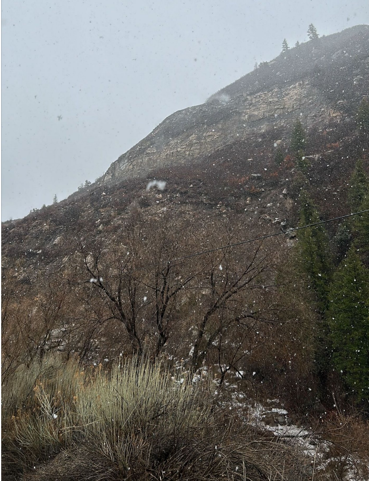
Figure 1: Overview of slide area

Number of Partial Inspection this Fiscal Year: 1