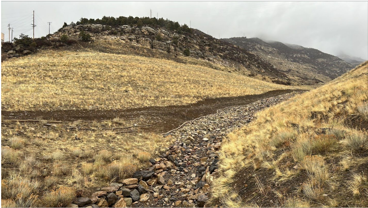
Figure 1: Lower section of reclaimed Elk Creek channel

Number of Partial Inspection this Fiscal Year: 6