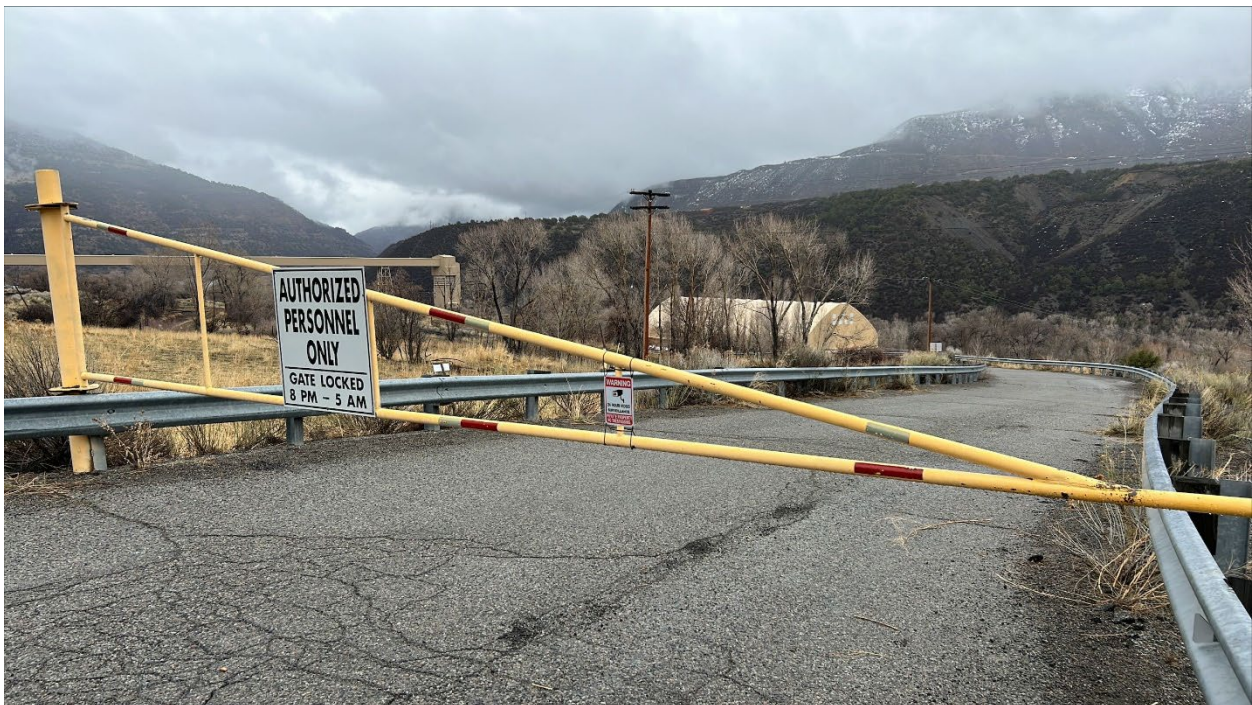
Figure 2: Entrance to site

Number of Partial Inspection this Fiscal Year: 6