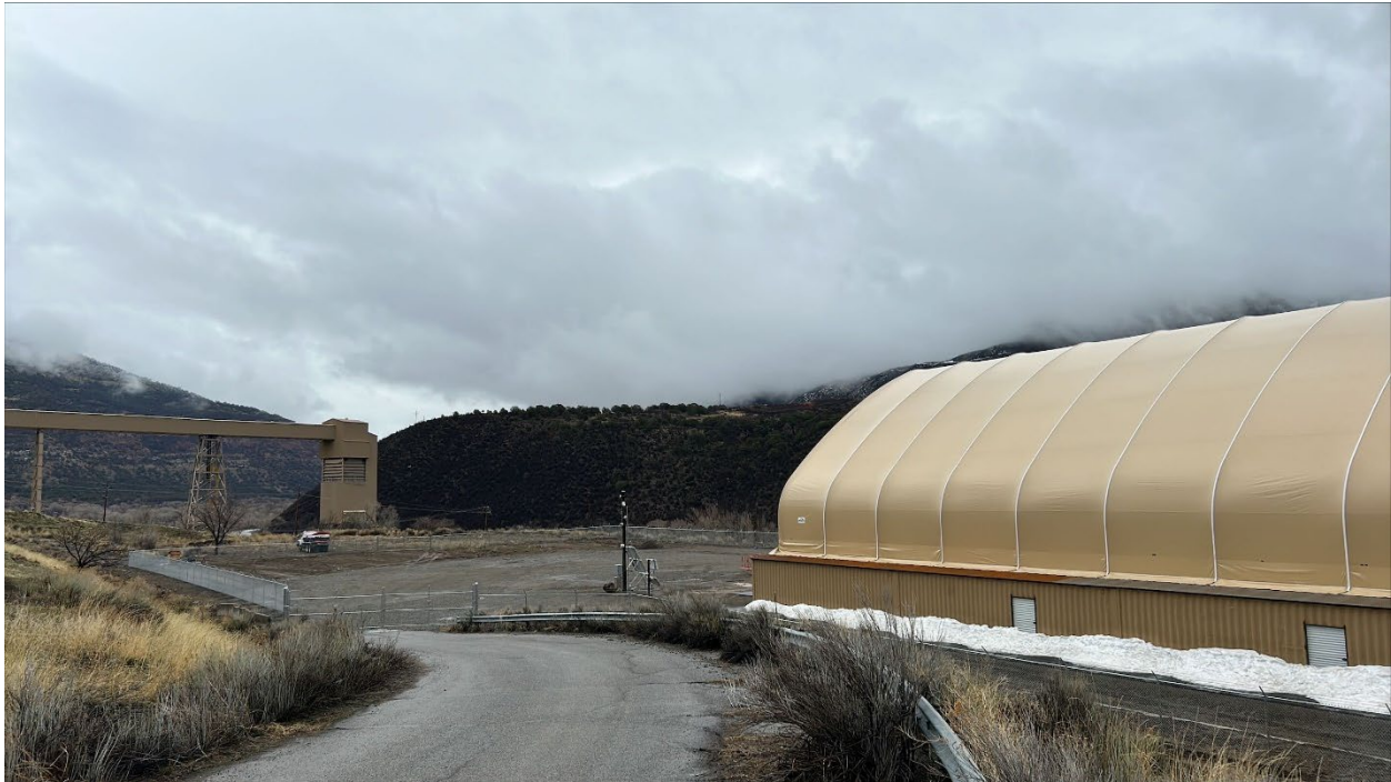
Figure 3: Security fence and gate around lower pad