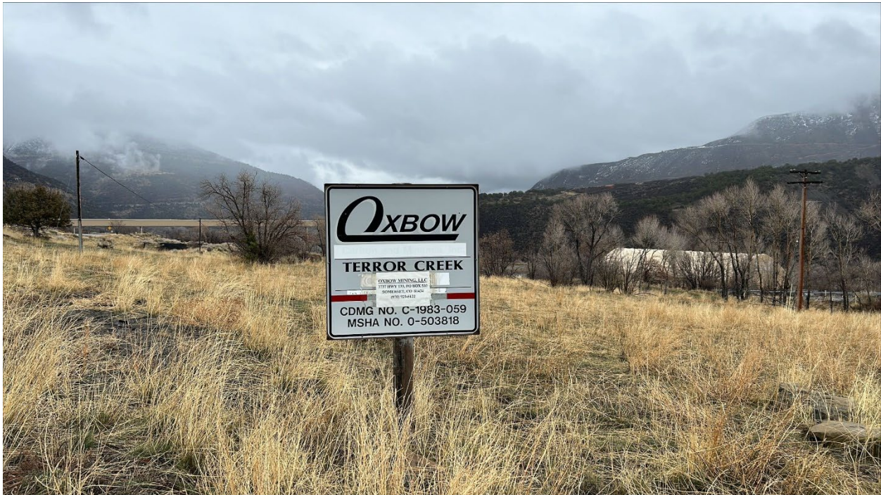
Figure 1: Mine ID sign