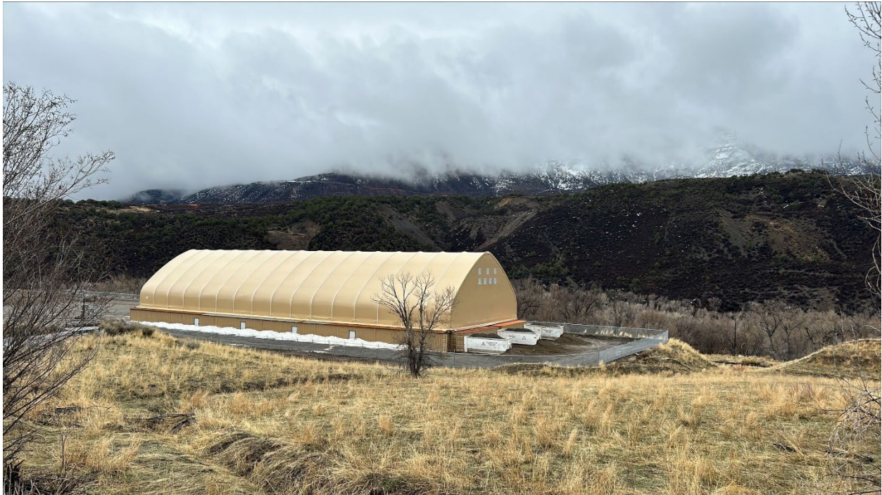
Figure 5: Western end of lower pad