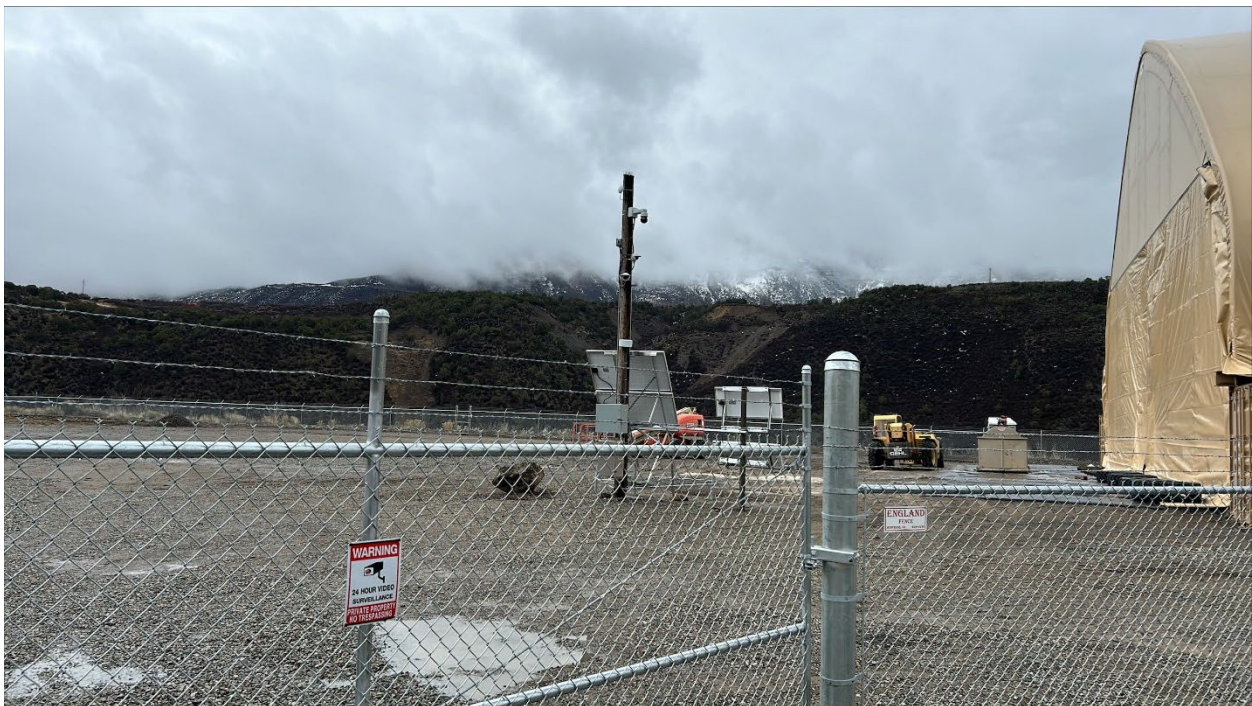
Figure 4: Gate, warning sign and security cameras

Number of Partial Inspection this Fiscal Year: 6