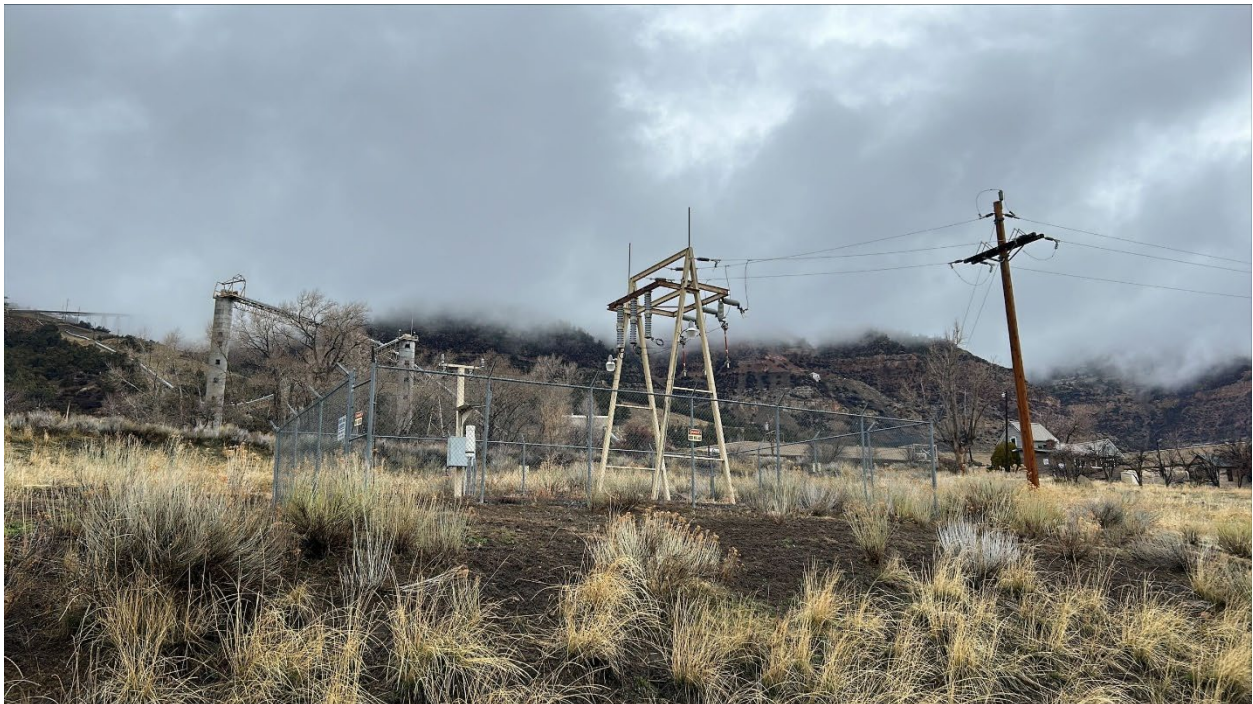
Figure 6: Remaining part of substation

Number of Partial Inspection this Fiscal Year: 6