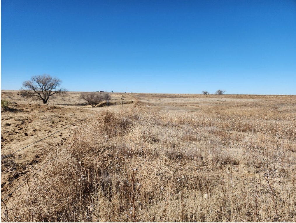
Photo 7. Fence marking the southern permit boundary looking west.