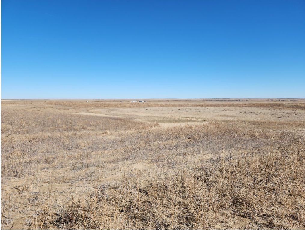
Photo 3. The mined pit in reclamation looking northeast.