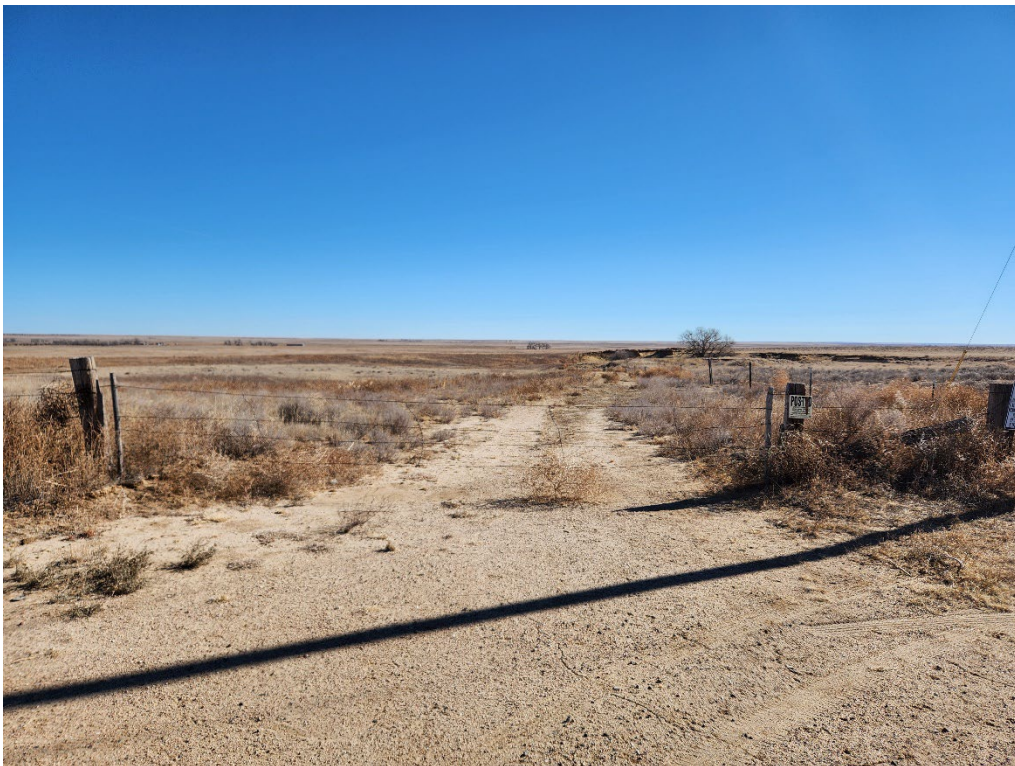
Photo 2. Mine entrance looking east.