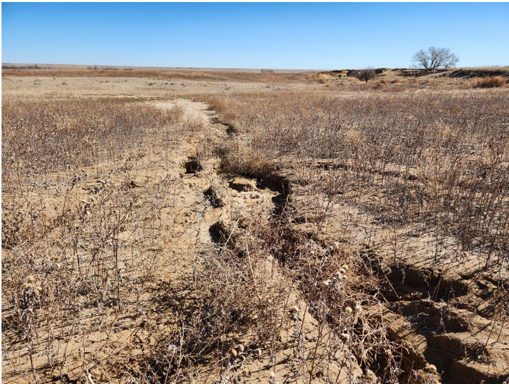
Photo 4. Erosion leading into the mine pit looking northeast.