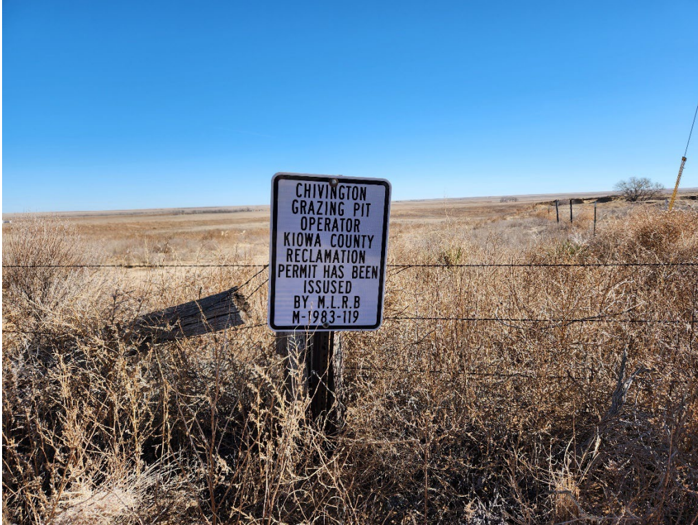
Photo 1. Mine entrance sign looking east.