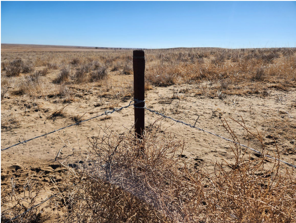
Photo 6. Fence post marking the southeast permit boundary corner looking southeast.