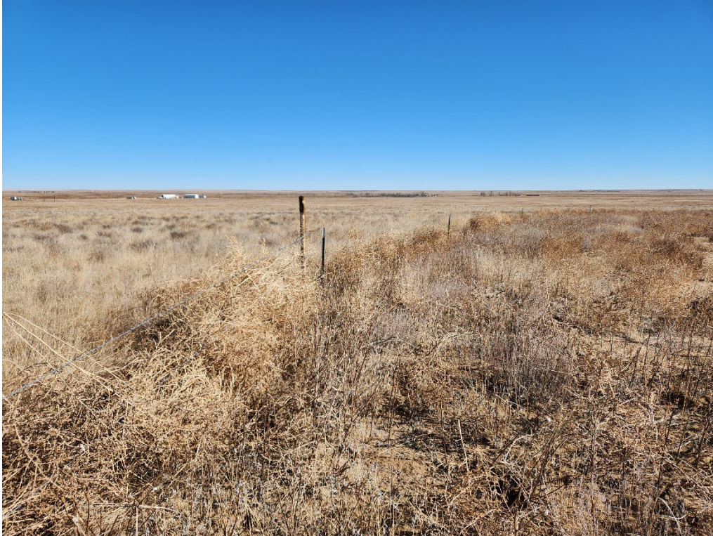
Photo 5. Fence marking the northern permit boundary looking east.