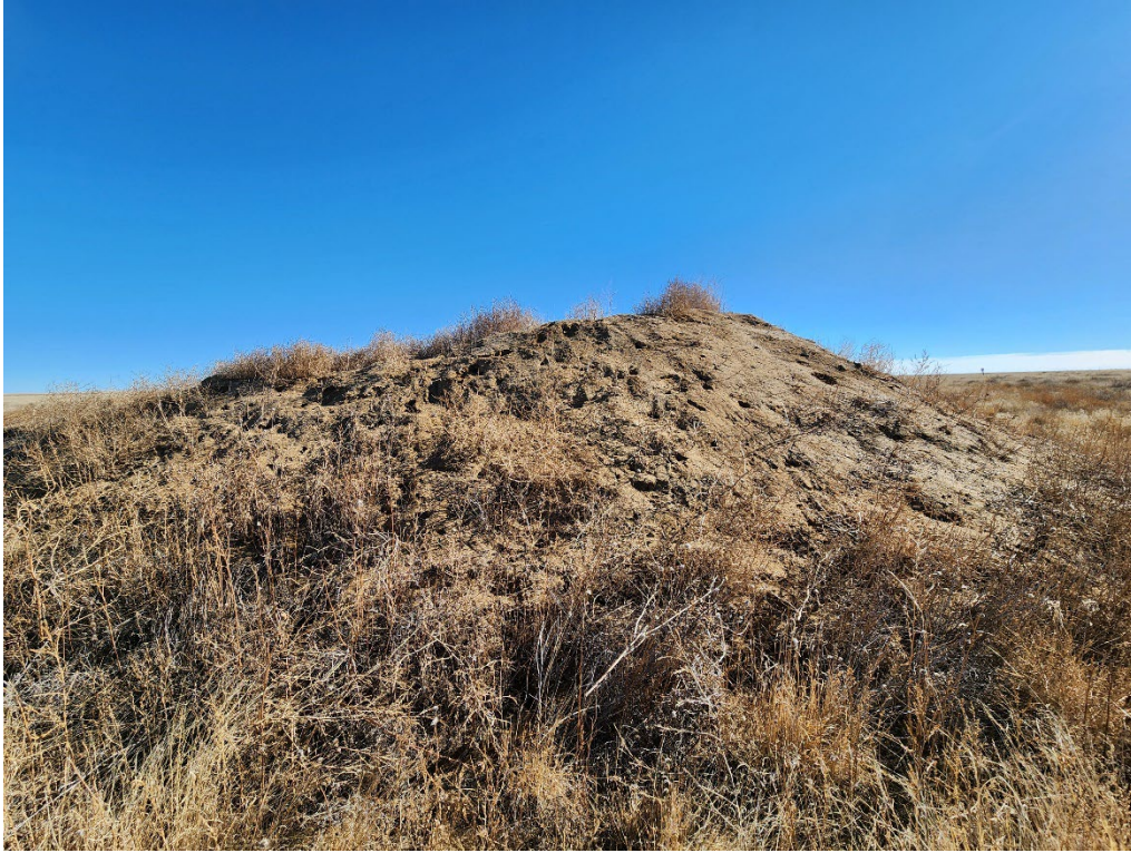
Photo 9. topsoil stockpile located in the north of the site.