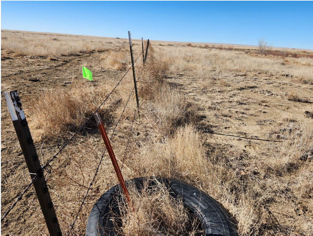
Photo 5. Permit boundary marker along the western edge of the site looking north.