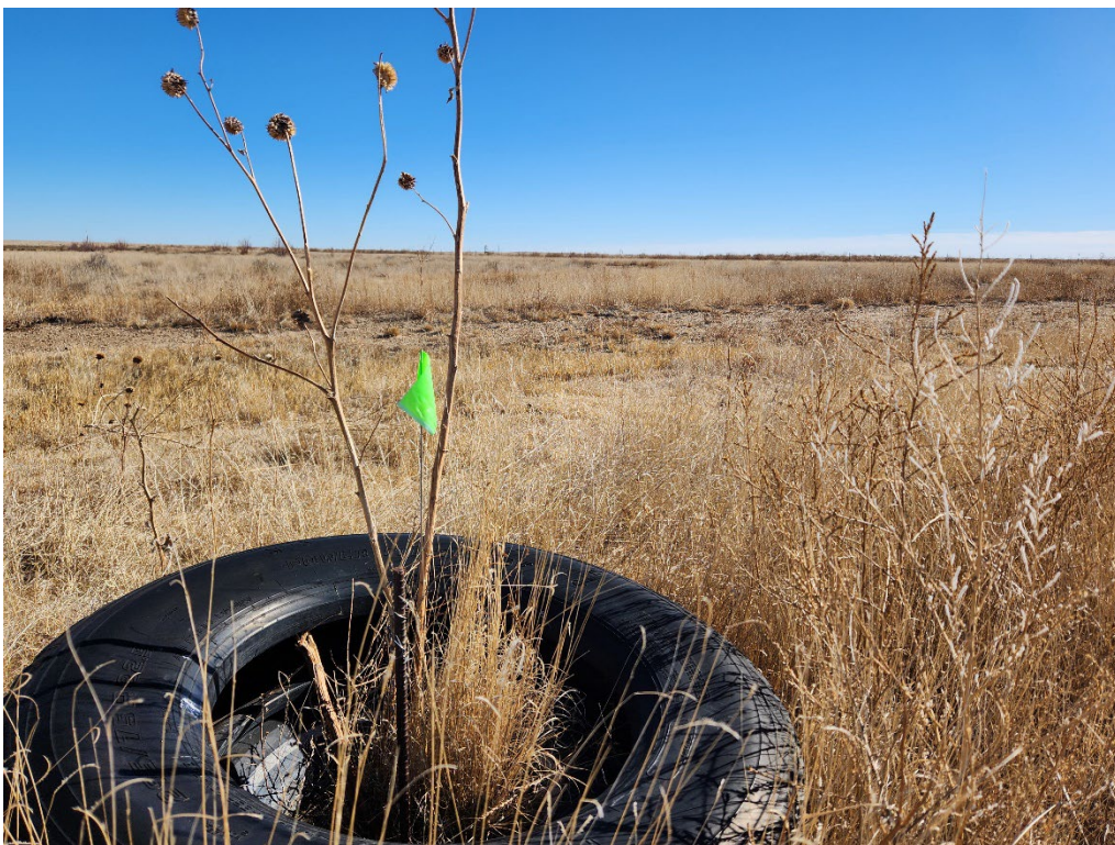
Photo 6. Permit boundary marker in northwest corner of the site looking north.