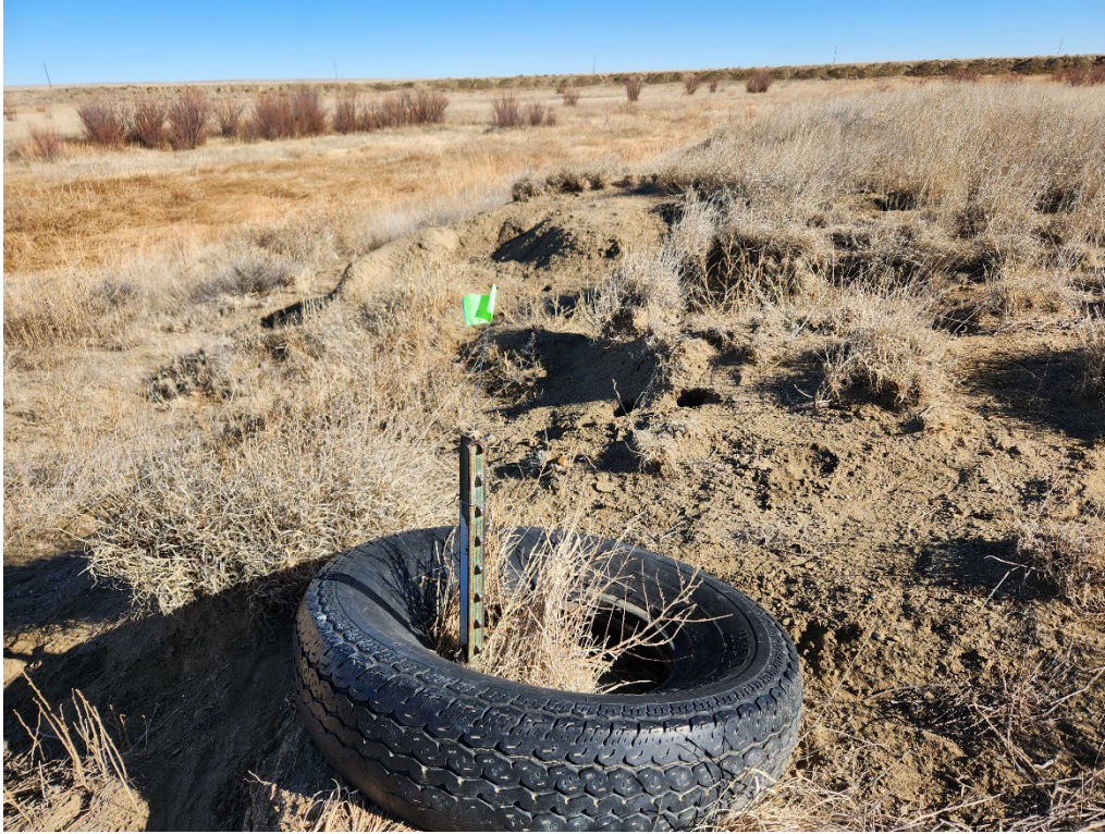
Photo 7. Permit boundary marker in north of site looking north.