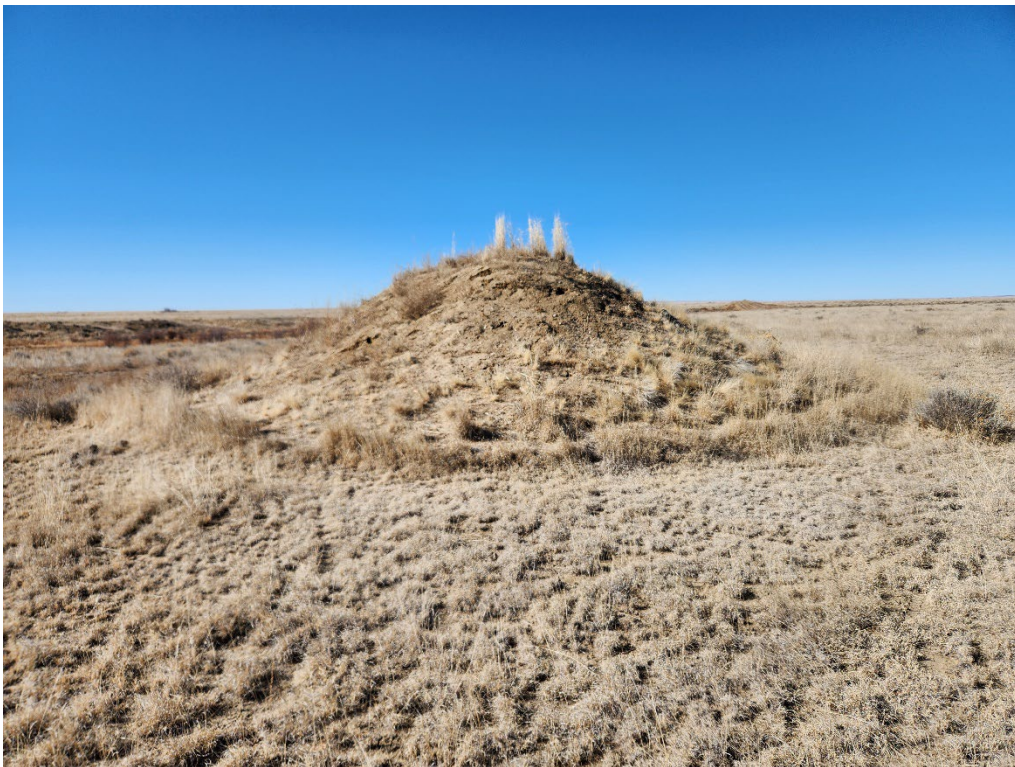
Photo 8. Topsoil stockpile located south of the site looking north.