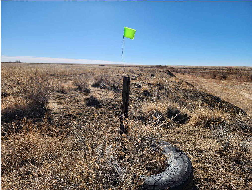
Photo 3. Permit boundary marker in the northeast corner looking west.