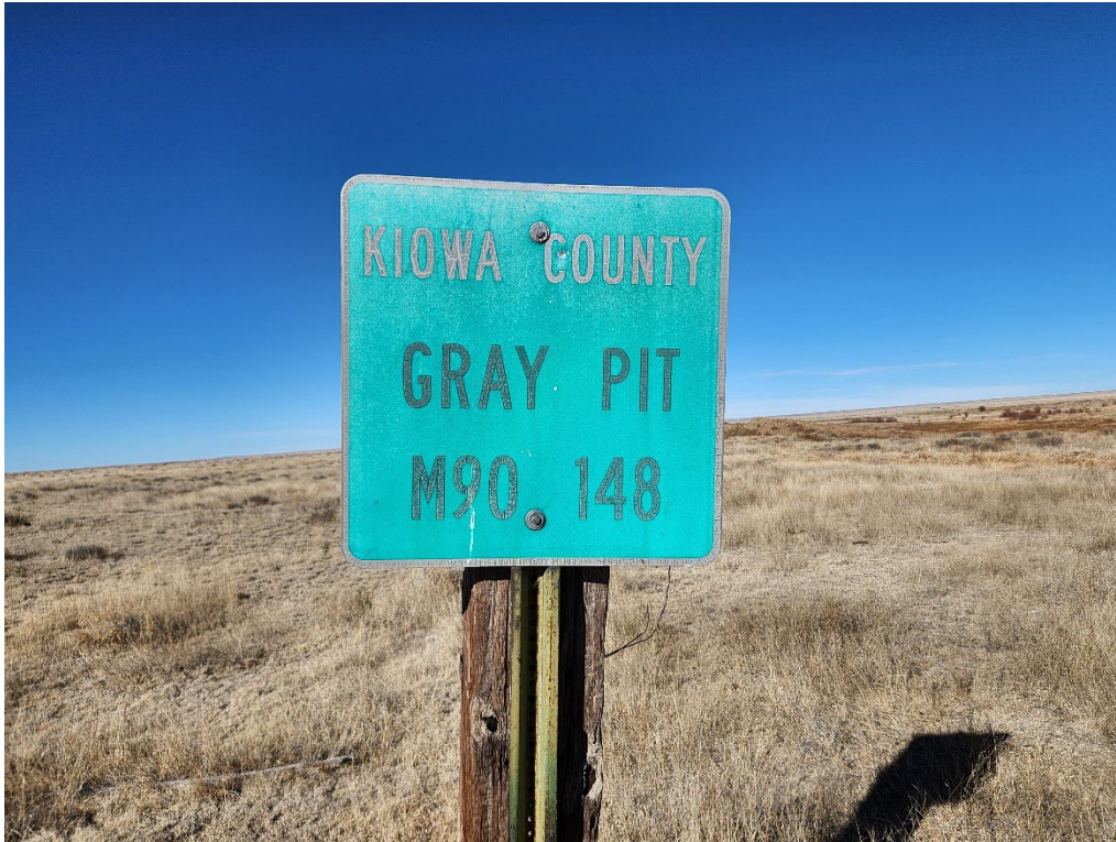
Photo 1. Mine entrance sign looking east.