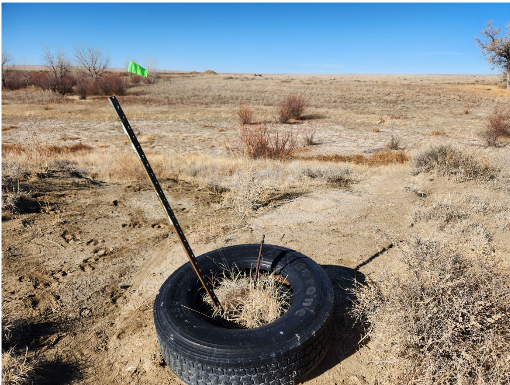
Photo 4. Permit boundary marker south of site looking north.