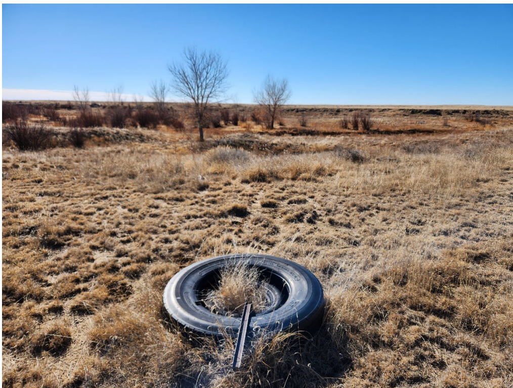
Photo 2. Permit boundary marker in the southwest corner looking north.