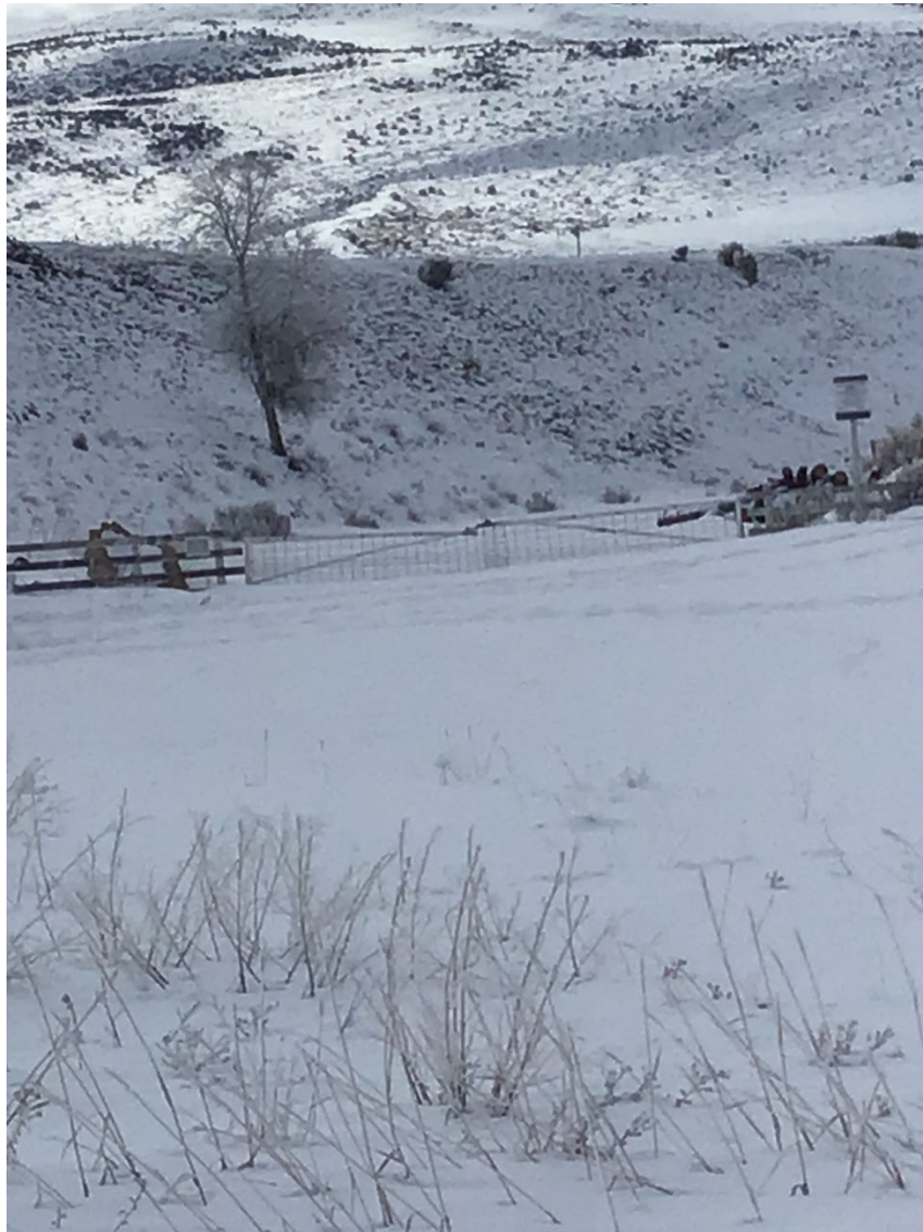
Photo 1: Mine identification sign at the site entrance off highway 13.

No enforcement actions were initiated as a result of this inspection, nor are any pending.