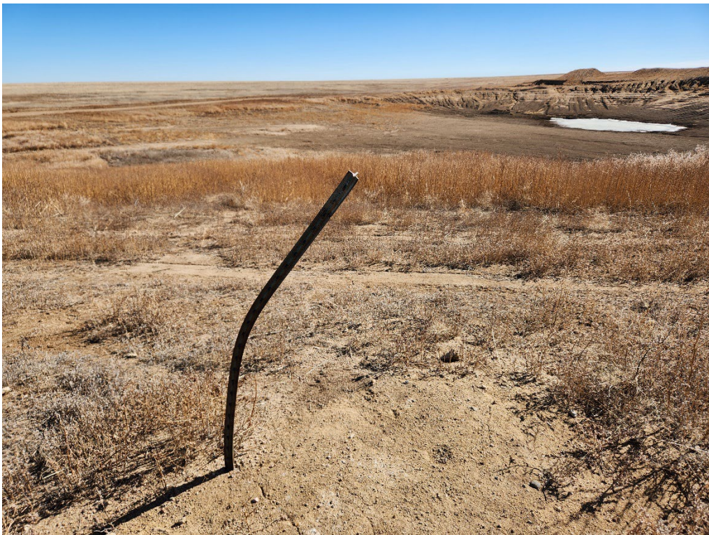
Photo 2. Permit boundary marker in the northwest corner of site looking south.