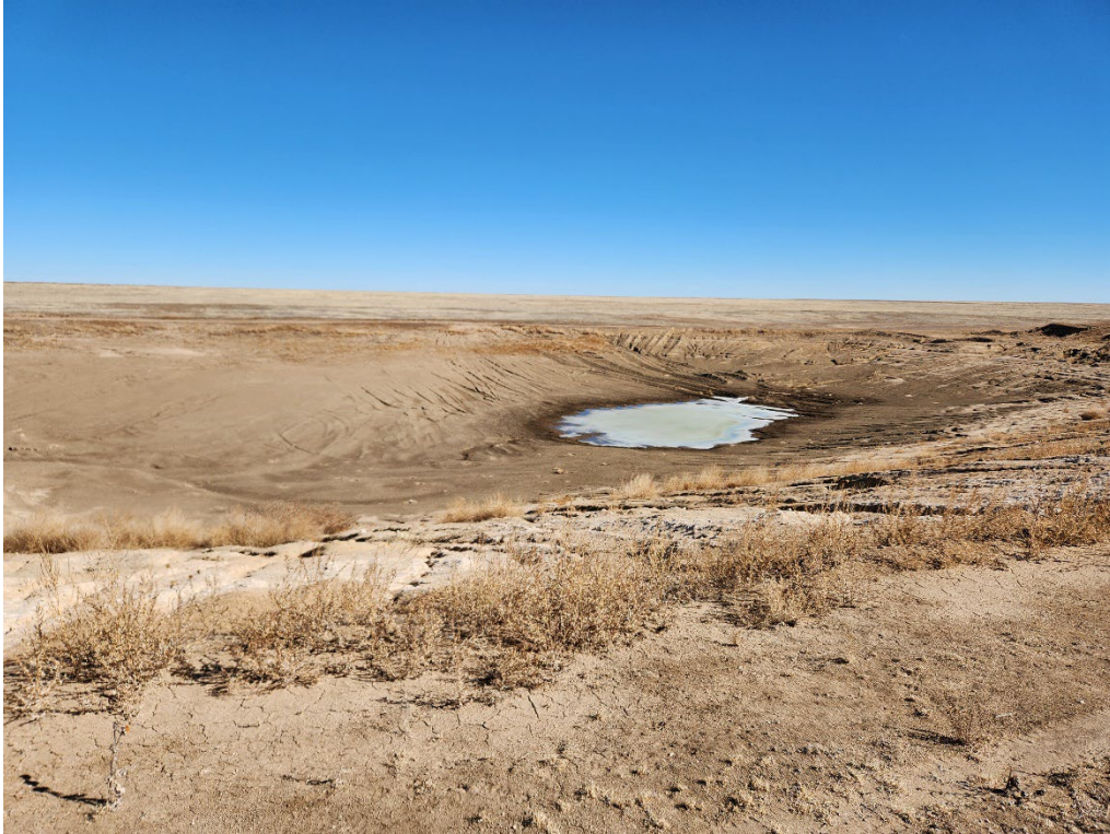
Photo 3. Mining pit looking south.