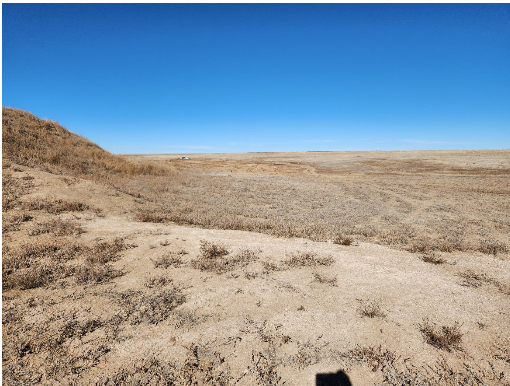
Photo 6. Eastern edge of the site looking north.