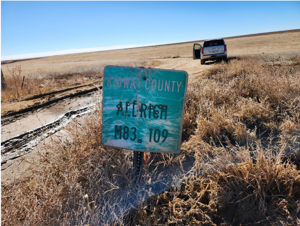
Photo 1. Mine entrance sign looking south.