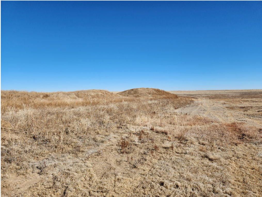
Photo 5. Topsoil stockpile along southern edge of permit boundary looking east.