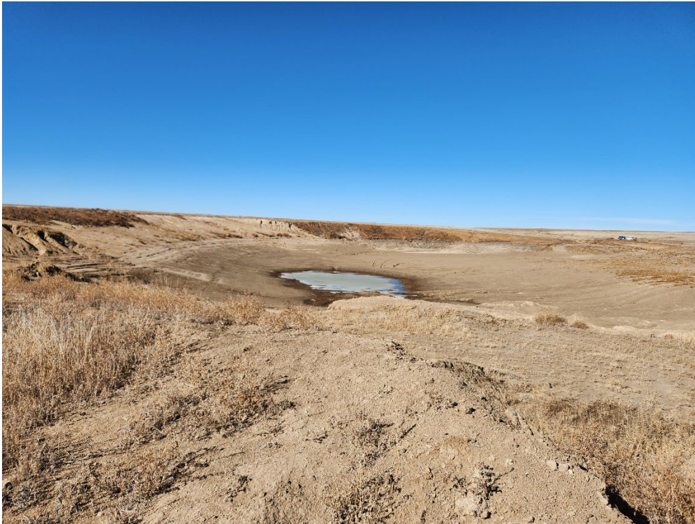
Photo 7. Mine pit from southern edge of the site looking north.