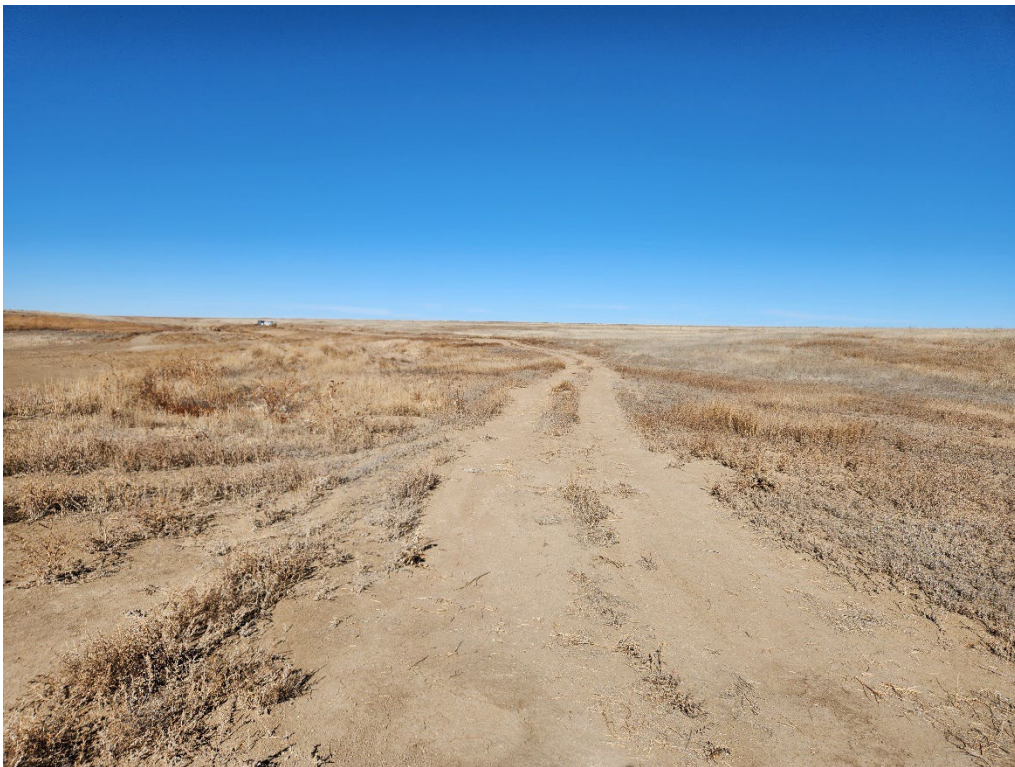
Photo 8. The access road into site looking north.