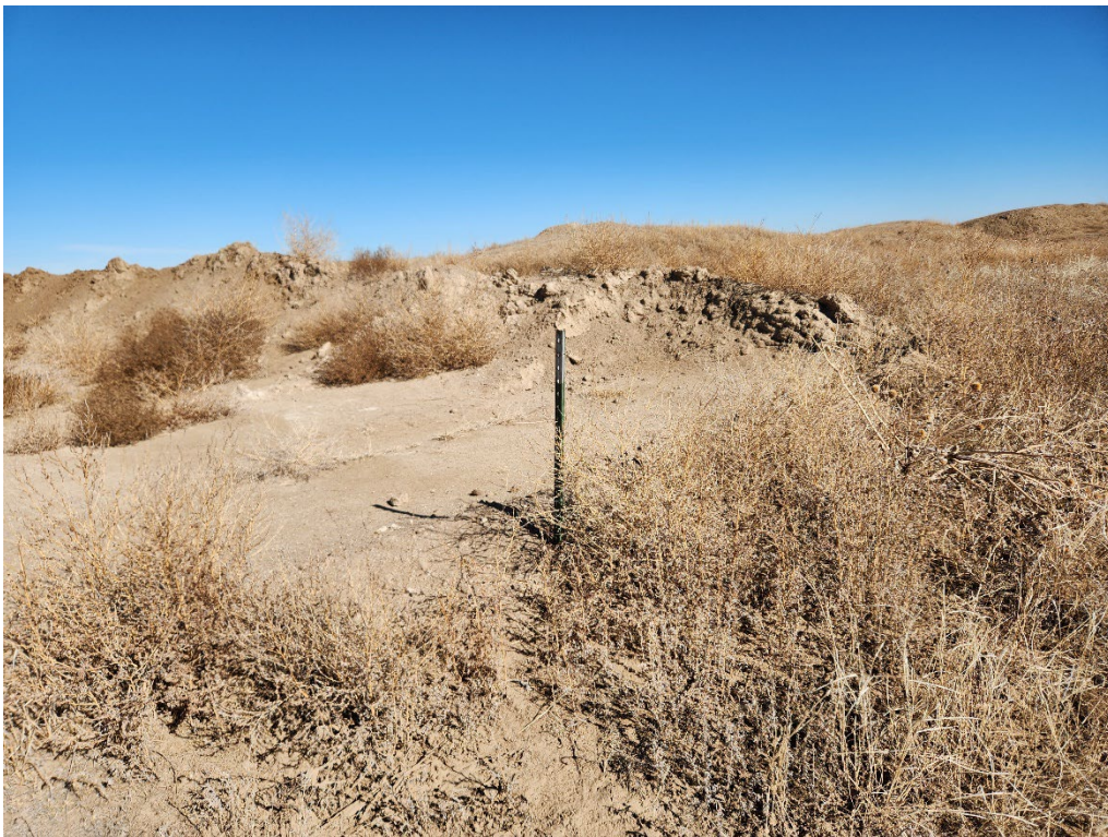
Photo 4. Permit boundary marker in the southwest corner of the site, looking east.