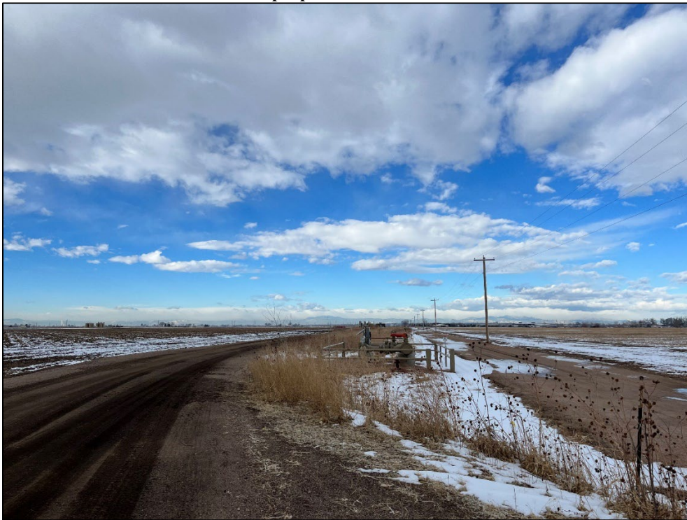
Photo 6: View west from the proposed truck entrance, the utility line runs along the southern edge of the proposed permit boundary.

Richard Miller Western Equipment & Truck, Inc. 1600 Specht Point Road, Suite 209 Fort Collins, CO 80525