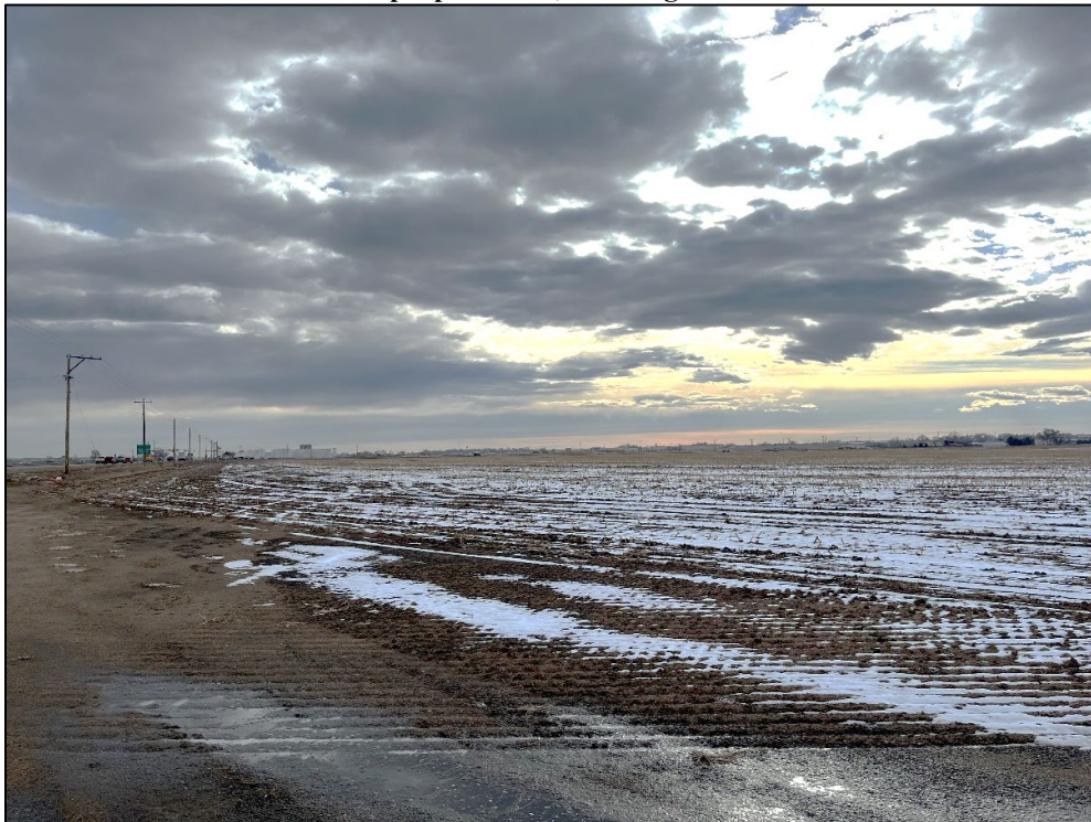
Photo 4: View east of the proposed site, a utility line and ditch are located to the north along Hwy 34.