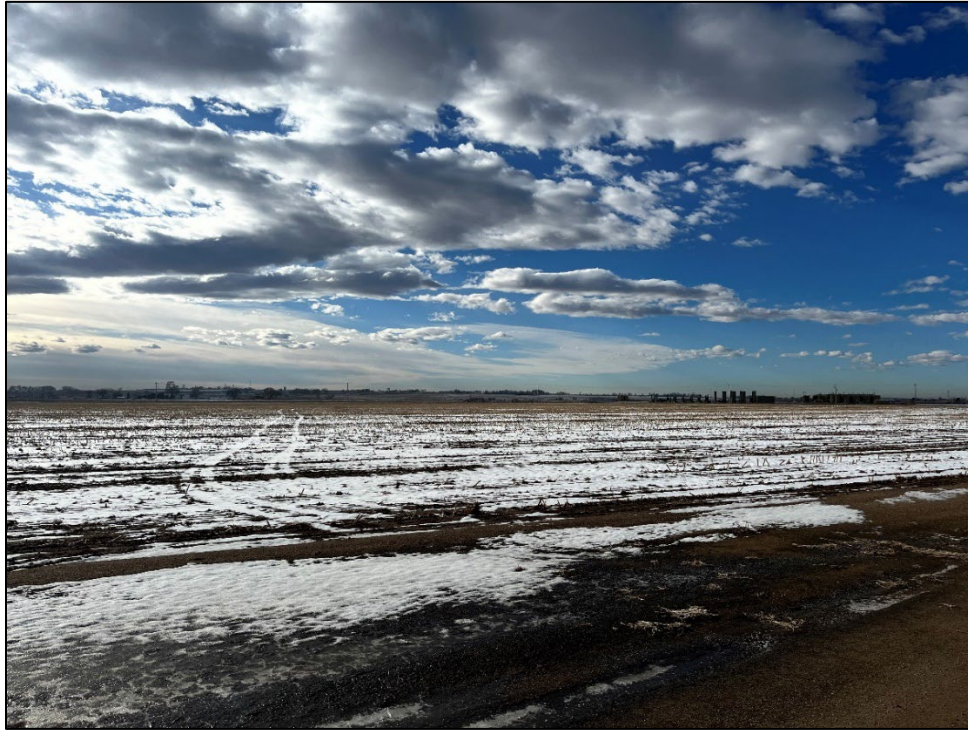
Photo 3: View southeast of the proposed site, oil and gas facilities are visible to the west.