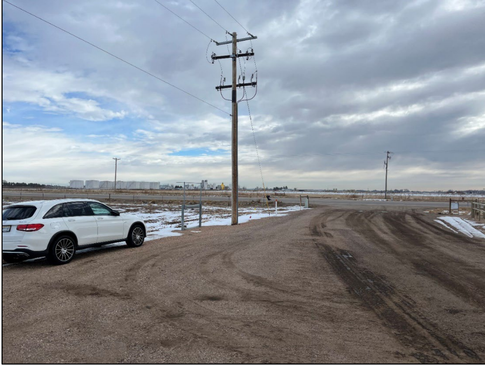
Photo 5: View east of the proposed site haul truck entrance off CR 49.