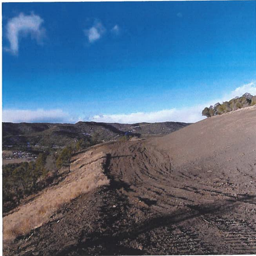
Photo 7 Looking west at south facing slope below internal road.