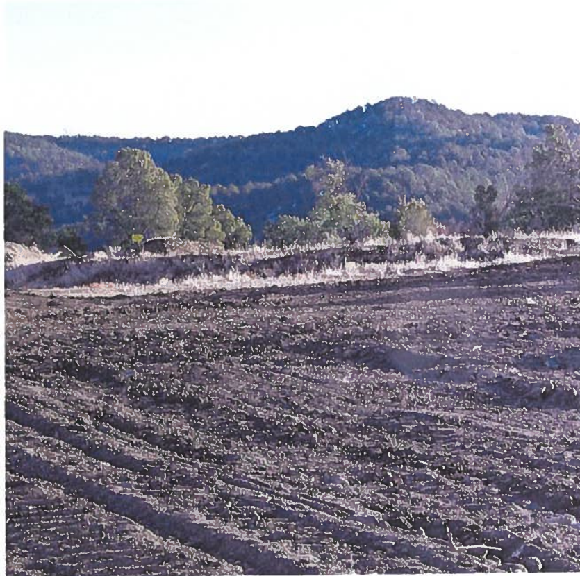
Photo 10 Looking north east across floor at old mine area..