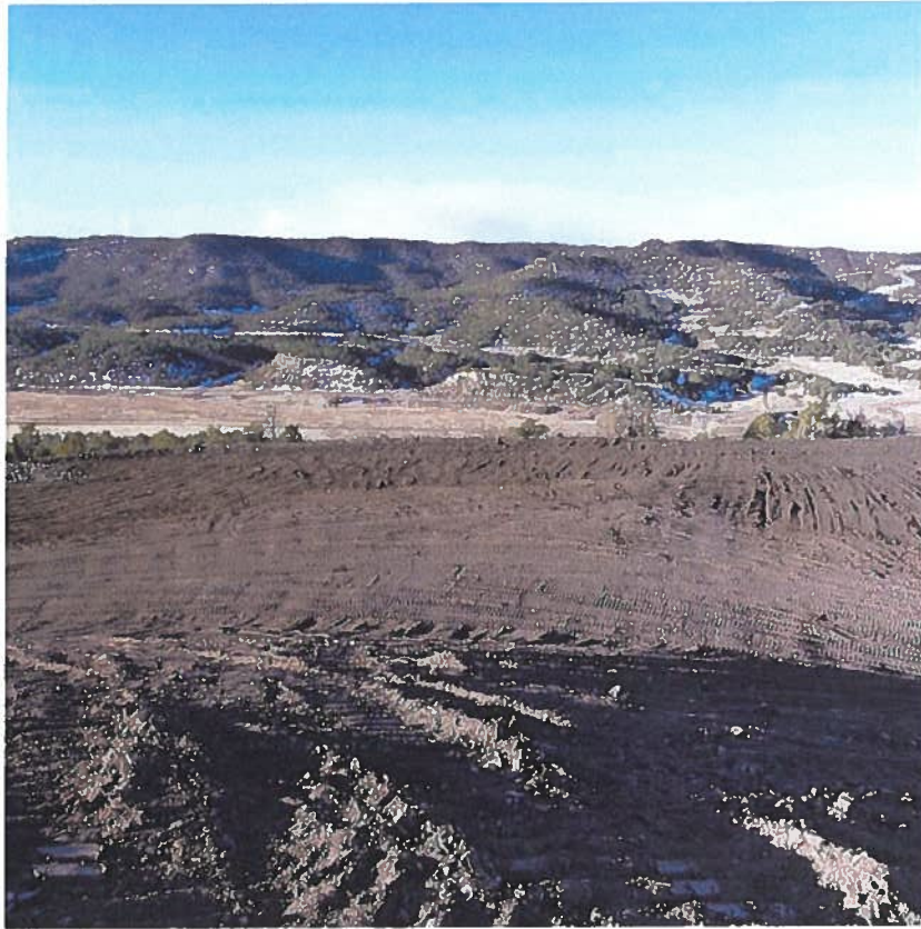
Photo 1 Looking south from top of west end highwall