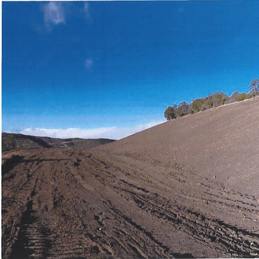
Photo 6 Looking west at west end of reclaimed highwall