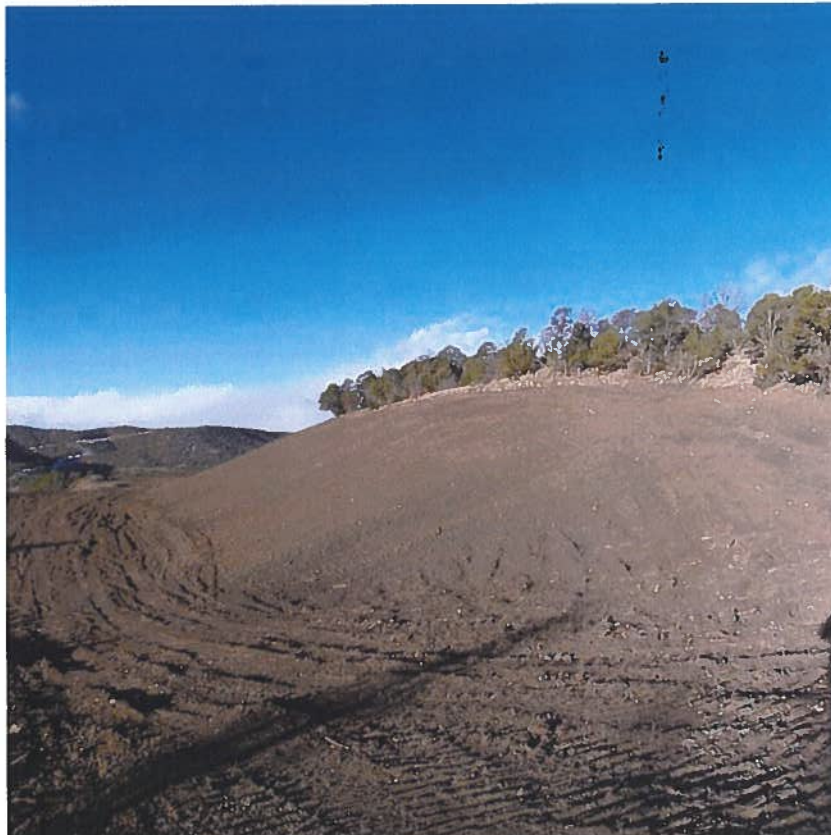
Photo 5 Looking west at east end of reclaimed highwall