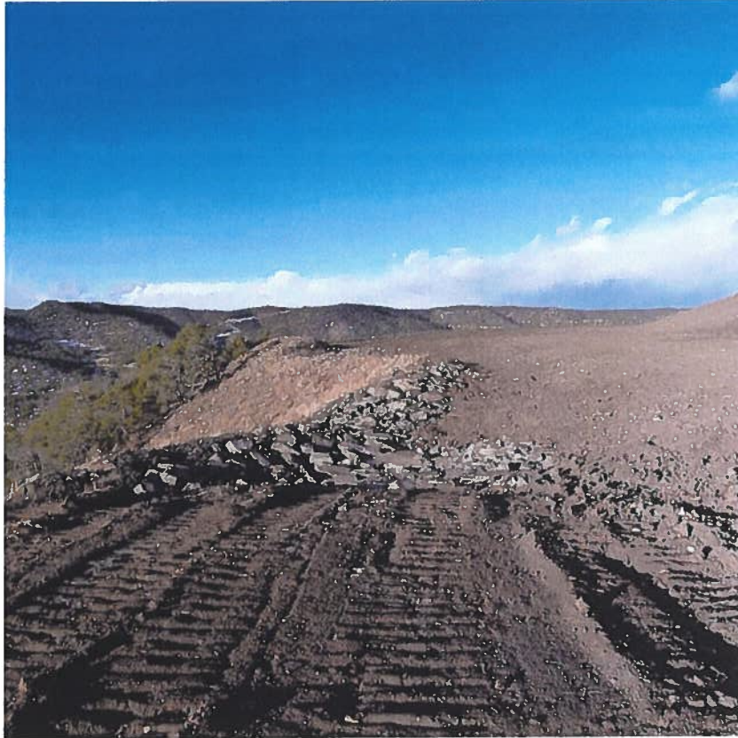
Photo 9A Looking west. Sediment control basin and armored area.