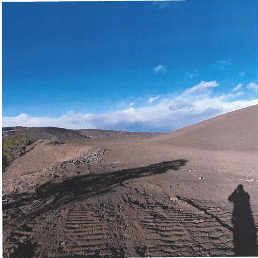
Photo 14 Looking west, MSHA berm area on left, mine floor and slope on right.