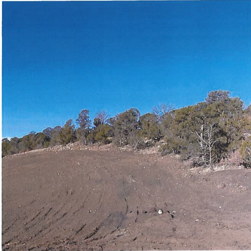
Photo 3 Reclaimed two track road and topsoil berm area on top of highwall