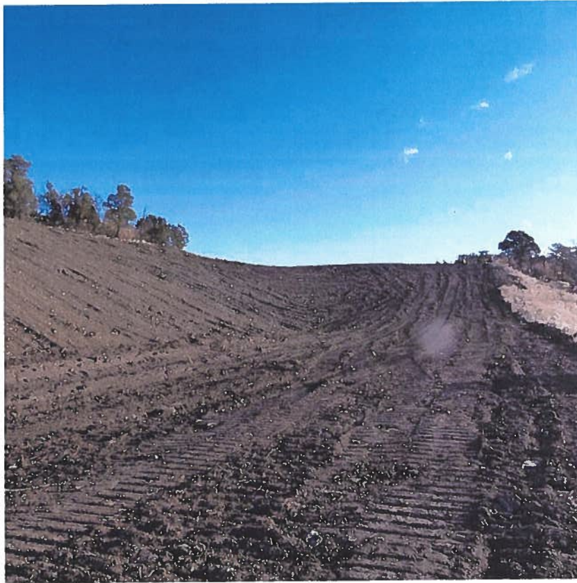
Photo 16 MSHA berm location on right side and pit floor and south facing slope of mined area