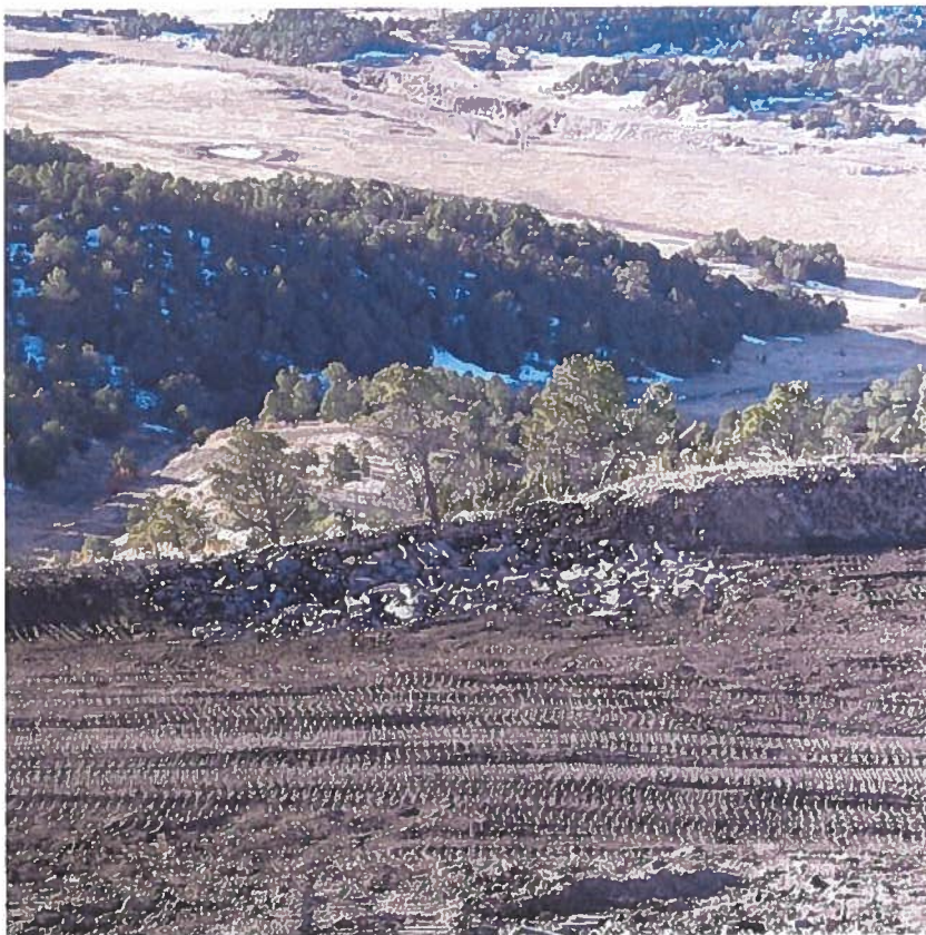
Photo 9B Looking south across mine floor to the sediment basin and armored area.