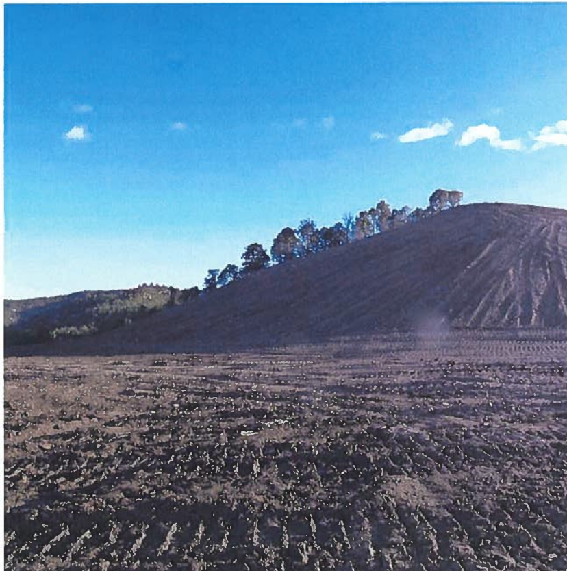
Photo 2 Looking north at western most end of highwall.