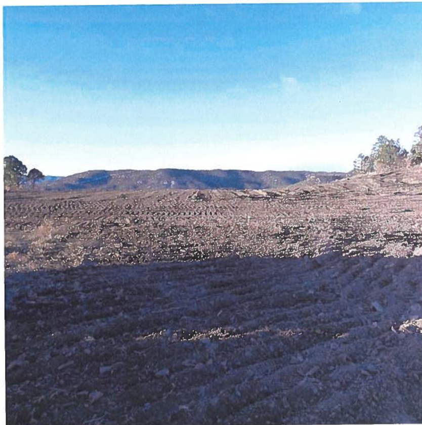
Photo 12 looking west across equipment storage area.