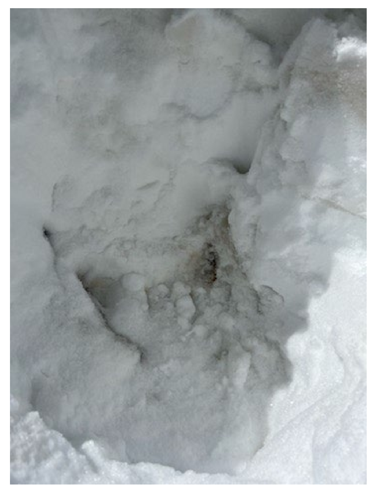
Photograph 3: View of the GV-06 surface water monitoring location after layer of ice was removed. No flowing water was observed at the location. Photo taken 2/26/2024 at approximately 13:20 MST.