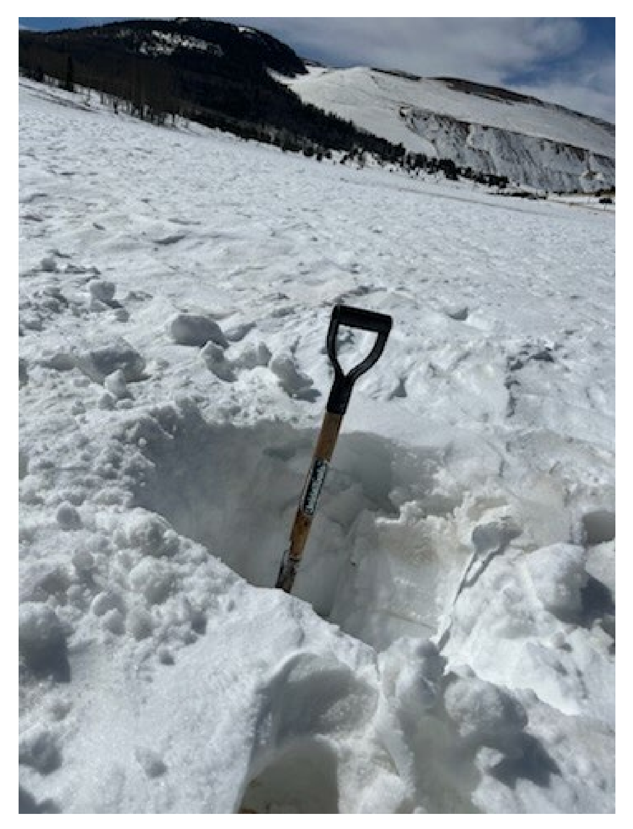
Photograph 4: View of the GV-06 surface water monitoring location showing the depth of the snow, looking west. Photo taken 2/26/2024 at approximately 13:20 MST.