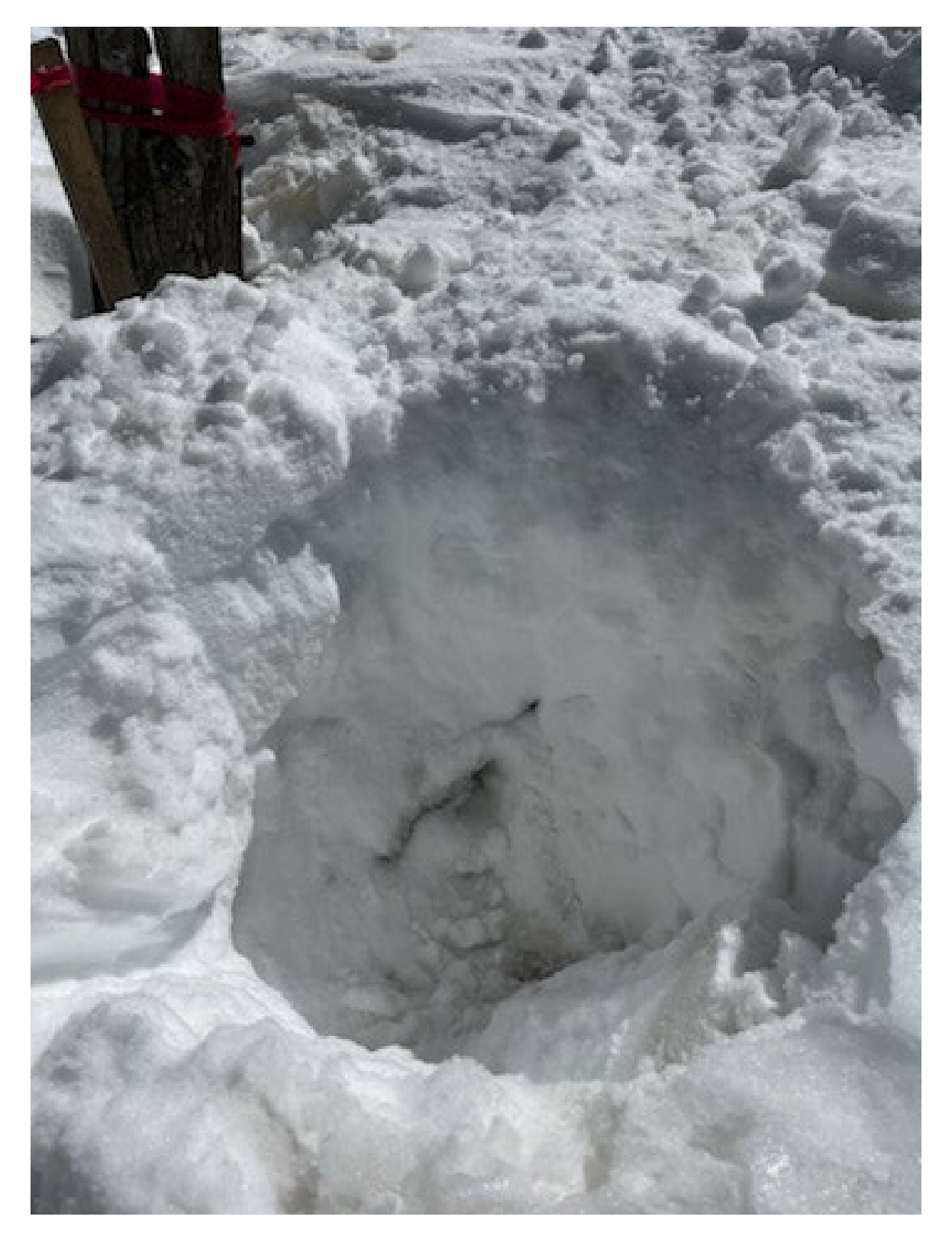
Photograph 2: View of the GV-06 surface water monitoring location, looking southeast. Photo taken 2/26/2024 at approximately 13:20 MST.